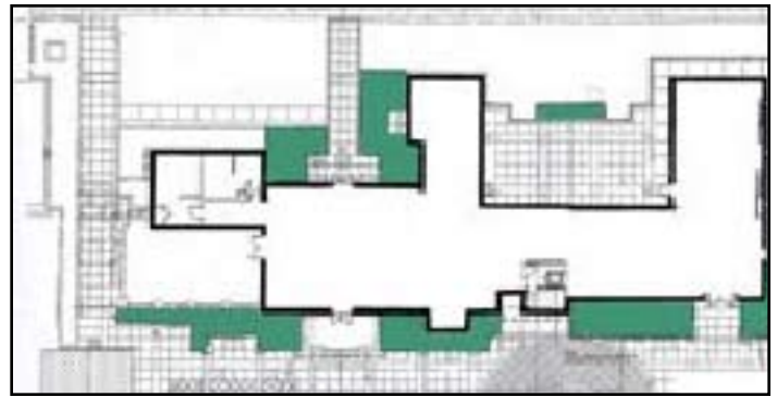
New landscape plan showing new paving patterns and raised planters (shown in green).