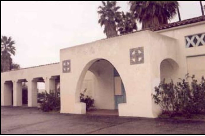
Exit leading to train platform before rehabilitation.

on a slab poured at grade. Historically, minimal changes in elevation between the surrounding grade and the interior floor permitted passengers to pass smoothly from the sidewalk through the building and on to the railroad platform. This gradual, almost imperceptible, change in grade was a significant aspect of the building's design.