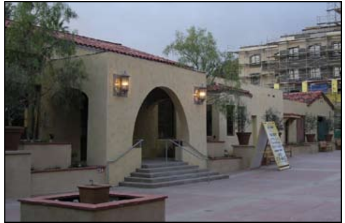
Exit with new steps to former train platform after rehabilitation.

When the building was relocated on the site, it was placed