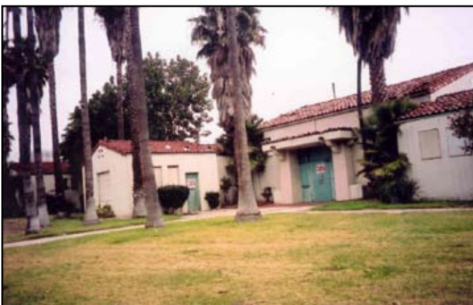
Primary street elevation before rehabilitation.

The extensive reconfiguration of the site significantly altered the historic setting of the depot. Originally, the building sat