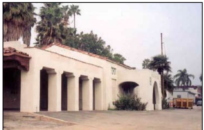
Passenger waiting area before rehabilitation.

However, as more details of the project were provided, it became apparent that the proposed site development would have a negative impact on the historic character of the prop-