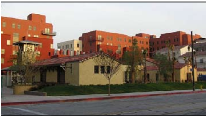
View from northwest corner of depot after rehabilitation showing the surrounding new construction.

Furthermore, the formerly expansive, almost pastoral, landscape that surrounded the depot consisting largely of grass-covered areas dotted with small shrubs, olive trees, and clusters of palm trees has been drastically reduced by the new construction. In addition, the height, massing, scale, and proximity of the new construction dwarf the historic depot building. The cumulative effect of all these changes negatively impacts the historic character of the former depot. Accordingly, the project does not meet the Standards.