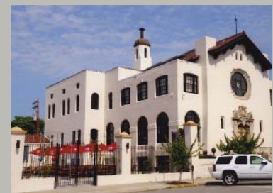
Central States Life Insurance Co. Building, St. Louis, MO

The former Central States Life Insurance Company Building recently became the headquarters of Chameleon Integrated Services (CSI), a St. Louis, MO-based information technology firm, following a $3 million rehabilitation. Individually listed in the National Register, this 1921 Mission Revival-style building was designed for a local corporate headquarters, complete with an impressive two-story atrium. Later used for many purposes, and most recently as a series of nightclubs, CSI purchased the building and returned it to its original use as corporate offices. The building's exterior and surviving historic features on the inside were restored, and state-of-the-art security systems installed. Twenty-seven percent of the work was completed by minority-owned businesses from Greater St. Louis. With their new offices and a building rich in architectural detail, CSI has not only saved an impressive historic resource, but also is contributing to the rebirth of the local community.