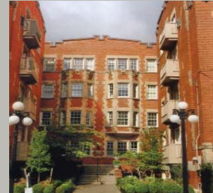
Trinity Place Apartments, Portland, OR