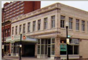
The Rialto Theater, Cleveland, OH

The recent rehabilitations of the Rialto Theater in Cleveland, OH and the Central States Life Insurance Company Building in St. Louis, MO, have numerous things in common that highlight the successful use of the historic tax credits: both buildings were acquired by local companies seeking to expand; both buildings had been vacant a number of years following their last use as nightclubs; their new uses were welcomed by the surrounding neighborhood; their start to finish time were less than 18 months; and each involved a multi-million dollar investment. Both rehabilitations preserved the historic character-defining features and received certifications by the NPS in FY 2014.