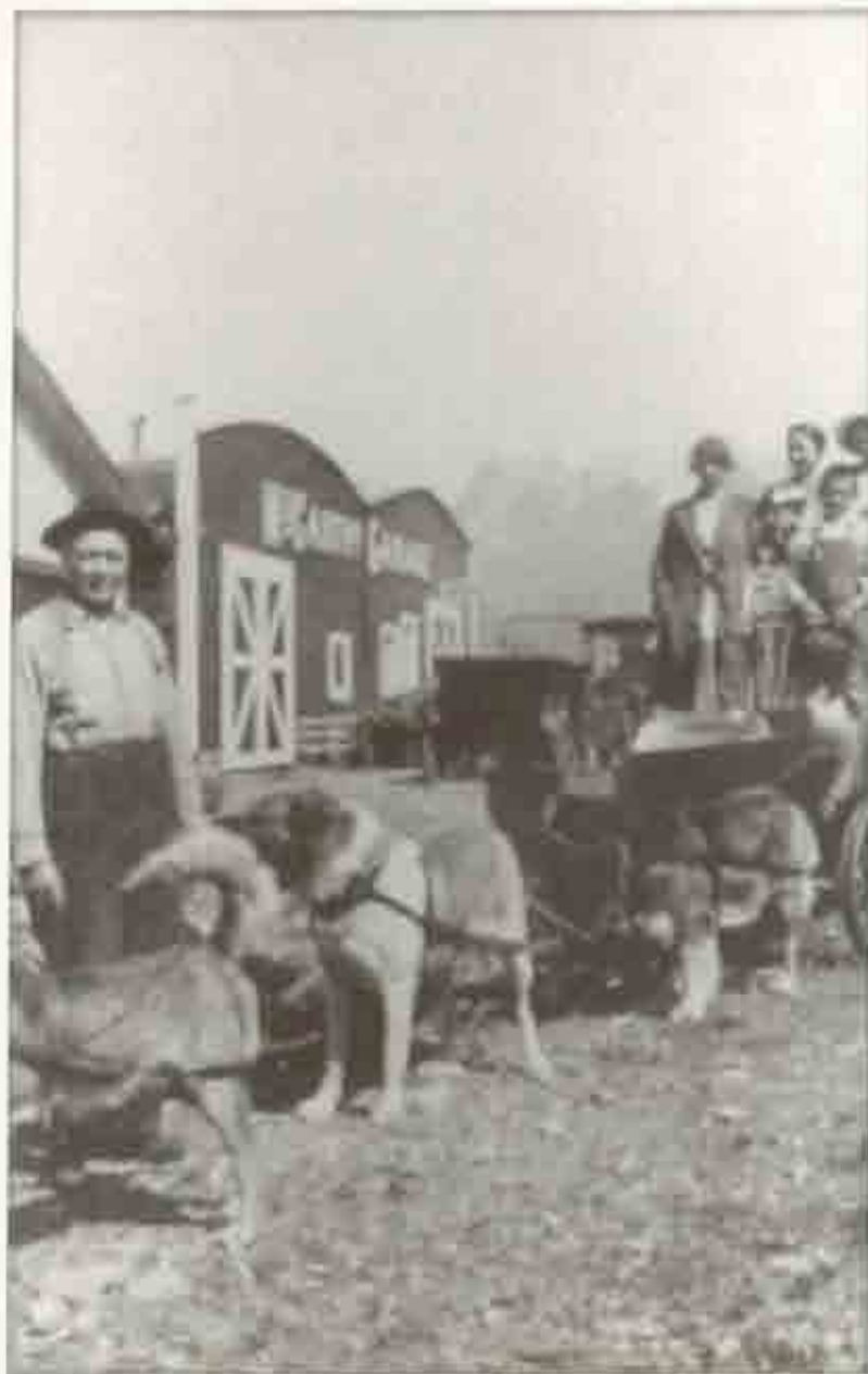
Dog-drawn vehicle stands near the McCarthy Garage.