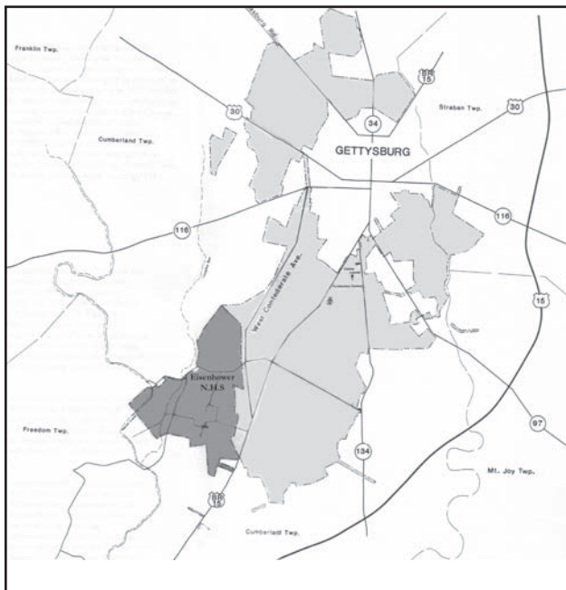
Figure 0.2. Vicinity map (Park shaded in dark gray).

After his return to the country in 1952, General Eisenhower was elected the thirty-fourth President of the United States. While living in the White House, he and Mrs. Eisenhower initiated renovations to the farm. In 1953 construction began, and a new farmhouse was built around a salvaged section of the original house. In addition to the new home, other farm buildings were rehabilitated, and an extensive ornamental landscape was installed. By the mid-1950s General and Mrs. Eisenhower began to regularly use the farm as a weekend getaway. The Eisenhowers considered the farm their permanent residence by 1955 and when he left the presidency in 1961, they began to live in Gettysburg full-time.