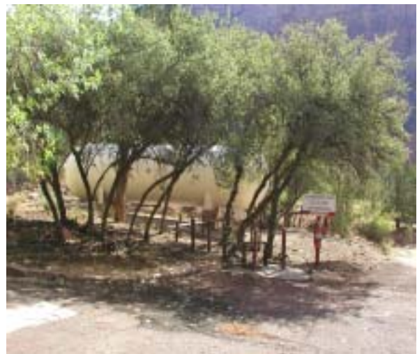
After fuels treatment