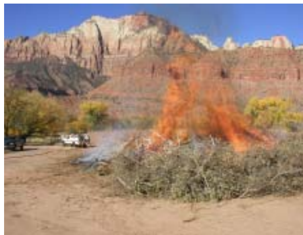
Burning of removed vegetation