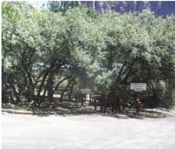
Before fuels treatment

With the recent push to treat more acres in the wildland-urban interface, some parks may be overlooking their own interface issues. These interface areas, and the structures within them, are vital to the operation of the parks and to the millions of visitors who utilize them. Plans must be made to address these park interface areas and insure that they too are protected from the continuing wildland fire threats that are facing our country.