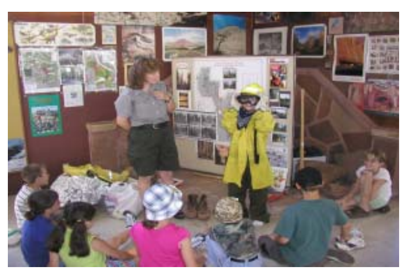
Junior Ranger fire program in parks Nature Center

2006 was another busy year for the Information and Education portion of Zion's Fire Management Program. The park experienced 24 wildland fires that burned 10,792 acres including the Kolob Fire, the largest in the park's history. The FIES served as Information Officer (IOF), either directly or indirectly, on all these incidents. The incidents required the production and dissemination of fire information, both internally and externally, and in a variety of mediums, including press releases, media interviews, park memos, posters and webpages.