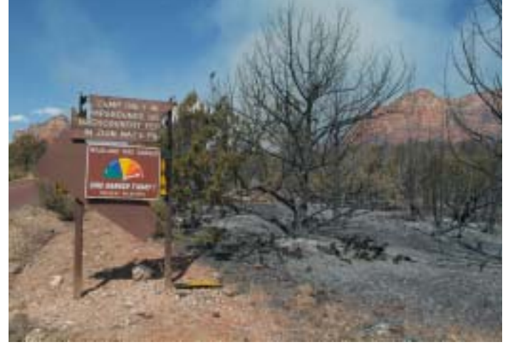
Sign damage from the Kolob Fire