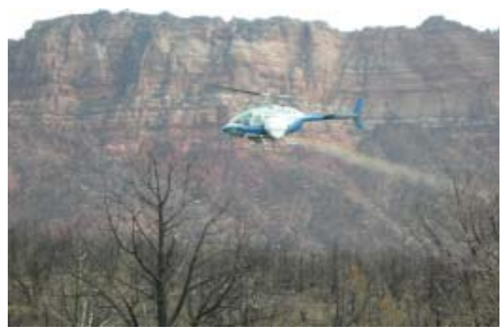
Aerial application of native seed