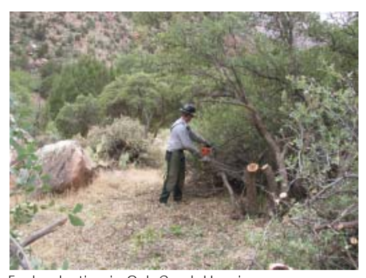
Fuel reduction in Oak Creek Housing area