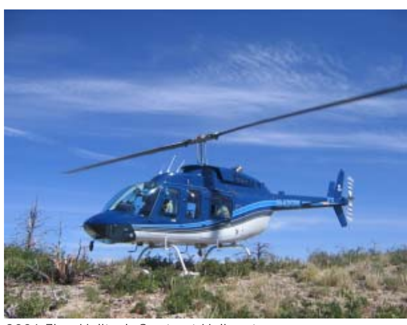
2006 Zion Helitack Contract Helicopter

Due to Color Country Dispatch utilizing a run card system our flight time and responding to fires as an initial attack force increased. We flew a total of 327 hours responding to multiple Search and Rescue's, initial attacked over 35 fires, supported over 15 large fires, went off district three times, supported a couple prescribed fires and several projects.