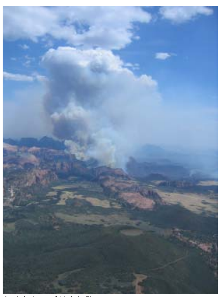
Aerial view of Kolob Fire

The main concern the park has in the aftermath of the Kolob Fire is the invasion of non-native cheatgrass in the burned area. Cheatgrass ( Bromus tectorum ) was accidentally introduced to the United States during the 1890s and has invaded millions of acres of land in the west causing vast environmental and economic impacts. Cheatgrass expansion has dramatically changed fire cycles and plant and animal communities by creating an environment where fires are easily ignited, spread rapidly, cover large areas and occur frequently. The result is a conversion from native shrub and perennial grasslands to annual grasslands adapted to frequent fires.