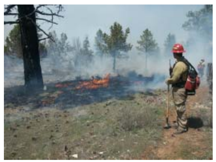
East Mesa Prescribed Fire