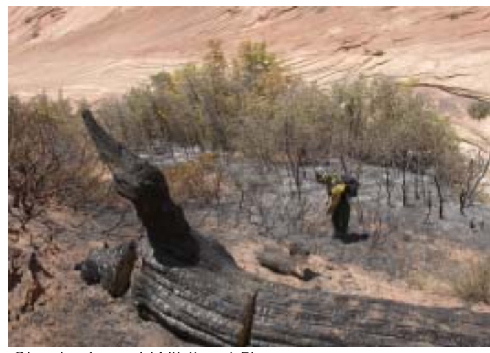
Checkerboard Wildland Fire