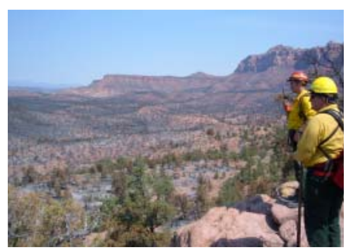
Resource advisors viewing the burned area

To measure the projects effectiveness, a number of monitoring plots were established throughout the burned area that will be evaluated over a three year period. These plots are located in areas that received herbicide only and areas that received both herbicide and native seed. These monitoring plots will be evaluated over a three year period by staff and students from Northern Arizona University under a cooperative Ecosystems Studies Unit Agreement.