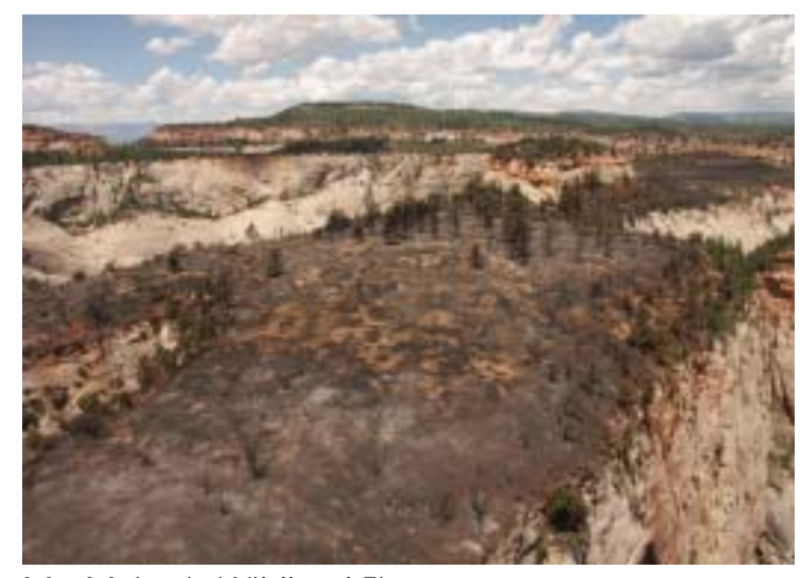
Mt. Majestic Wildland Fire

Support Assignments - 118 (Includes support in interagency wildland and prescribed fire activities)