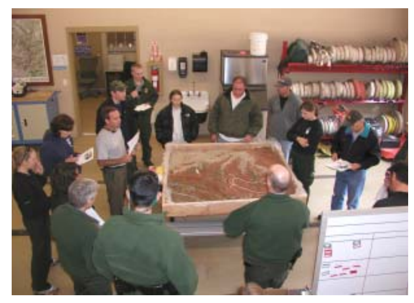
Fire Refresher Training - Sand table exercise