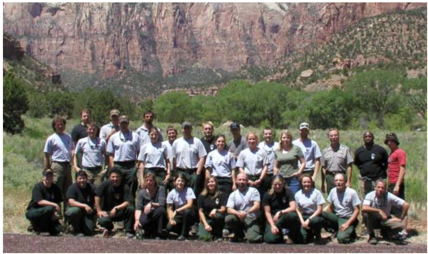
Zion Fire and Aviation Management Staff 2006 (not all present)