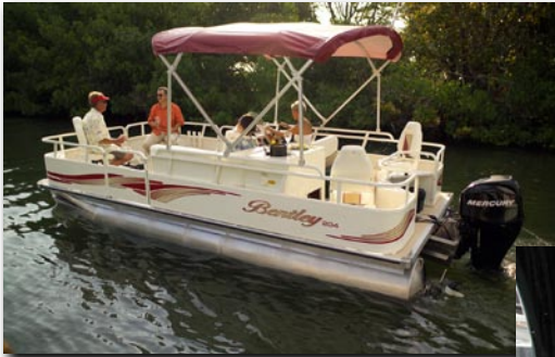
Southern California Marine Association

All areas that can hold water should be drained and dried. Pontoons should be inspected for mussels, settlers, and aquatic weeds that may have mussels attached.