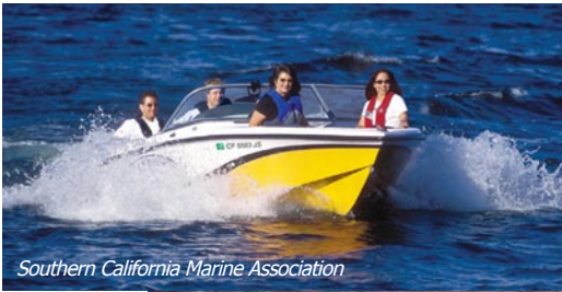
Southern California Marine Association