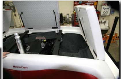
Ski boat covers open.