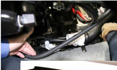
Ballast system water pump, water lines, and caps should all be flushed and cleaned.