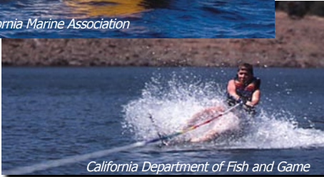
California Department of Fish and Game