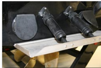
Trim tabs on transom.

Follow these actions to stop mussels from growing inside the entire system. Failure to do so could result in restriction of water lines, overheating and pump damage, as well as the increased likelihood of needing to replace expensive system components.