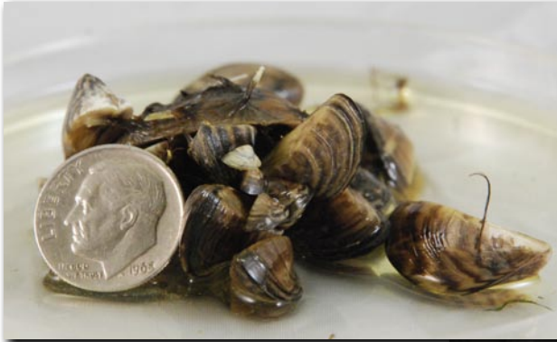
Zebra mussels next to dime.

Quagga/Zebra mussels vary in color and often have dark and light stripes on their shells. They differ in size, from microscopic young to adults an inch or two in length. These invasive mussels cluster in huge colonies.