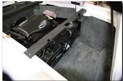
Ski boat ballast water lines.