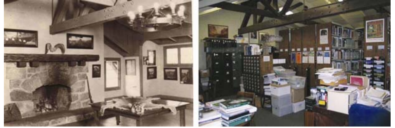
Yosemite Museum: then and now Former "club room" converted into research library

Yosemite's collection of over 2 million items is one of the oldest and finest in the National Park Service in size, value, and complexity. The Yosemite Museum Master Plan is a joint project of the National Park Service and The Yosemite Fund to address renovation and, where necessary, expansion of the museum