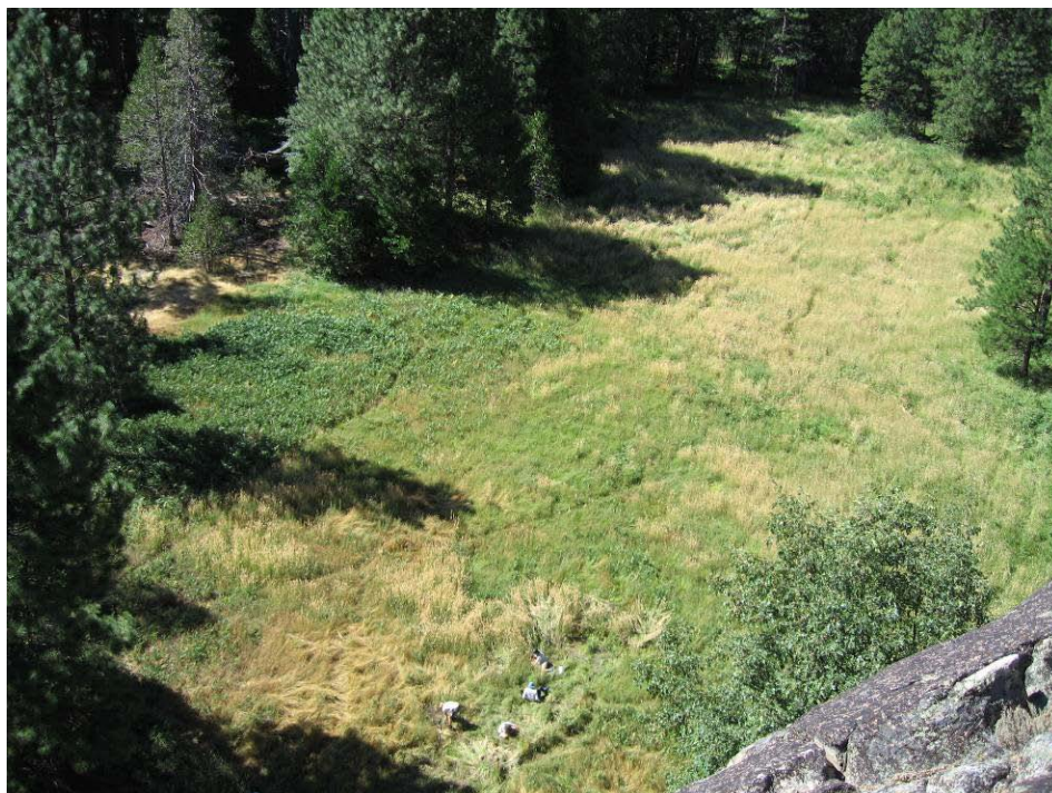
Wilderness crew hand pulling Holcus lanatus (tan patches) in Pate Valley