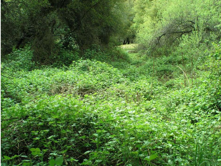
Rubus armeniacus in a riparian area

Update to the Invasive Plant Management Plan. Public interests and concerns will aid in the development of a range of alternatives to address the purpose and need of this project. As a direct result of public input, all comments are made available for review on the park's web site at: http://www.nps.gov/yose/parkmgmt/invasive.htm .