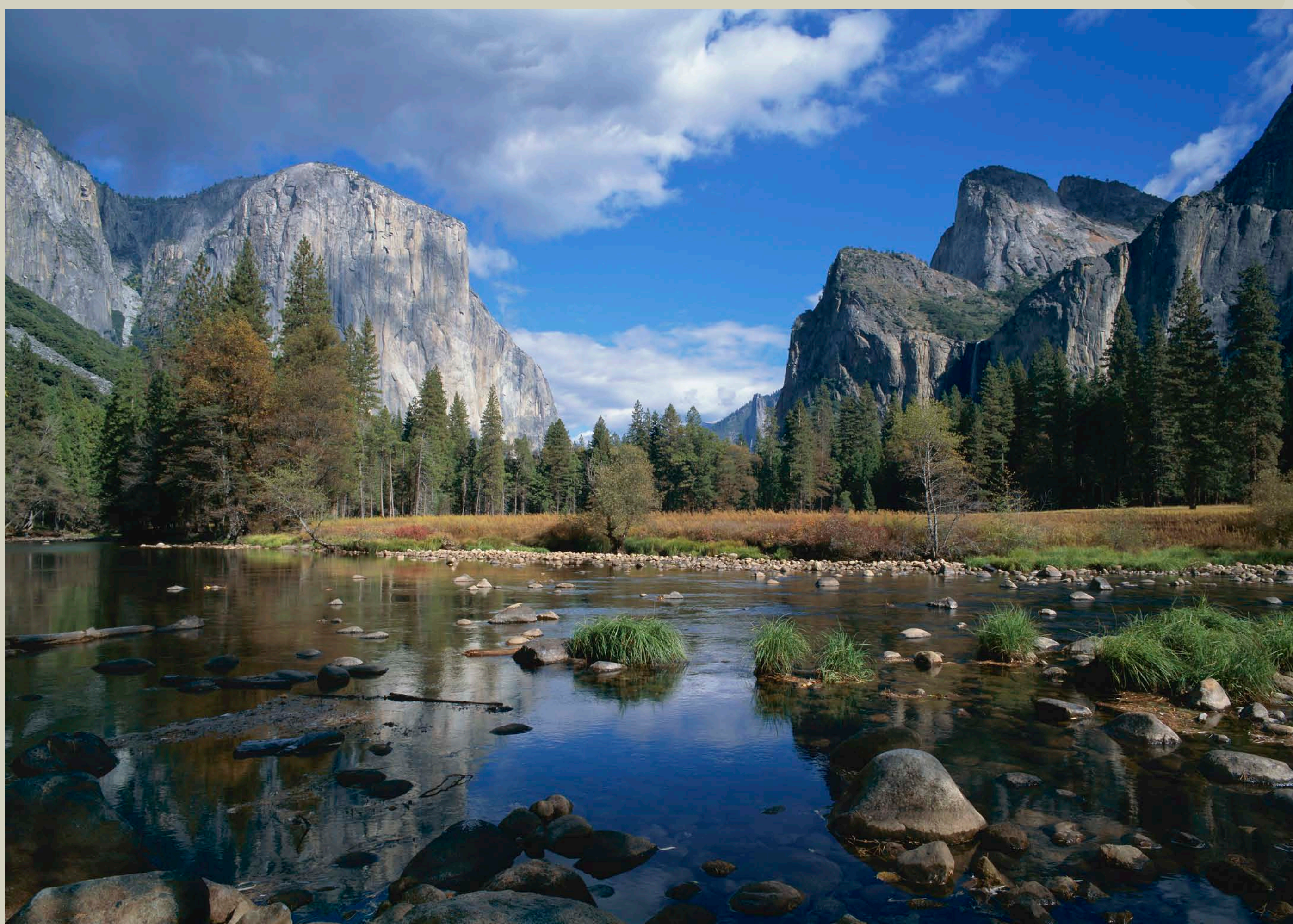
Photo: The Merced River, designated as Wild and Scenic in 1987, flows between granite monoliths of Yosemite Valley.