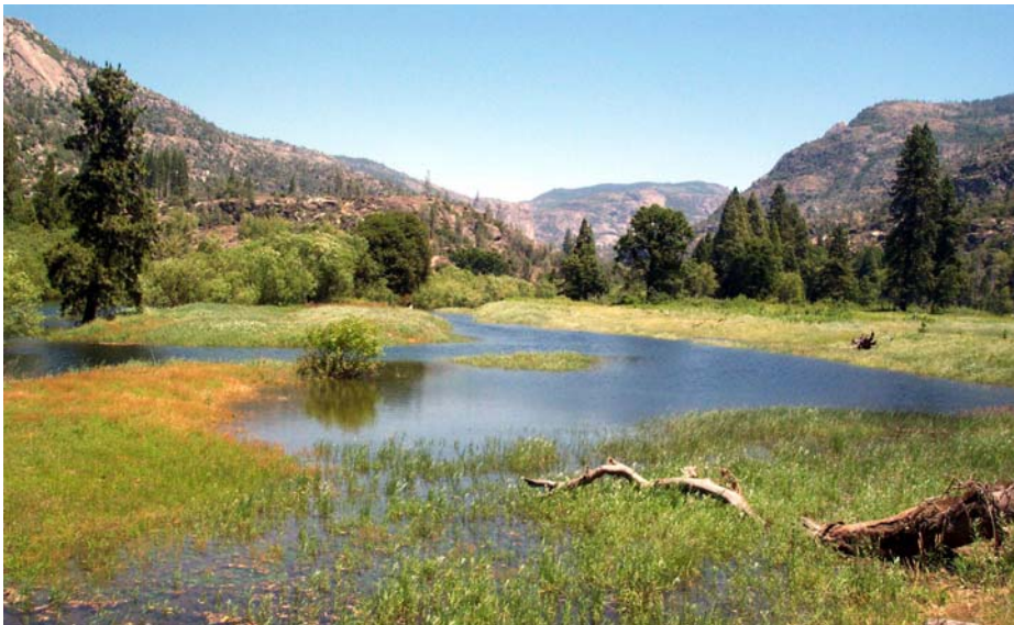
Seasonal flooding in Poopenaut Valley, below Hetch Hetchy Reservoir

Wilderness: The 1979 study concluded that wilderness characteristics were not an outstandingly remarkable value of the river below Hetch Hetchy Reservoir. However, the current study concludes that wilderness, although not identified as a discrete category, contributes to and protects the outstandingly remarkable values in segment 6, which begins a mile below the reservoir and extends to the park boundary. All segments of the river except segment 5 (the mile immediately below the reservoir) include land and water that is designated Wilderness in the National Wilderness Preservation System.