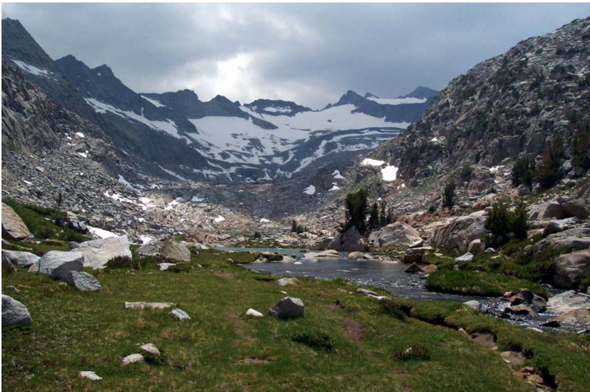
The Lyell Fork of the Tuolumne River, near Lyell Glacier

The Final ORV Report will not represent a static set of ORVs; rather, these values will be open to review and revision if new scientific and scholarly information is revealed or further guidance is developed.