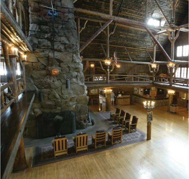
Historic preservation has maintained the appearance and condition of the famous Old Faithful Inn lobby, shown here in the first half of the 1900s (top) and in 2003 (bottom).