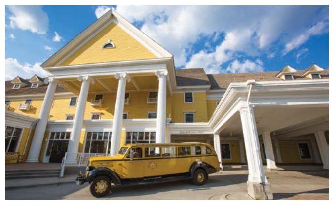
Lake Hotel resembled other hotels financed by the Northern Pacific Railroad when it opened in 1891.

The hatchery was thought to be among the most modern in the West. The main room was outfitted with tanks and raceways for eggs, fingerlings, and