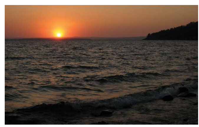
Some of the earliest intact cultural deposits in the park have been found at a site on the shore of Yellowstone Lake.

increase, both in number and the variety of types (style), which may indicate an increase in the number and diversity of peoples using the area. Most documented sites in the park date to the Archaic period (8,000–1,500 years ago), suggesting that may have been the most intense period of use by pre-park peoples. Recent archeological surveys have identified a large number of sites dating to later periods in prehistory (approximately 1400–1800 CE). Distinguishing use of these sites by different ethnic groups or specific tribes, however, has not yet been possible.