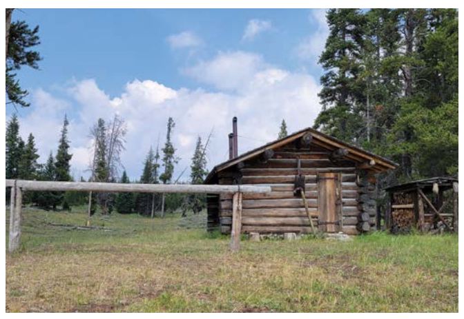
Pelican Springs backcountry cabin is an example of early rustic style of national park architecture.

Backcountry cabins are part of a large network of patrol or snowshoe cabins, based on a geographically strategic patrol operation established during the military administration of the park (1886–1918), and expanded by the National Park Service (1918–present). The original purpose of these cabins was to prevent poaching and vandalism.