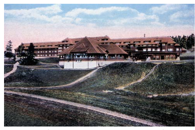
The Fountain Hotel (left) and Grand Canyon Hotel (right), shown here from Haynes postcards, are two of several hotels that are no longer standing in Yellowstone.