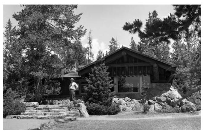
The Madison Information Station, c. 1930s.

Overlooking a meadow beyond which the Gibbon and Firehole rivers join to form the Madison River, the Madison Museum was intended to focus on park history, especially the nearby site where the 1870 Washburn Expedition was thought to have originated the idea of a national park as a way to protect the thermal areas from commercial development. In