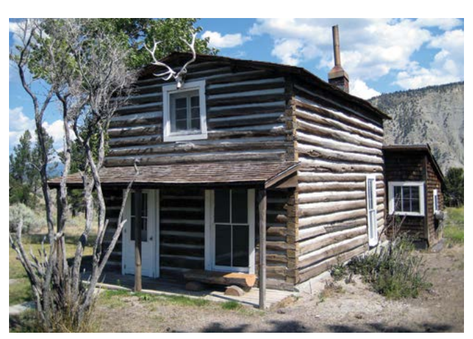
The mail carrier's house, built around 1895, photographed at an unknown date (left) and in 2009 (right).