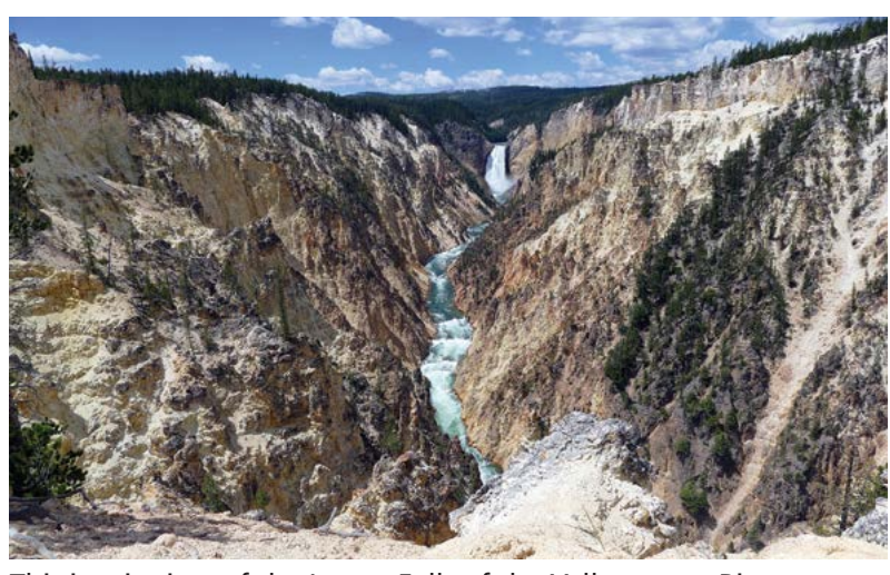
This iconic view of the Lower Falls of the Yellowstone River was photographed from Artist's Point. Artist's Point was named to recognize the crucial role of the work of artists in the creation of Yellowstone National Park. The work of photographers and painters like Thomas Moran, persuaded distant legislators of Yellowstone's awesome beauty and natural and cultural significance.

eligible for the National Register and to ensure new undertakings are compatible with them.