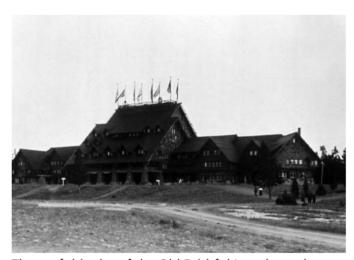
The roof shingles of the Old Faithful Inn, shown here in 1912, were originally coated with a red mineral paint believed to hinder flammability.

Named for the nearby geyser, the Old Faithful Inn exemplifies the use of rustic architecture at a large scale to complement a natural landscape. The rhyolite that formed Yellowstone's caldera during volcanic upheavals provided the stone for the building's foundation, and local lodgepole pine the logs for its walls. Skilled