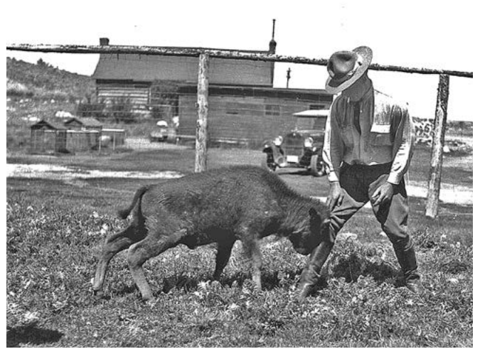
Bison calf butting park ranger at the buffalo ranch, 1930s.