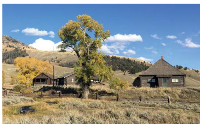
The Lamar Buffalo Ranch, in operation from 1906 until the 1950s, was the center of efforts to increase the herd size of bison in Yellowstone.

The Old Faithful Inn was designated a National Historic Landmark in 1987. A major renovation program of the Old House was launched in 2004 to meet current building codes and restore the lobby so that it more closely replicates Reamer's original design. The walls and roof were reinforced with steel to make the structure more seismically stable, and electrical, plumbing, and heating systems were replaced and made less conspicuous. With the completion of this program, the Old Faithful Inn is considered to be in good condition.