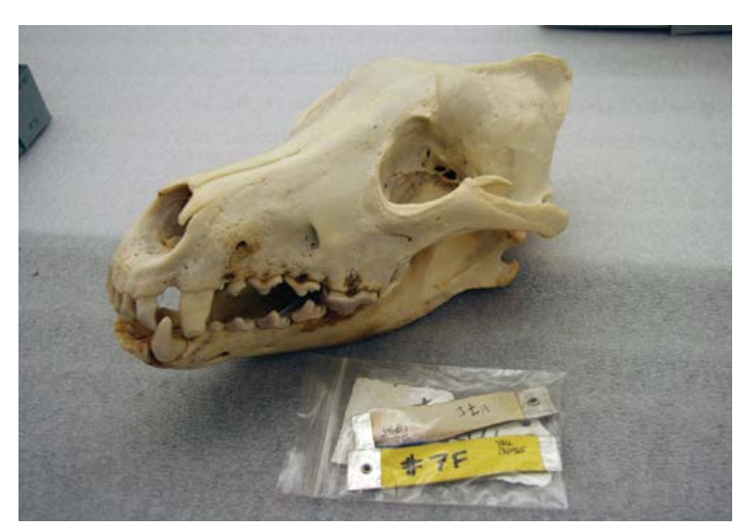
One of more than 150 skulls and skeletal materials in the museum collection from the park's Wolf Project, wolf 007F was released in Yellowstone in 1995 as a Rose Creek pup. She joined 002M from the Crystal Creek pack in 1996 to form the Leopold Pack, the first naturally formed pack of the new era. She was killed by wolves of the Geode Creek pack in 2002.

While the Heritage and Research Center does have some rotating exhibits in the lobby area, the