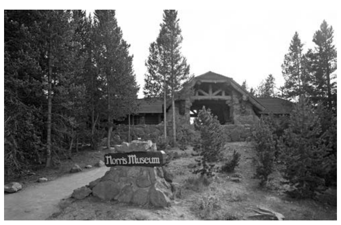
The Norris Geyser Basin Museum, c. 1930.

scored concrete floor, and plywood covers were removed to reveal original windows that had been covered to accommodate shelving in the book sales area. The museum display cases (many designed and built by Dr. Carl Russell) were also rebuilt to accommodate shatter proof glass and reinstalled.