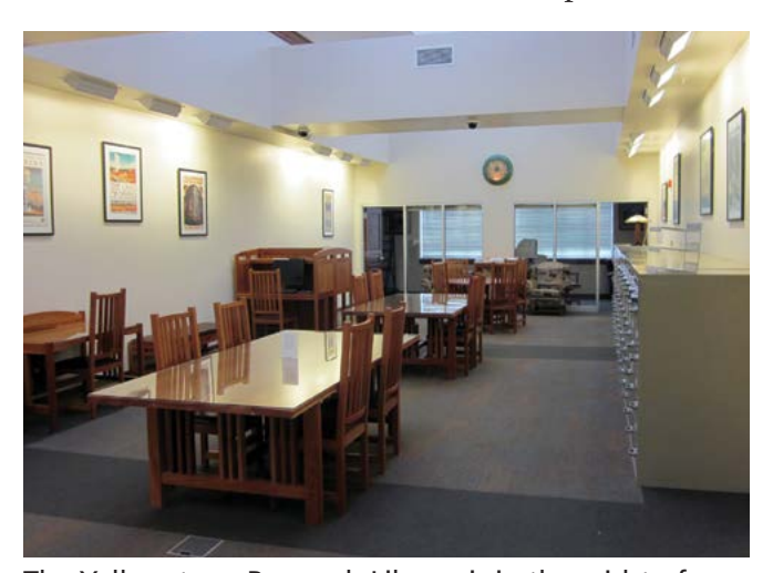
The Yellowstone Research Library is in the midst of a digitization project that will make library records accessible online.

The mission of the Yellowstone Research Library is to collect published and unpublished materials related to the greater Yellowstone ecosystem and to make these materials available to park staff,