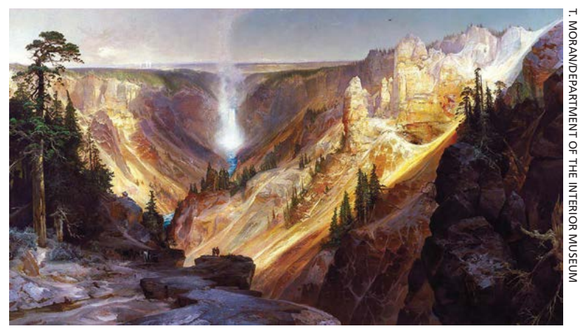
Grand Canyon of the Yellowstone River. Oil on Canvas 1872 by Thomas Moran.