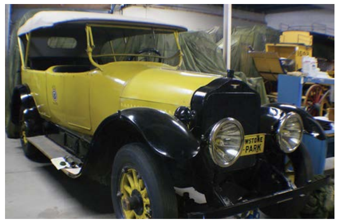
Yellowstone's historic vehicle collection, one of the largest in the National Park System, includes this 1917 touring car.

The majority of the vehicles were received from TW Recreational Services, Inc. (successor to the