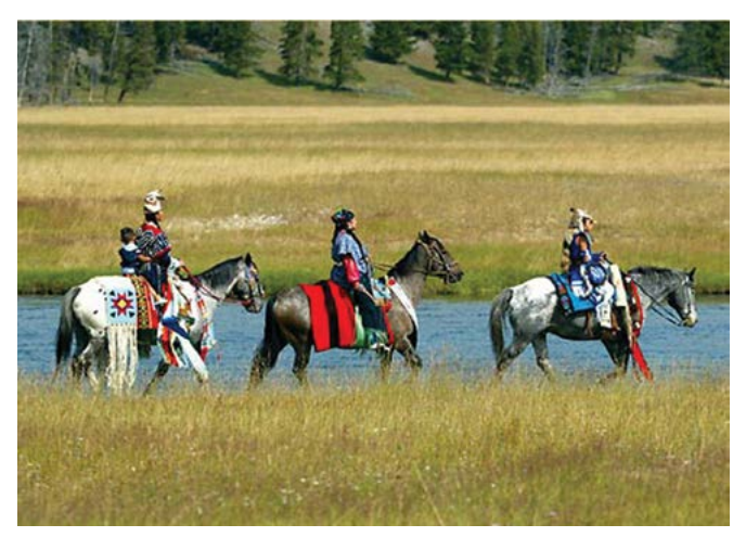
Nez Perce tribal members in traditional regalia ride along the Firehole River during a memorial ceremony in 2004.

The first tribes to request association came forward in 1996. Now 27 American Indian tribes are formally associated with Yellowstone. Since 2002, park managers have met periodically with tribal