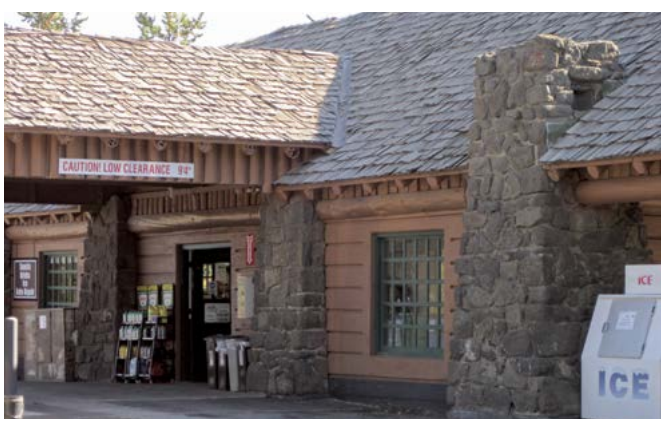
The Old Faithful Upper Service Station, built in 1929, is an example of rustic architecture, intended to enhance rather than detract from the setting of the Old Faithful Geyser.

The legal requirement to protect and understand the importance of these resources affects how the park is managed today. So far, 843 structures including roads, bridges, utility structures, and grave