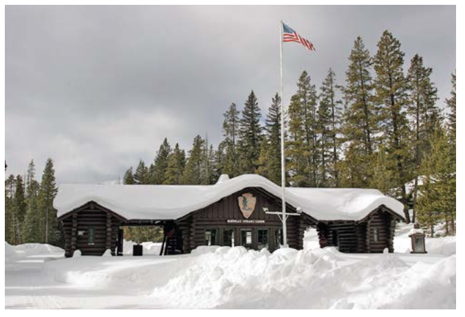
Northeast Entrance station is considered "the best of its type remaining in the National Park Service."

The entrance station was constructed with two traffic lanes passing through it. When it became necessary to accommodate the increasing number of recreation vehicles too tall to fit in the passage, a lane was added to each side of the building rather than alter it.