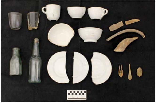
Selection of meal-related artifacts manufactured from 1883 to 1923 recovered from a refuse dump near Lake Lodge. These items include drinking glass tumblers; condiment bottle; soda bottle; hotelware mug, teacups, bowls, and plates; fork and spoon; and rib and roast cuts of bison or beef. They were commonly used by concessioners throughout the park.

The majority of historical archeological sites in the park are associated with tourism in some manner. Examining these types of sites help us trace the park's history. Tourism is directly connected to larger social and economic changes occurring across America, including widespread settlement of the American West, and the increasing shift