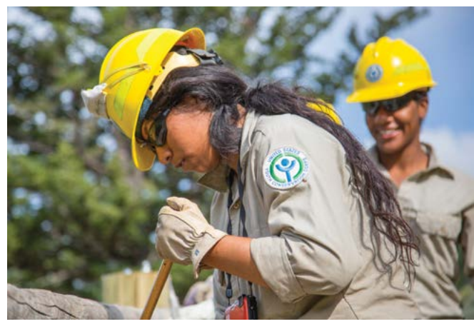
The Yellowstone Youth Conservation Corps provides an opportunity for young people aged 14-17 to come work, live, and learn in Yellowstone National Park.

In 2016, the Executive Committee of the Blackfoot Nation contacted Yellowstone National Park to request that the names of two locations inside the park be changed. National place names are managed