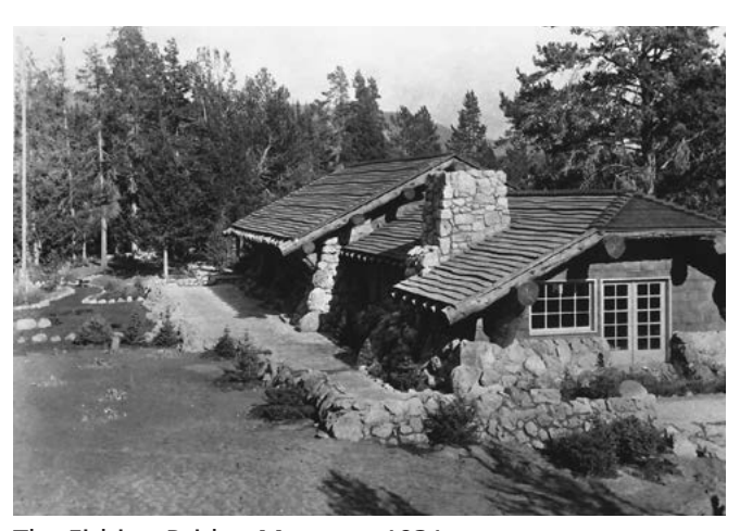
The Fishing Bridge Museum, 1931.

Antlers, rams' horns, and bighorn sheep skulls still decorate the two wrought-iron chandeliers, but they were removed from the log frame around the screen in the adjacent amphitheater, where the original log seats have been replaced with thick plank seats. No longer used, the fireplace beneath the large stone chimney inside the museum is concealed from public view in a small area used for offices. In 2021-2022, linoleum tiles were removed to reveal the original