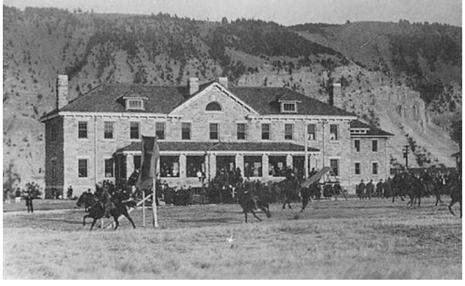
Albright Visitor Center, part of the Mammoth Hot Springs Historic District and Fort Yellowstone Historic Landmark District, housed the first "information office" (visitor center).

The origins of the building at the edge of Fort Yellowstone that became known as the mail carrier's house are unclear, but it is significant as the only 1800s log structure still standing in Mammoth Hot Springs. Its style is more typical of construction of the area and time than the buildings put up by the US Army for Fort Yellowstone. It was probably built in the mid-1890s, and over the years it has provided quarters for mail carriers as well as employees of concessions and the National Park Service.