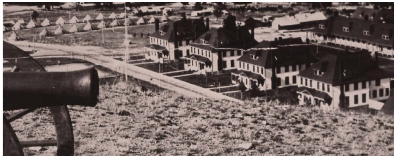
Yellowstone's cultural resources tell the stories of people. Fort Yellowstone was constructed when the US Army administered the park. The protection of resources affects how the park is managed today.