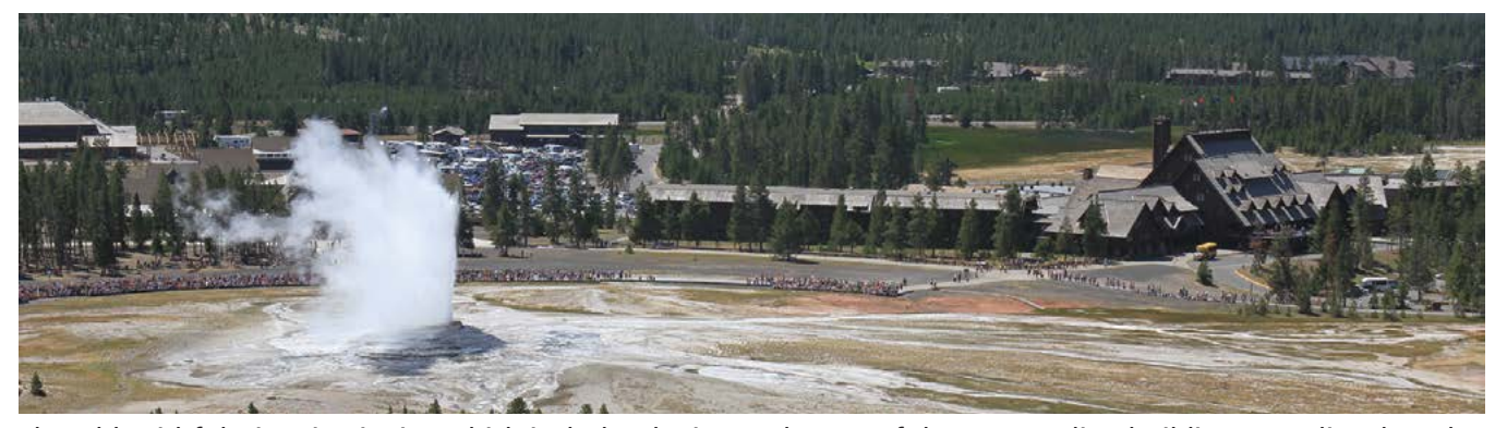
The Old Faithful Historic District, which includes the inn and many of the surrounding buildings, was listed on the National Register of Historic Places in 1982.