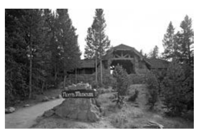
The Norris Geyser Basin Museum, c. 1930.

scored concrete floor, and plywood covers were removed to reveal original windows that had been covered to accommodate shelving in the book sales area. The museum display cases (many designed and built by Dr. Carl Russell) were also rebuilt to accommodate shatter proof glass and reinstalled.