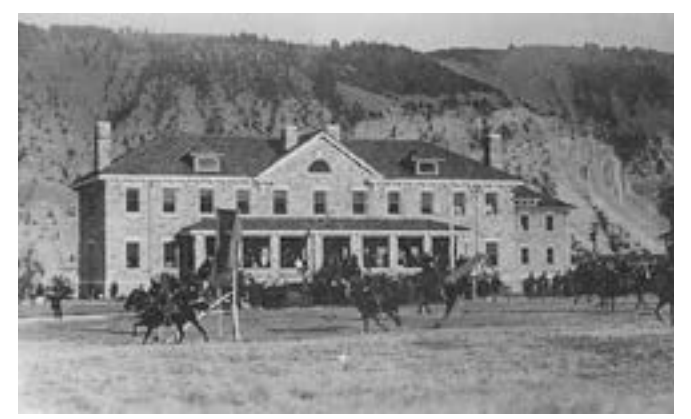
Albright Visitor Center, part of the Mammoth Hot Springs Historic District and Fort Yellowstone Historic Landmark District, housed the first "information office" (visitor center).

The origins of the building at the edge of Fort Yellowstone that became known as the mail carrier's house are unclear, but it is significant as the only 1800s log structure still standing in Mammoth Hot Springs. Its style is more typical of construction of the area and time than the buildings put up by the US Army for Fort Yellowstone. It was probably built in the mid-1890s, and over the years it has provided quarters for mail carriers as well as employees of concessions and the National Park Service.