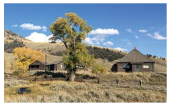
The Lamar Buffalo Ranch, in operation from 1906 until the 1950s, was the center of efforts to increase the herd size of bison in Yellowstone.

The Old Faithful Inn was designated a National Historic Landmark in 1987. A major renovation program of the Old House was launched in 2004 to meet current building codes and restore the lobby so that it more closely replicates Reamer's original design. The walls and roof were reinforced with steel to make the structure more seismically stable, and electrical, plumbing, and heating systems were replaced and made less conspicuous. With the completion of this program, the Old Faithful Inn is considered to be in good condition.