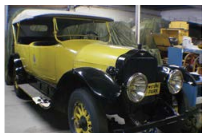
Yellowstone's historic vehicle collection, one of the largest in the National Park System, includes this 1917 touring car.

The majority of the vehicles were received from TW Recreational Services, Inc. (successor to the