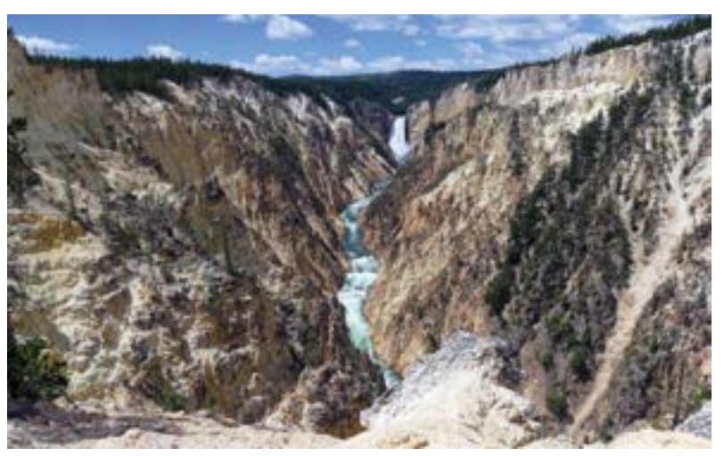
This iconic view of the Lower Falls of the Yellowstone River was photographed from Artist's Point. Artist's Point was named to recognize the crucial role of the work of artists in the creation of Yellowstone National Park. The work of photographers and painters like Thomas Moran, persuaded distant legislators of Yellowstone's awesome beauty and natural and cultural significance.

Shapins Associates, 2006. Cultural Landscape Inventory for Artist Point. National Park Service.