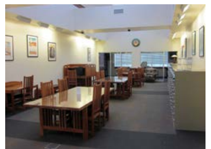
The Yellowstone Research Library is in the midst of a digitization project that will make library records accessible online.