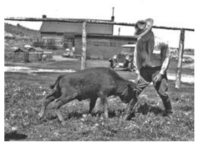
Bison calf butting park ranger at the buffalo ranch, 1930s.