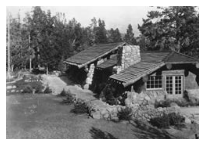
The Fishing Bridge Museum, 1931.

Antlers, rams' horns, and bighorn sheep skulls still decorate the two wrought-iron chandeliers, but they were removed from the log frame around the screen in the adjacent amphitheater, where the original log seats have been replaced with thick plank seats. No longer used, the fireplace beneath the large stone chimney inside the museum is concealed from public view in a small area used for offices. In 2021-2022, linoleum tiles were removed to reveal the original