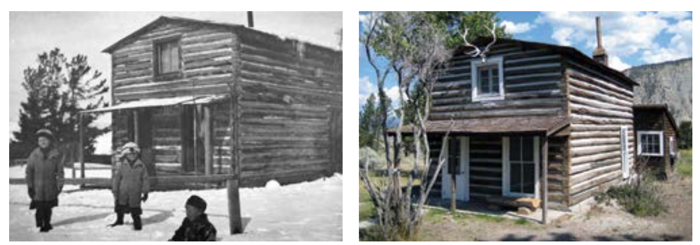
The mail carrier's house, built around 1895, photographed at an unknown date (left) and in 2009 (right).

The cabin was either built by or later sold to an early park concession, the Yellowstone Park Association. A lean-to with a shed roof was built onto the back of the two-room structure in about 1903 to serve as a kitchen and dining area. In the 1930s, a mudroom and bathroom were added to the north side of the building, bringing the total square footage to 512. In the early 2000s, removal of the insulation added to the walls and ceilings in the 1930s exposed