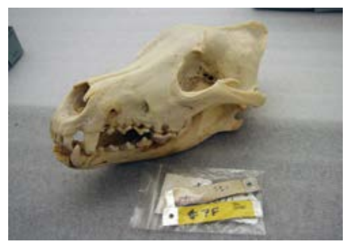
One of more than 150 skulls and skeletal materials in the museum collection from the park's Wolf Project, wolf 007F was released in Yellowstone in 1995 as a Rose Creek pup. She joined 002M from the Crystal Creek pack in 1996 to form the Leopold Pack, the first naturally formed pack of the new era. She was killed by wolves of the Geode Creek pack in 2002.

While the Heritage and Research Center does have some rotating exhibits in the lobby area, the