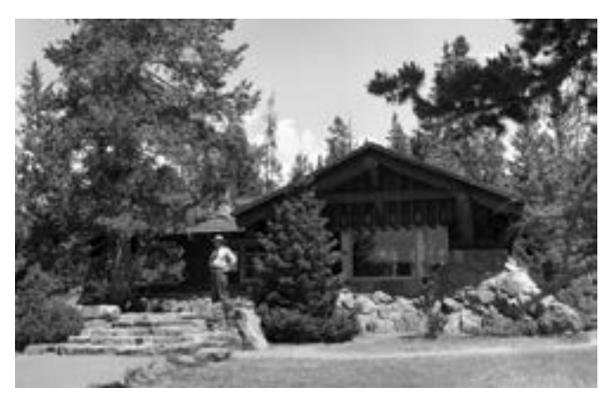
The Madison Information Station, c. 1930s.

Overlooking a meadow beyond which the Gibbon and Firehole rivers join to form the Madison River, the Madison Museum was intended to focus on park history, especially the nearby site where the 1870 Washburn Expedition was thought to have originated the idea of a national park as a way to protect the thermal areas from commercial development. In