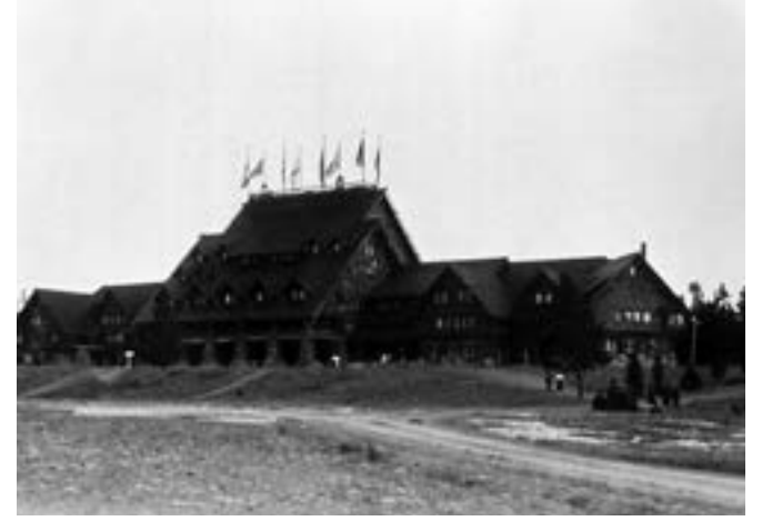
The roof shingles of the Old Faithful Inn, shown here in 1912, were originally coated with a red mineral paint believed to hinder flammability.

Named for the nearby geyser, the Old Faithful Inn exemplifies the use of rustic architecture at a large scale to complement a natural landscape. The rhyolite that formed Yellowstone's caldera during volcanic upheavals provided the stone for the building's foundation, and local lodgepole pine the logs for its walls. Skilled