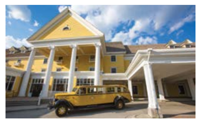
Lake Hotel resembled other hotels financed by the Northern Pacific Railroad when it opened in 1891.

The hatchery was thought to be among the most modern in the West. The main room was outfitted with tanks and raceways for eggs, fingerlings, and