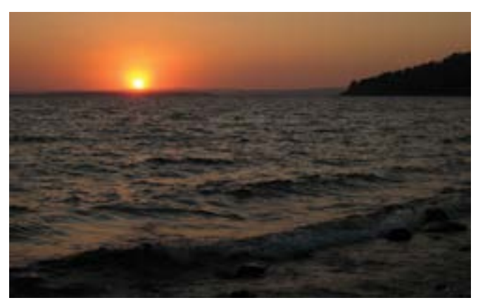
Some of the earliest intact cultural deposits in the park have been found at a site on the shore of Yellowstone Lake.

increase, both in number and the variety of types (style), which may indicate an increase in the number and diversity of peoples using the area. Most documented sites in the park date to the Archaic period (8,000–1,500 years ago), suggesting that may have been the most intense period of use by pre-park peoples. Recent archeological surveys have identified a large number of sites dating to later periods in prehistory (approximately 1400–1800 CE). Distinguishing use of these sites by different ethnic groups or specific tribes, however, has not yet been possible.