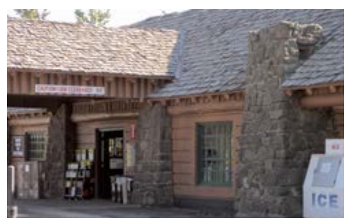
The Old Faithful Upper Service Station, built in 1929, is an example of rustic architecture, intended to enhance rather than detract from the setting of the Old Faithful Geyser.

The legal requirement to protect and understand the importance of these resources affects how the park is managed today. So far, 843 structures including roads, bridges, utility structures, and grave