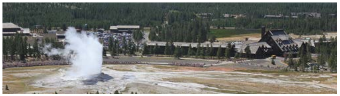
The Old Faithful Historic District, which includes the inn and many of the surrounding buildings, was listed on the National Register of Historic Places in 1982.