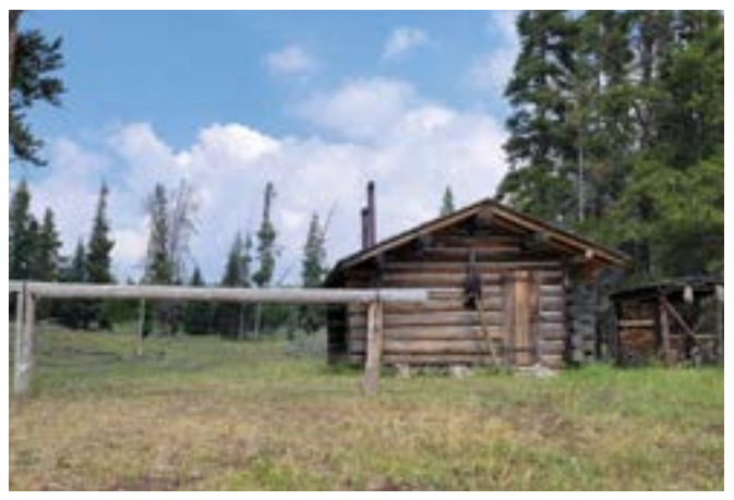
Pelican Springs backcountry cabin is an example of early rustic style of national park architecture.

Backcountry cabins are part of a large network of patrol or snowshoe cabins, based on a geographically strategic patrol operation established during the military administration of the park (1886–1918), and expanded by the National Park Service (1918–present). The original purpose of these cabins was to prevent poaching and vandalism.