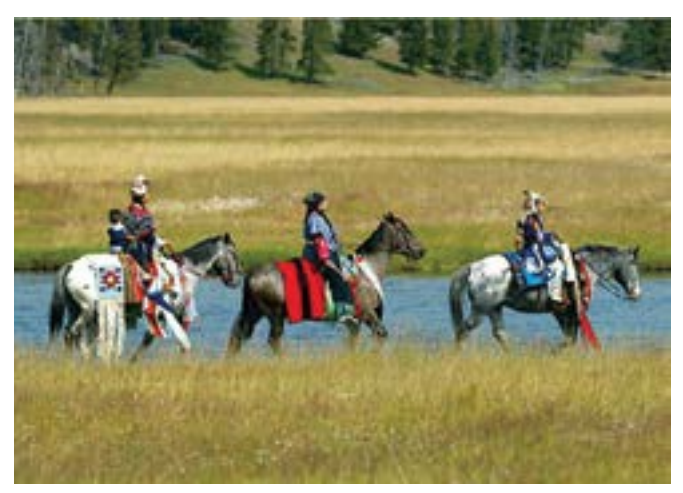
Nez Perce tribal members in traditional regalia ride along the Firehole River during a memorial ceremony in 2004.

The first tribes to request association came forward in 1996. Now 27 American Indian tribes are formally associated with Yellowstone. Since 2002, park managers have met periodically with tribal