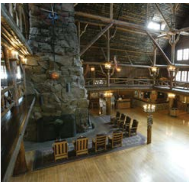
Historic preservation has maintained the appearance and condition of the famous Old Faithful Inn lobby, shown here in the first half of the 1900s (top) and in 2003 (bottom).