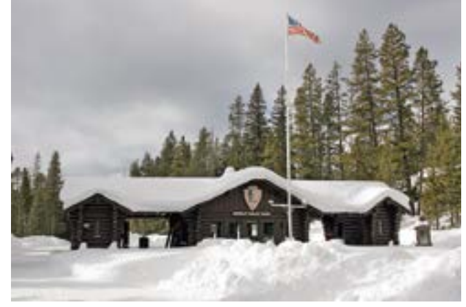
Northeast Entrance station is considered "the best of its type remaining in the National Park Service."

The entrance station was constructed with two traffic lanes passing through it. When it became necessary to accommodate the increasing number of recreation vehicles too tall to fit in the passage, a lane was added to each side of the building rather than alter it.