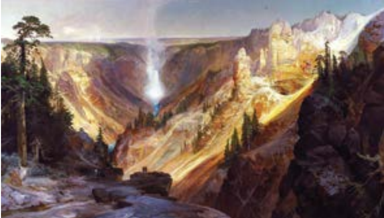
Grand Canyon of the Yellowstone River. Oil on Canvas 1872 by Thomas Moran.