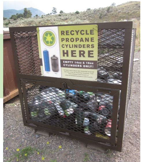
Propane Canister Recycling

The season for collecting compost was extended to capture more of the hotel and store operations for the summer.