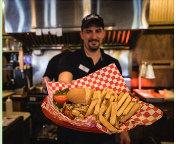
Yellowstone General Stores