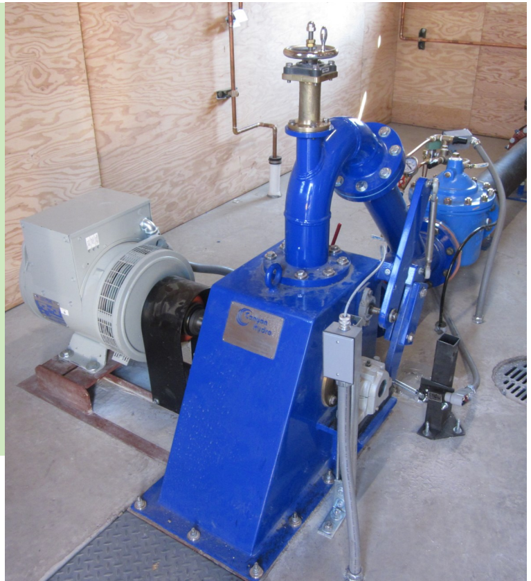
Hydro turbine, Lamar Buffalo ranch

Yellowstone National Park is the largest consumer of energy in the National Park Service.