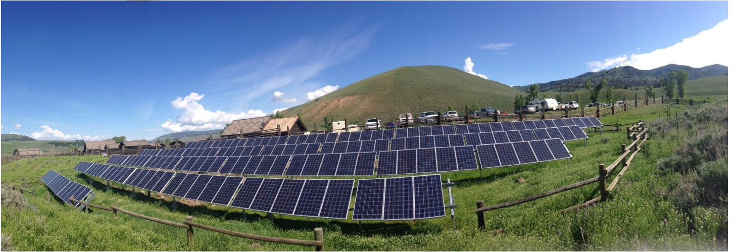
Solar panels Lamar Buffalo Ranch

The National Park Service (NPS) mission articulates a clear ethic for environmental stewardship. Yellowstone's sustainability program extends this commitment to conservation and protection to the environmental impact of our own operations.