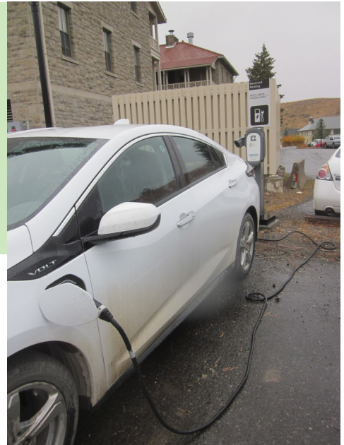
NPS Chevy Volt at Charging Station

258,559 gallons = 50.5% increase in diesel