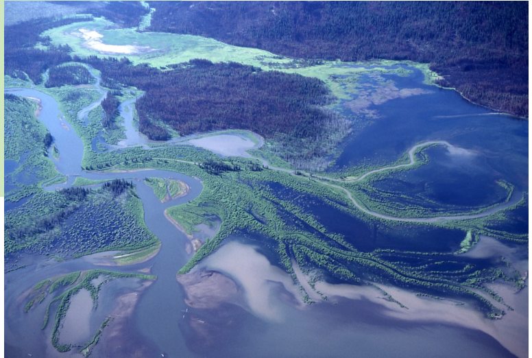
Yellowstone Lake Drainage

Climate change is already causing drier and warmer conditions in the Rocky Mountain West and it is important that Yellowstone minimizes human water use and ensures that facilities and operations have minimal impact on natural water resources.