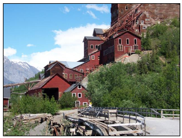
The Kennecott mill town is one of the park's most iconic features.

The park maintains collections, which include cultural objects, photographs, oral histories, historic resource maps, archives and natural collections of flora and fauna specimens.