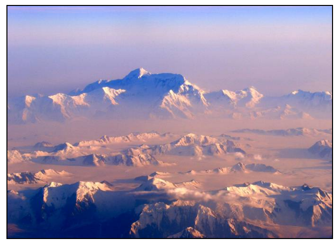
Mount St. Elias rises above the surrounding mountain range.

Wrangell-St. Elias National Park and Preserve provides opportunities to learn about the earth's history and geologic processes, and to perform scientific research.