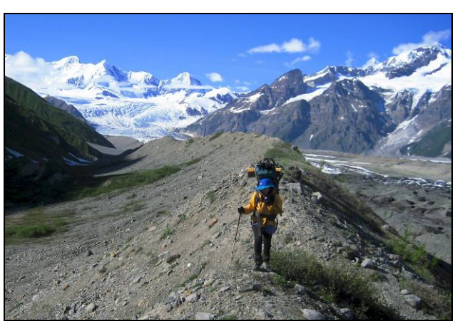
Backpackers following a lateral morraine west of Kennicott Glacier.

Trails, airstrips, and landings provide access to remote wilderness.