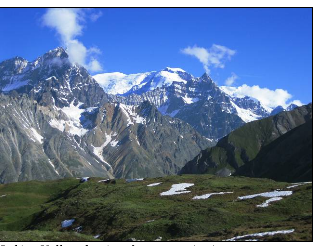
Lakina Valley, the site of many scenic vistas.

Natural, undeveloped viewsheds, including water bodies and landforms dominate the viewscape of Wrangell-St. Elias National Park and Preserve.