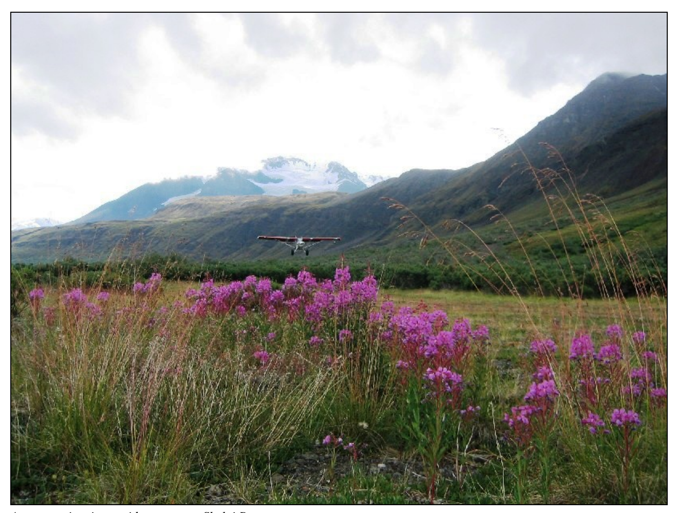
A remote airstrip provides access at Skolai Pass.

Appendix B includes legislation that, while superseded by ANILCA, offers contextual background information regarding the establishment of Wrangell-St. Elias National Park and Preserve.