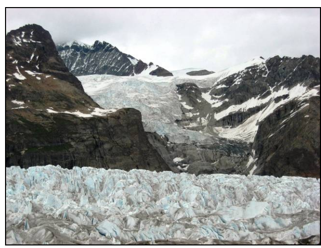
Glaciers in upper Kennecott Glacier Valley.

The park and preserve ensures the opportunity to explore, learn from, and add to the body of scientific research in regards to glacial systems.