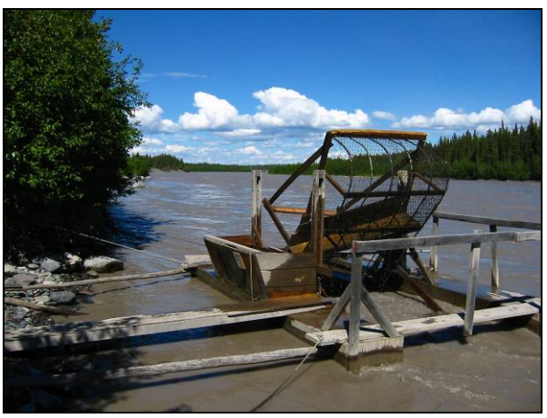
Salmon are a crucial part of local lifeways.

Access for subsistence users, commercial fishermen, private property owners, and those engaged in traditional activities.