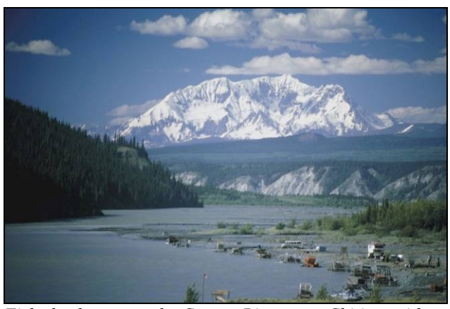
Fishwheels turn on the Copper River near Chitina, with Mt. Drum in the background.

Educational Opportunities Wrangell-St. Elias National Park and Preserve provides the opportunities to learn about the glacial river systems, and to perform scientific research regarding them.