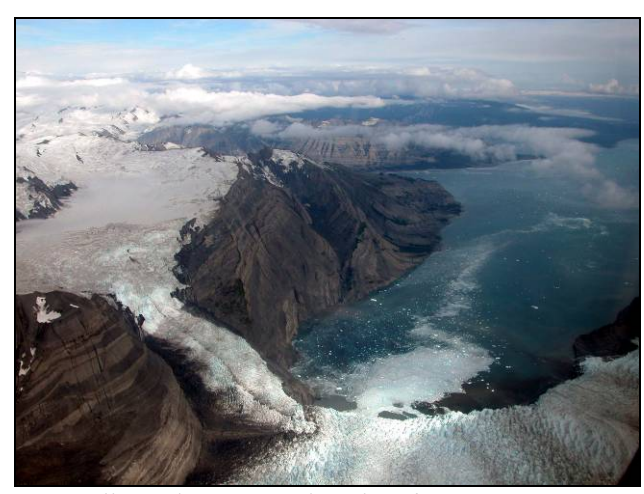
Wrangell-St. Elias National Park and Preserve contains a variety of ecosystems.

Moose, Dall's sheep, caribou, mountain goat, wolf, grizzly bear, black bear, lynx, wolverine are some of the species that live within the park and preserve.