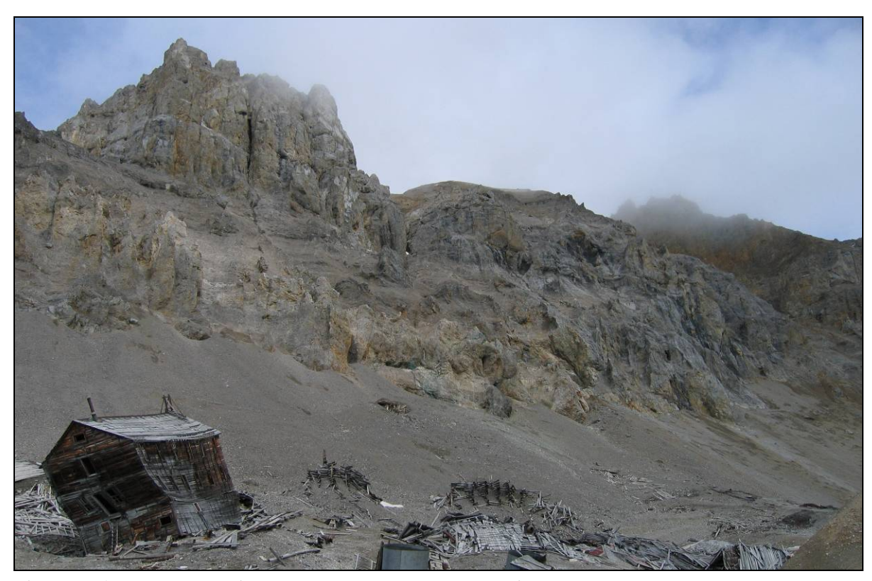
The ruins of Kennecott's Jumbo Mine camp rest near Bonanza Ridge.