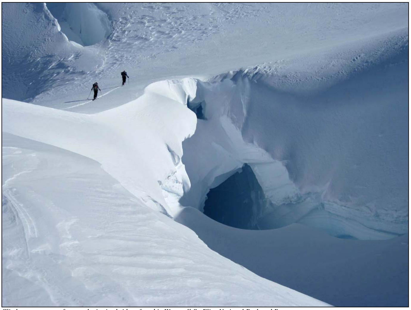
Climbers cross one of many glacier ice bridges found in Wrangell-St. Elias National Park and Preserve.

Appendix A — Legislation Appendix A includes selected excerpts from ANILCA that are most relevant for the day to day management of Wrangell-St. Elias National Park and Preserve.