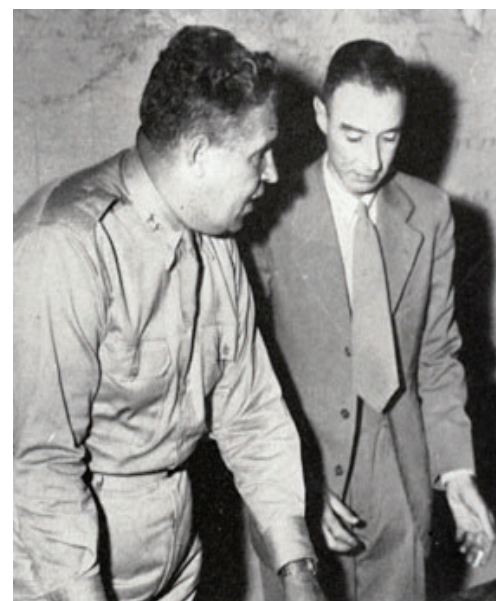
J. Robert Oppenheimer (right) and Leslie Groves (left)

Oppenheimer reorganized the Los Alamos Laboratory in the summer of 1944 to focus on imploding a ball of plutonium to create a nuclear explosion. This solution was new and untried, and would need to be tested.