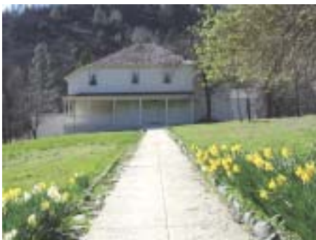
Camden House in spring