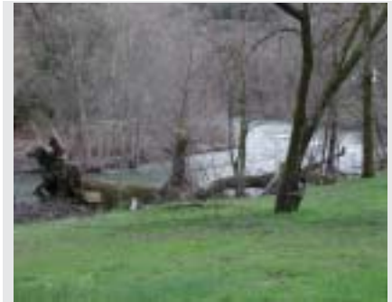
Clear Creek near picnic area