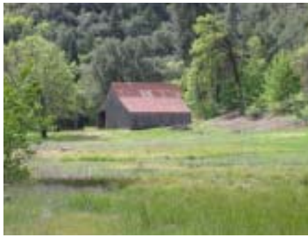
Barn across from the Tenant Farmhouse