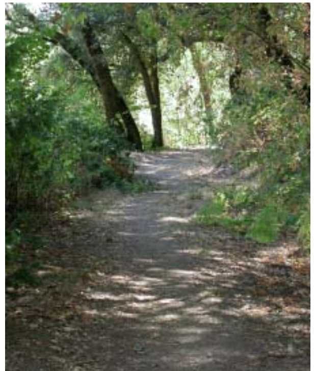
On this portion of the trail just past Levi Tower's grave, look for some of the old fruit trees.

Continue along the path under a canopy of oak and pines. An old barn will come into view and then the Tenant Farmhouse. This house was built in 1913 to accommodate a caretaker who became necessary as the Camden family was