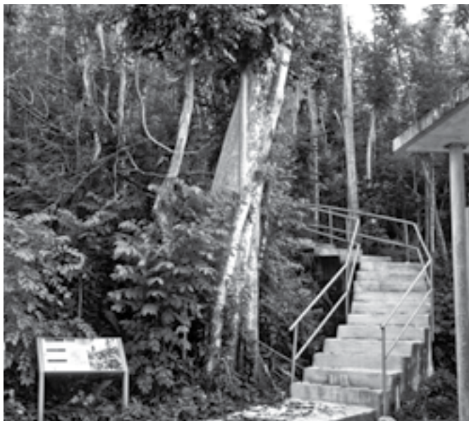
Your hike begins behind the church social hall. Please use caution as the trail and stairs may be slippery.

Follow the road for approximately half a mile, and park on the far side of the church social hall. The trailhead is just behind the wayside exhibit panel at the base of the hill. The trail ascends steeply through thick coastal jungle, reminiscent of the challenging terrain negotiated by both Japanese and U.S. troops.