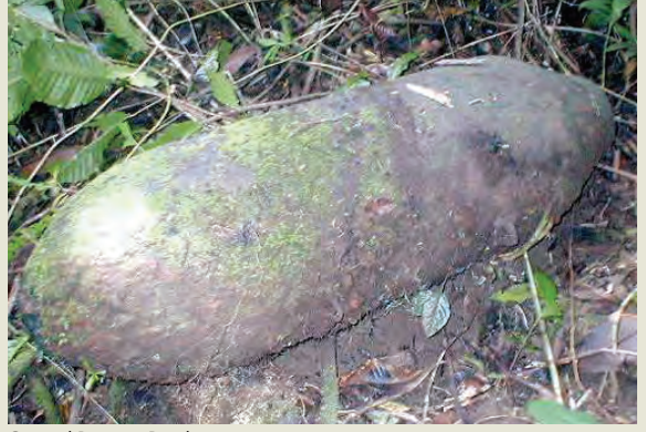
General Purpose Bomb