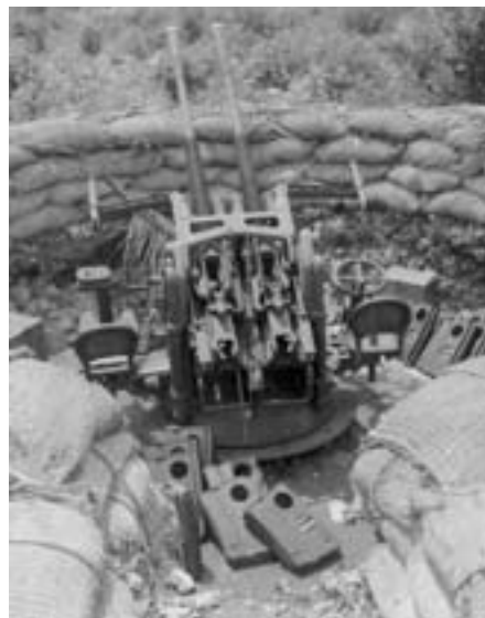
Visitors to Ga'an Point can view a Japanese 25-mm gun and a 200-mm gun used in battle, similar to those in these historic photographs.

both well-conceived and well-concealed, as the engineers were masters at using the natural environment to their advantage. Also wielded to the Japanese advantage were Chamorro laborers, who, forced under threat of punishment, constructed fortifications like these. Embedded on the concrete wall of the blockhouse is the inscription of the engineering company that oversaw the completion the structure.