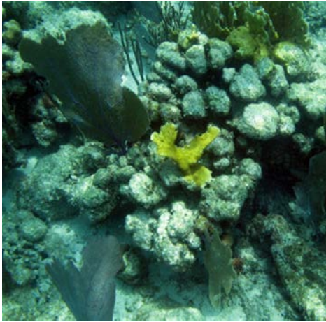
Figure 12.2 An A. palmata colony growing on top of a dead Orbicella annularis colony