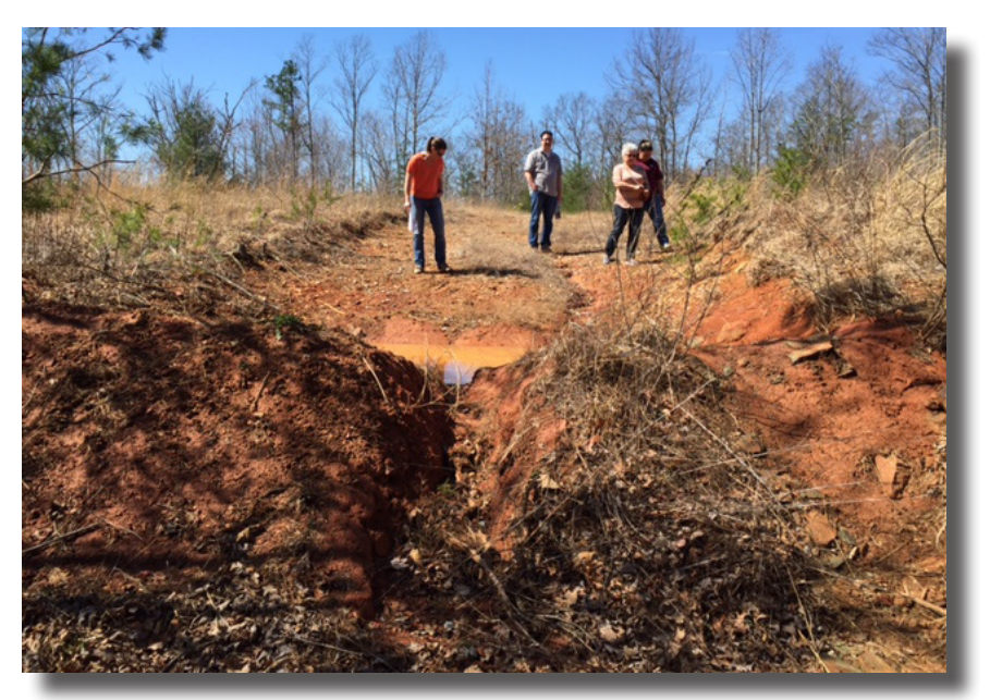
NTIR and other consulting parties examine damage to the Trail of Tears near Fort Armistead

Sometime between 2013 and 2015, personnel from Cherokee National Forest (USFS), Tennessee excavated 35 "erosion control" trenches across a 0.8-mile section of the trail along the Unicoi Turnpike (about one mile southeast of Fort Armistead), diverted a stream, and dug more trenches along other access roads near the turnpike.