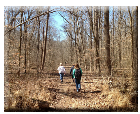
Walking the Hamburg Hill Trail during the Jonesboro, Illinois design charrette