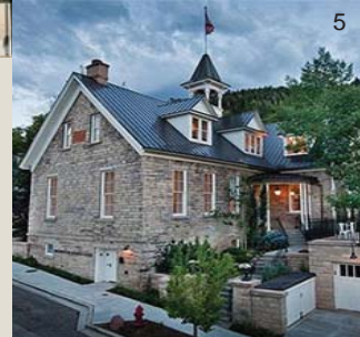
1. Erwin House, Bourbon, IN; 2. Rainwater Building, Florence, SC; 3. 21c Museum Hotel, Lexington, KY; 4. Sheridan Inn, Sheridan, WY; 5. Washington School House, Park City, UT.