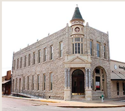
First National Bank, Stephenville, TX.

The First National Bank of Stephenville is a two-story Romanesque-style bank building in Stephenville, TX. One of the oldest remaining structures in the downtown, it was constructed in 1889 and housed the town's first bank. The bank moved out in 1925, and the building became home to a variety of tenants under multiple ownerships. In 2014, work began to rehabilitate this distinctive landmark into a mixed-commercial use building using the Federal historic tax credits. This enabled the restoration of many of the original features and finishes including the windows, interior plaster and frieze, wood trim, and floors. The building is once again a focal point for the surrounding community.