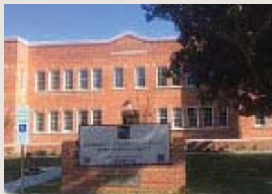
Harnett County Training School, Dunn, NC

The Harnett County Training School has been a landmark in Dunn, North Carolina, since its construction in 1922. The school was built to provide education for the African-American students in the area. After several expansions, the school became one of the largest Rosenwald schools in the state. Over time, desegregation made the buildings obsolete and the school sat vacant for many years. In 2014, a $7.8-million rehabilitation project was undertaken to bring the school building, as well as a gymnasium/auditorium, a classroom annex building, and a multi-purpose building, back to life to provide multiple uses. Besides providing 37 units of affordable housing for seniors, classrooms and multi-purpose rooms are leased to the Central Carolina Community College, and the gym serves as the Dunn Police Athletic League's youth recreation center.