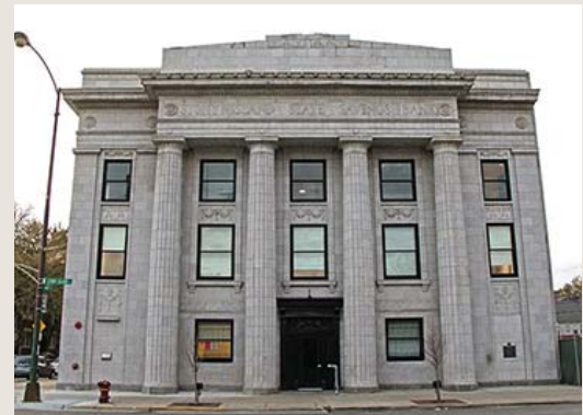
Stony Island Bank, Chicago, IL

The Stony Island Arts Bank building is one of the last remnants of what was once a dense commercial strip along Stony Island Avenue on the South Side of Chicago, IL. The gray terra-cotta structure, originally the Stony Island Savings and Trust, was built in 1923 with a dramatic vaulted banking lobby. It served a succession of financial institutions, but lost its tenants in the late 1970s, remained vacant for many years, and was almost demolished. Now, this landmark has been restored and reopened as the Stony Island Arts Bank, a hub for free arts and cultural programming for the Rebuild Foundation founded by Theaster Gates, a nonprofit organization that seeks specifically to foster culture and development in underinvested neighborhoods.