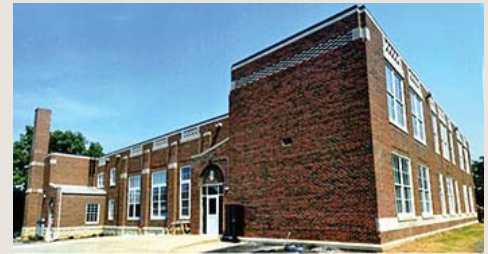
Ben Day School, Leavenworth, KS

Standing empty for seven years, the Ben Day School has become a new home for 24 families in historic central Leavenworth, KS. Originally built in 1909, the two-story Tudor revival-style building served elementary students, then primary students, and finally early childhood programs. Completed in FY 2016, this $2.3 million project repaired and preserved the wide corridor spaces with many of the original, wooden hall cupboards, trim, and plaster, and incorporated classroom chalkboards, cloakrooms, and built-in cabinets within the apartment units.