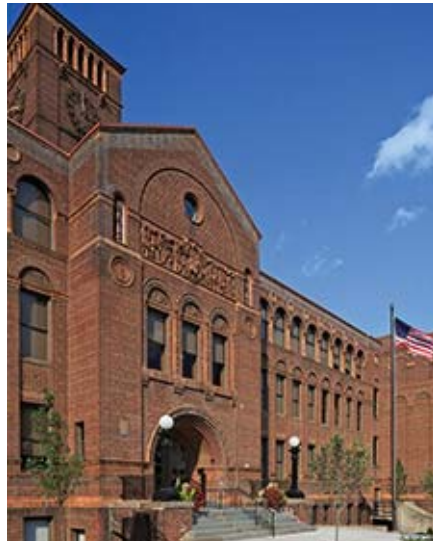
Corning Free Academy in Corning, NY

Statistical Report and Analysis for Fiscal Year 2016