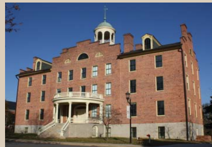
Schmucker Hall

Constructed in 1823 as a dormitory and classroom building, Schmucker Hall is located on the campus of the Lutheran Theological Seminary of Gettysburg, just outside Gettysburg National Historical Park. During the opening day of the Battle of Gettysburg, July 1, 1863, the Seminary was part of the Union Army line, and the building's cupola used as an observation post. Changing hands to Southern forces, the building served as a field hospital for more than 600 Union and Confederate soldiers. One of the most important Civil War sites not in public ownership, the building was rehabilitated as a museum through the cooperative efforts of the Seminary, the Adams County Historical Society, and the Seminary Ridge Historic Preservation Foundation. Over 200 construction jobs were supported during the nearly $9 million rehabilitation and additional museum and tourism jobs were created as a result of the museum opening.