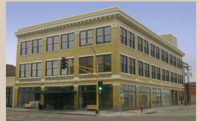
Pence Automobile Company Warehouse, Fargo, ND

Family HealthCare in Fargo, North Dakota, was formed 20 years ago to improve community access to healthcare. As their services grew over time at scattered locations, consolidation to a more central location became a priority in order to best serve those most in need. In 2011 Family HealthCare acquired the historic Pence Automobile Company Warehouse , listed in the National Register, and three smaller adjacent buildings and undertook a $7 million rehabilitation project in under 18 months, saying, "It fit perfectly with our mission because it allowed us to treat this forgotten building with dignity and respect, creating a tribute to the health and wellness of our community." The high ceilings, large window openings, terrazzo floor, and the original pink marble staircase were all historic features that the new owners capitalized on while creating their new medical center.