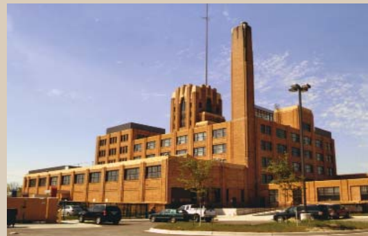
Michigan Bell & Western Electric Warehouse, Detroit, MI

Built in 1929 as offices and distribution center for telephone and communication supplies, the Michigan Bell & Western Electric Warehouse provided essential communication services to Detroit and surrounding areas. The Neighborhood Services Organization (NSO), a community-based human service organization, acquired the building and began a $48 million rehabilitation in 2011 to create permanent supportive housing for the formerly homeless. With the grand opening of the NSO Bell Building in the fall of 2013, NSO now provides 155 one-bedroom units with onsite supportive services for the formerly homeless. Serving a critical need in the community within a newly rehabilitated historic building, NSO has created an award-winning project, certified by the National Park Service for the Federal historic tax credit.