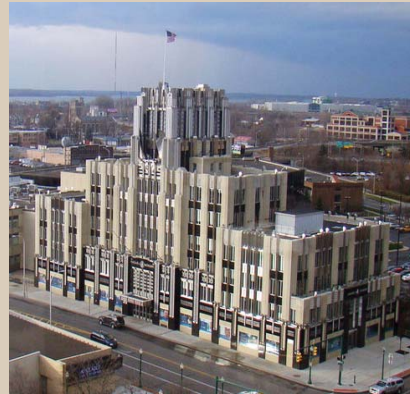
Niagara Hudson Building

Completed in 1932, the highly sculpted and richly detailed building is an outstanding example of American Art Deco architecture. Constructed in a ziggurat form, its modern design by Syracuse architect Melvin L. King masterfully integrated black Vitrolite glass, cast stone, aluminum, terra cotta, aluminum coated concrete, and stainless steel expressed in stylized geometric patterns. A utility company headquarters, it had sophisticated neon/helium exterior lighting, making it a standout both day and night. Acquired by the National Grid Group, the building had suffered from years of deferred maintenance, inappropriate alterations, and poor workmanship. Correcting the major deficiencies on the exterior with an emphasis on preservation of materials and design required the commitment of the owners, expertise of the design team, and quality workmanship of the contractors.