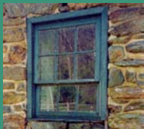
Photo 15, Pre-Rehab 206 Old Farm Road City, State

Label and number each photo and reference it in the application. If plans are provided, key the picture to a floor plan with an arrow indicating the direction in which it was taken.