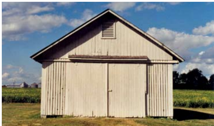
The sliding door is an important feature of this simple farm building.

If your property is located in a National Register district, it still must be designated by the National Park Service as a property that contributes to the historic character of the district, thus qualifying it as a “certified historic structure.” Not every barn in a district is contributing. For example, when historic districts are designated, they are usually associated with a particular time period, such as “1880 to 1935.” In this case, a 1950 barn would not contribute and would not be eligible for a 20% rehabilitation tax credit. On the other hand, a barn dating to 1932 could be eligible for the tax credit.