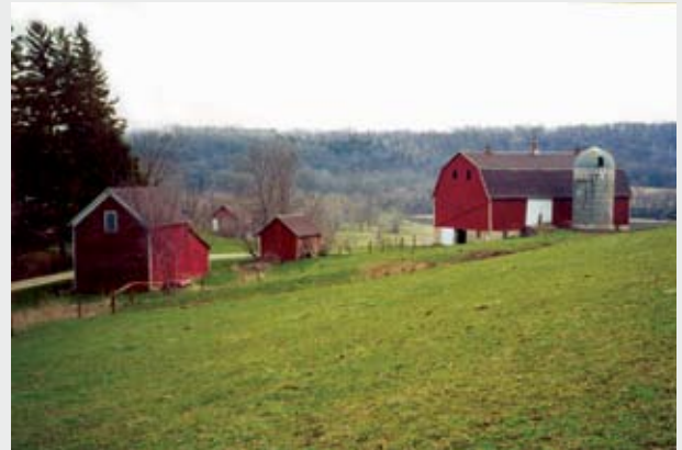
This sample application was developed for the barn on the right pictured above. The image below, left, shows a deteriorated section of the limestone foundation.

Part 1 of the application is a request to obtain a determination by the National Park Service that your barn is a certified historic structure. You will need to describe the physical appearance of the exterior and interior of the barn, and provide a brief narrative on its history and significance to the historic district in which it is located. Some of this information is likely contained in the National Register Nomination of the district, which should be available from your local historic district commission, municipal planning office, or SHPO. If there are other buildings on your historic property, describe their appearance and significance to the district as well. Even if you are not planning on doing work on all the buildings, they must be briefly described in the Part 1. If your barn is listed individually in the National Register and is the only structure on your property, then you may omit Part 1.