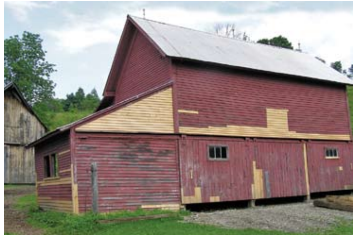
The siding on this barn was repaired with matching siding, a treatment that meets the Secretary of the Interior's Standards for Rehabilitation.

Inappropriate treatment: The addition of a large number of regularly spaced windows (shown above) to this primarily blank barn facade (left) does not meet the Secretary of the Interior's Standards for Rehabilitation.