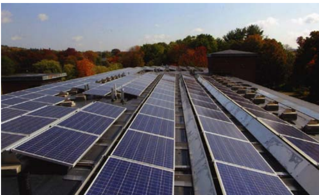
Solar panels installed on the flat roof.