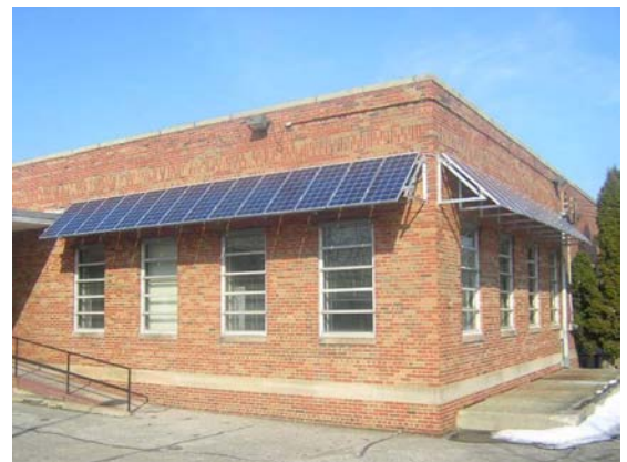
Above: Shown from the rear of the property, these solar panels serve a secondary function as awnings to shade south-facing windows. Because of their location at the back of the building immediately adjacent to a loading dock, the installation of these panels does not affect the historic character of the property.

Application 3 ( Compatible treatment ): The rehabilitation of this historic post office incorporated solar panels as dual-function features: generation of electricity and shading for south-facing windows. In this instance, the southern elevation of the building is also a secondary elevation with limited visibility from the public right of way. Additionally, because this area of the building is immediately next to the post office’s loading dock, it has a more utilitarian character than the primary facades and, therefore, can better accommodate solar panels. Because the panels are in a suitable location at the rear of the property and are appropriately sized to serve as awnings, they do not affect the overall historic character of the property. Additionally, a screen of tall plantings shields the solar panels from view from the front of the building, further limiting their visibility.