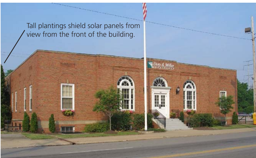
Left: The solar panels are not visible from the front of the building. Additionally, even if the vegetation were removed, the installation would only be minimally visible along an alley at the rear of a secondary side elevation.

Jenny Parker, Technical Preservation Services, National Park Service