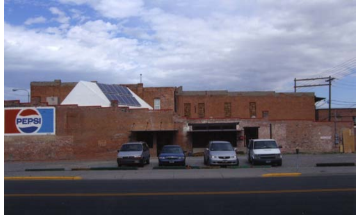
The addition of a large rooftop monitor featuring skylights on the front slope and solar panels on the rear slope is not compatible with the historic character of this small, one-story commercial building.

Application 3 ( Compatible treatment ): The rehabilitation of this historic post office incorporated solar panels as dual-function features: generation of electricity and shading for south-facing windows. In this instance, the southern elevation of the building is also a secondary elevation with limited visibility from the public right of way. Additionally, because this area of the building is immediately next to the post office’s loading dock, it has a more utilitarian character than the primary facades and, therefore, can better accommodate solar panels. Because the panels are in a suitable location at the rear of the property and are appropriately sized to serve as awnings, they do not affect the overall historic character of the property. Additionally, a screen of tall plantings shields the solar panels from view from the front of the building, further limiting their visibility.