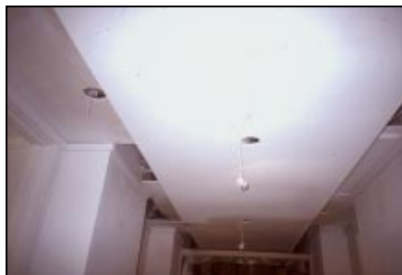
A partial ceiling can cover new systems in a corridor without obscuring existing historic features.

Application 3 ( Compatible treatment ): Another possible approach is illustrated in the conversion of this 1925 office building into a hotel. The design of this new floating ceiling allows covering new HVAC systems without obscuring or damaging existing features along the corridor walls. Holding the ceiling back away from the walls allows the existing trim and other details to be retained and kept visible.