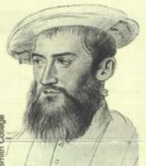
Jean Ribault (c. 1520-65), chosen by Admiral Coligny to explore Florida, brought reinforcements to Fort de la Caroline in 1565 and died in its defense.