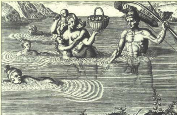
"Floridians crossing over to an island to take their pleasure."