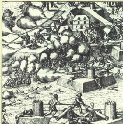
With Indian allies Dominique de Gourgues recaptured Fort de la Caroline—called San Mateo by the Spanish—in 1568.

On learning of Ribault's departure for Florida, Philip II of Spain sent Admiral Pedro Menéndez to dislodge the French. Initially rebuffed off the coast, Menéndez established a base to the south at San Agustín. Ribault sailed down the coast seeking to attack the Spanish, but his ships were scattered by a hurricane and beached far to the south. Seizing the opportunity, Menéndez marched north with 500 soldiers to attack the weakly guarded colony. Early in the morning of September 20, his troops massacred 140 settlers, sparing only about 60 women and children. Forty to 50 others, including Laudonnière, escaped and sailed for France. Menéndez next marched south and found the shipwrecked Frenchmen, Ribault among them. They threw themselves on his mercy, but to Menéndez they were heretics and enemies of his king. At a place later named Matanzas ("slaughter") he put to the sword about 350 men—all but those professing to be Catholics, and a few musicians.