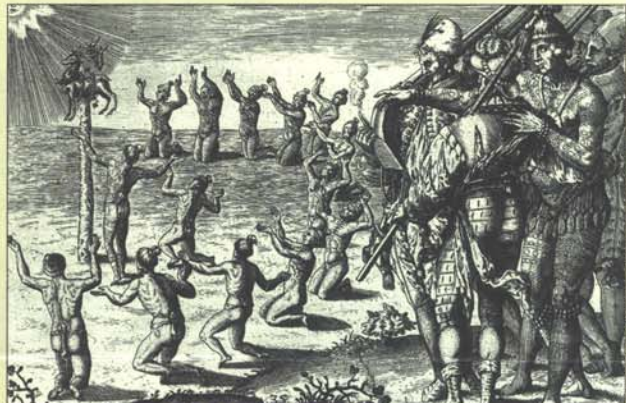
"Consecrating the skin of a stag to the sun."

Engraving by Theodore de Bry after sketches by Jacques le Moyne.