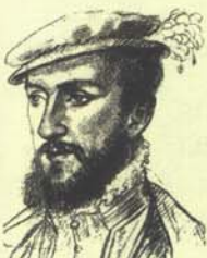
Gaspard de Coligny (1516-72) Admiral of France and prominent Huguenot, was supported by Catherine de Medici in his plan to colonize New France with Huguenots.