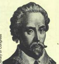
René de Laudonnière (c. 1529-74) commanded Fort de la Caroline. He survived the Spanish massacre of the French and later wrote his L'Histoire notable de la Floride .