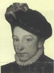
Charles IX (1550-74) became king of France at age 10. His mother Catherine de Medici and Admiral Coligny counseled him to license Ribault's voyage to North America.

southeastern coast of North America. Spain was uneasy about a French settlement because its treasure ships, while they followed the Florida coast, could be easy prey for suspected French raiders in their nearby haven at La Caroline.