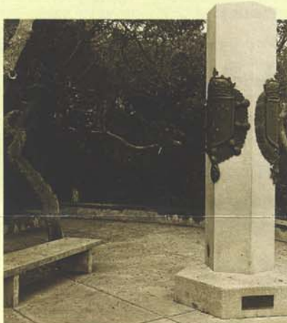
Replica of the stone column placed by Jean Ribault at the mouth of the River of May (St. Johns River), May 2, 1562.