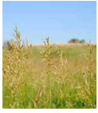
Smooth brome (Bromus inermis)

Continue straight along the ridge to the next post.