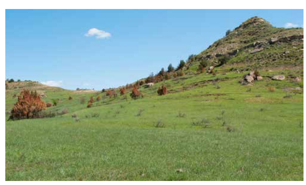
A hillside in the park one month after a prescribed burn

Fire is a useful tool for fighting the spread of invasive plants. Many invasive species are less tolerant of fire, giving native species an advantage in the growing season following a fire.