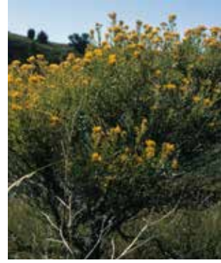
Rubber rabbitbrush (Chrysothamnus nauseosus)