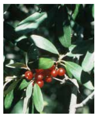
Silver buffaloberry (Shepherdia argentea)

Browsers and fires keep shrubs from overtaking the grasslands. Without them, tree and shrub cover increases, shading out smaller plants and reducing the prairie's diversity.