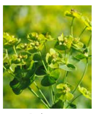
Leafy spurge (Euphorbia esula))