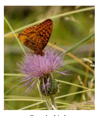
Canada thistle (Cirsium arvense)

cannot be eaten by native wildlife. Their spread reduces the amount of food available for grazers. Theodore Roosevelt National Park is actively fighting to keep invasive species from overtaking the native prairie.