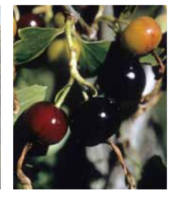
Golden currant (Ribes aureum)

Continue straight ahead to follow the trail posts in numerical order.