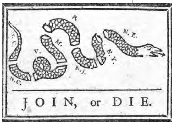
1754 Join or Die political cartoon