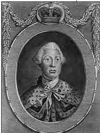
George III, King of Great Britain during the American Revolution

The French and Indian War set the stage for the American Revolution and influenced its outcome. This lesson plan explores four ways the French and Indian War was influential.