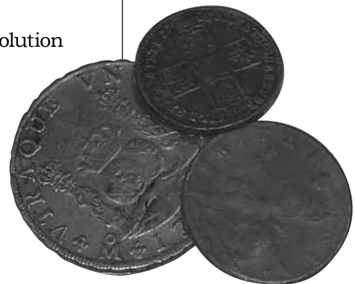
Spanish dollar and two British coins