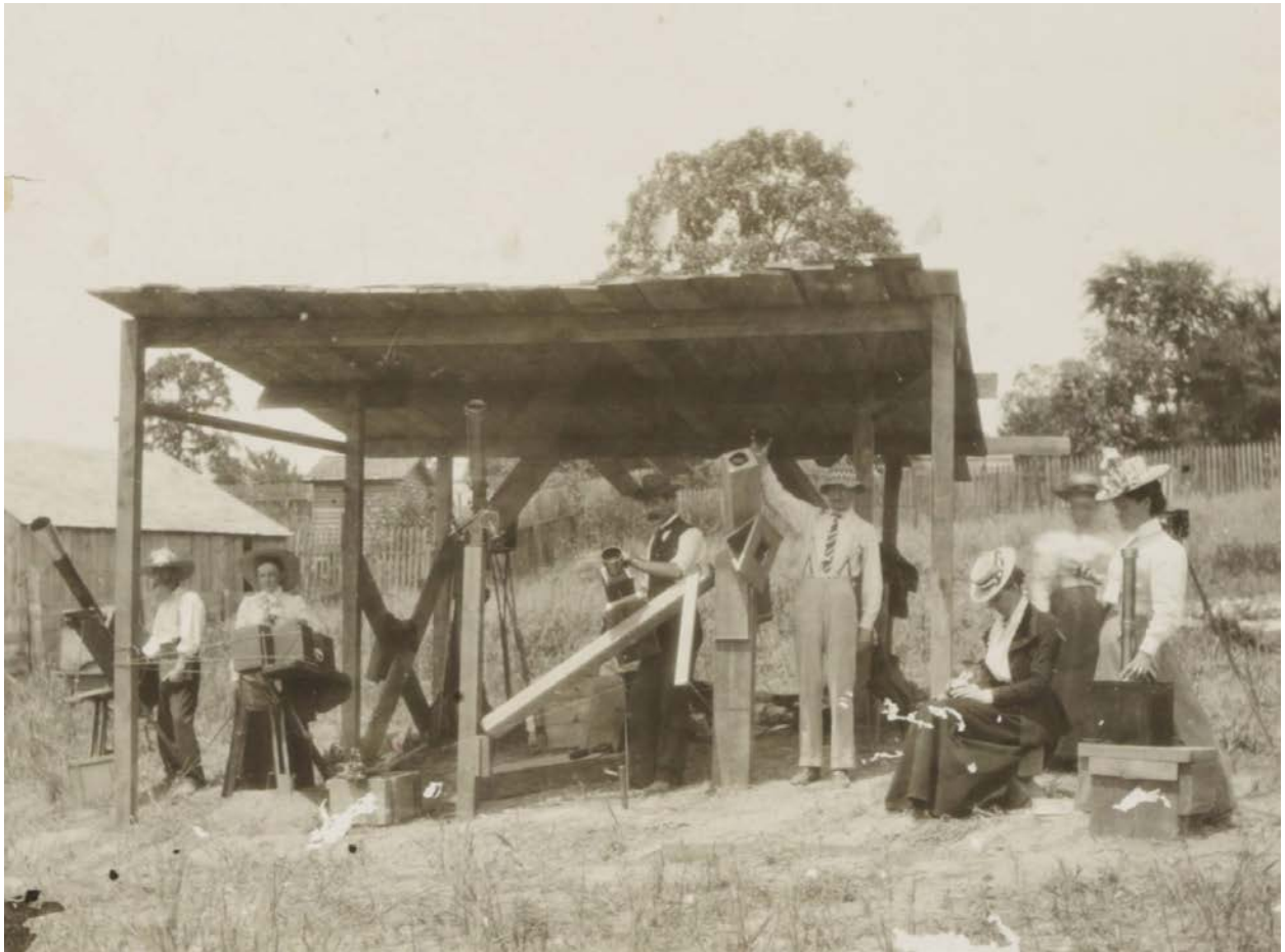
Photo 1: British Astronomical Association with their equipment in Wadesboro, NC