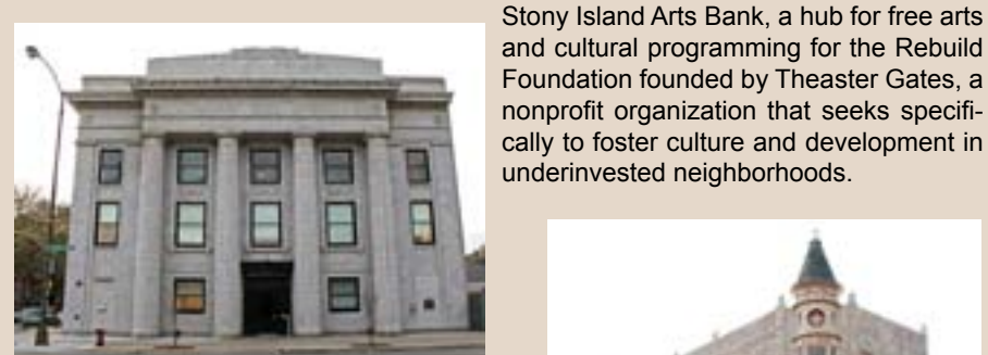
Stony Island Bank, Chicago, IL

The Stony Island Arts Bank building is one of the last remnants of what was once a dense commercial strip along Stony Island Avenue on the South Side of Chicago, IL. The gray terra-cotta structure, originally the Stony Island Savings and Trust, was built in 1923 with a dramatic vaulted banking lobby. It served a succession of financial institutions, but lost its tenants in the late 1970s, remained vacant for many years, and was almost demolished. Now, this landmark has been restored and reopened as the Stony Island Arts Bank, a hub for free arts