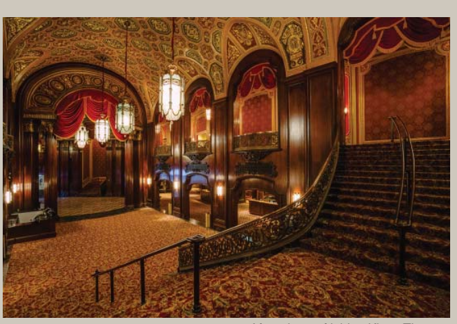
After photo of lobby: Kings Theater

This annual report includes information from the Federal Tax Incentives for Rehabilitating Historic Buildings, Statistical Report and Analysis for FY 2015, prepared by Technical Preservation Services, and can be found on our website: <a href="http://www.nps.gov/tps">http://www.nps.gov/tps</a>>.