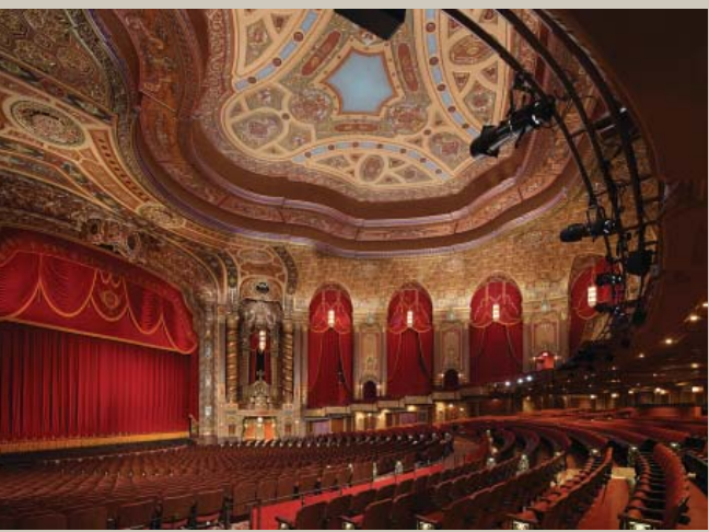
After photo of auditorium