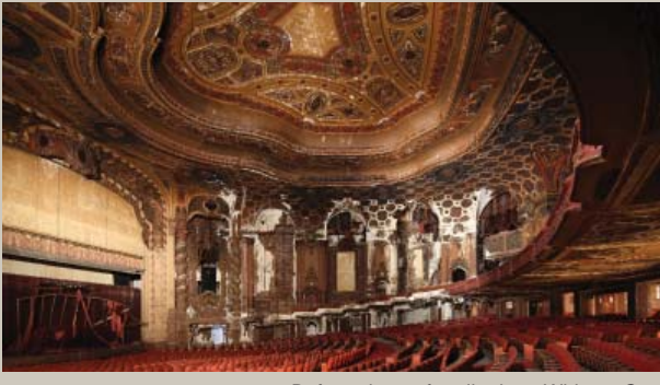
Before photo of auditorium