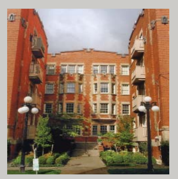
Trinity Place Apartments, Portland, OR