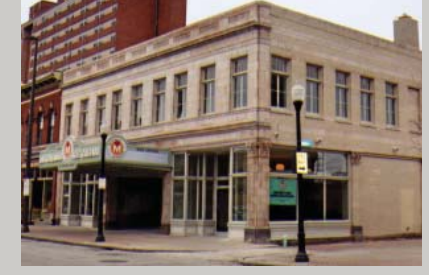
The Rialto Theater, Cleveland, OH

The former Central States Life Insurance Company Building recently became the headquarters of Chameleon Integrated Services (CSI), a St. Louis, MO-based information technology firm, following a $3 million rehabilitation. Individually listed in the National Register, this 1921