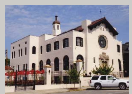
Central States Life Insurance Co. Building, St. Louis, MO

Mission Revival-style building was designed for a local corporate headquarters, complete with an impressive two-story atrium. Later used for many purposes, and most recently as a series of nightclubs, CSI purchased the building and returned it to its original use as corporate offices. The building's exterior and surviving historic features on the inside were restored, and state-of-the-art security systems installed. Twenty-seven percent of the work was completed by minority-owned businesses from Greater St. Louis. With their new offices and a building rich in architectural detail, CSI has not only saved an impressive historic resource, but also is contributing to the rebirth of the local community.