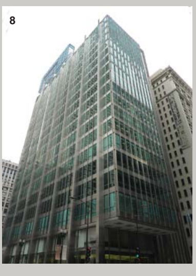
Chase Grain Elevator, Sun Prairie, WI; 2. Sengelmann Hall, Schulenburg, TX; 3. Cincinnati Color Building, Cincinnati, OH; 4. Carlin's Amoco Station, Roanoke, VA; 5. Breakwater Hotel, Miami Beach, FL; 6. Croke Patterson-Campbell Mansion, Denver, CO; 7. Old Masonic Temple and City Hall, Vallejo, CA; 8. Inland Steel Building, Chicago, IL.