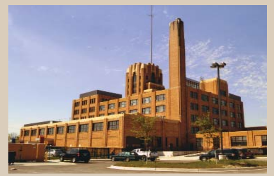
Michigan Bell & Western Electric Warehouse, Detroit, MI

Built in 1929 as offices and distribution center for telephone and communication supplies, the Michigan Bell & Western Electric Warehouse provided essential communication services to Detroit and surrounding areas. The Neighborhood Services Organization (NSO), a community-based human service organization, acquired the building and began a $48 million rehabilitation in 2011 to create permanent supportive housing for the formerly homeless. With the grand opening of the NSO Bell Building in the fall of 2013, NSO now provides 155 one-bedroom units with onsite supportive services for the formerly homeless. Serving a critical need in the community within a newly rehabilitated historic building, NSO has created an award-winning project, certified by the National Park Service for the Federal historic tax credit.