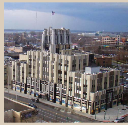
Niagara Hudson Building

Completed in 1932, the highly sculpted and richly detailed building is an outstanding example of American Art Deco architecture. Constructed in a ziggurat form, its modern design by Syracuse architect Melvin L. King masterfully integrated