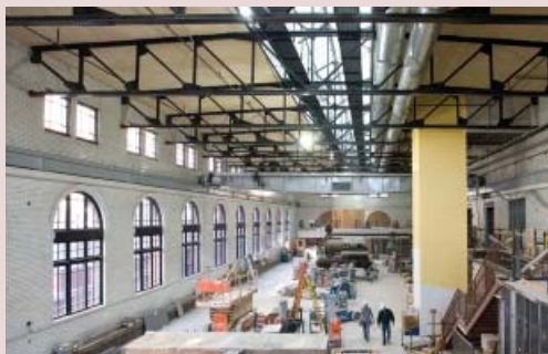
Interior fitouts in progress in the north hall.

Utilizing Federal tax credits, the $31 million rehabilitation includes the retention of the monumental north hall; repair and energy improvements to the original window frames and sash; addition of two new floor levels within the south hall; and installation of a new elevator and connecting stairs. As part of the classroom experience that focuses on the environment, elements of the original energy production technology are being preserved while at the same time, modern sustainable energy technology is being utilized, including geothermal heating and cooling. Exterior work will also provide new multilevel egress incorporated within the original railroad hopper structure attached to the building. This structure allowed coal to be mechanically unloaded and conveyed directly to the furnaces. Additional work includes the reconstruction of existing sidewalk vaults and main entry stairs. The 14 foot wide and 185 foot tall radial brick chimney is also being fully restored and incorporated into the future life of the education facility through the eventual introduction of a wind turbine within it.