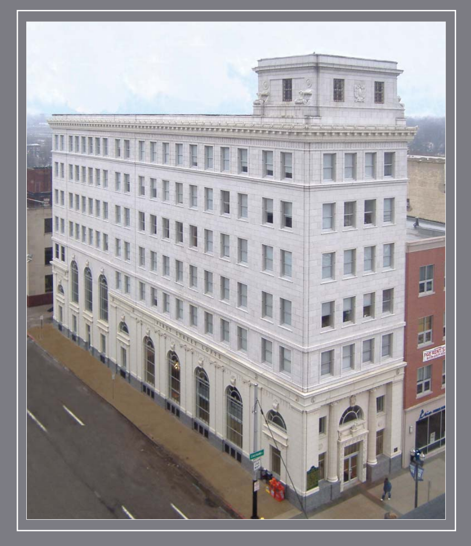
First National Bank, Flint, Michigan