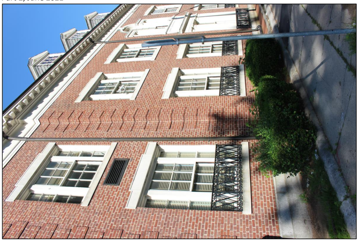
3. North Elevation of 1924 Bank Building, looking west.