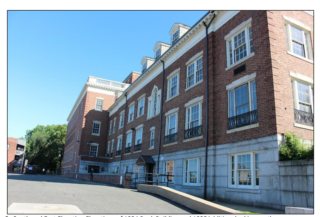
2. South and East Elevation Elevations of 1924 Bank Building and 1935Addition, looking north.