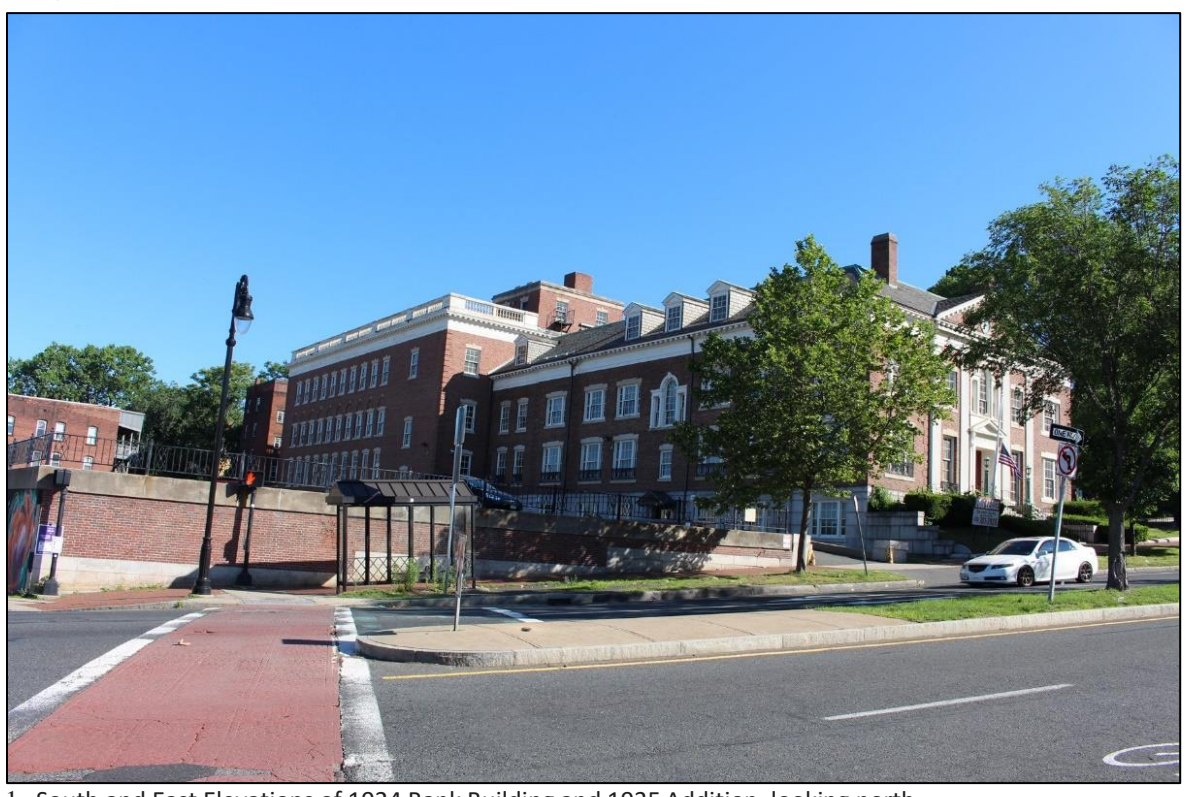
1. South and East Elevations of 1924 Bank Building and 1935 Addition, looking north.