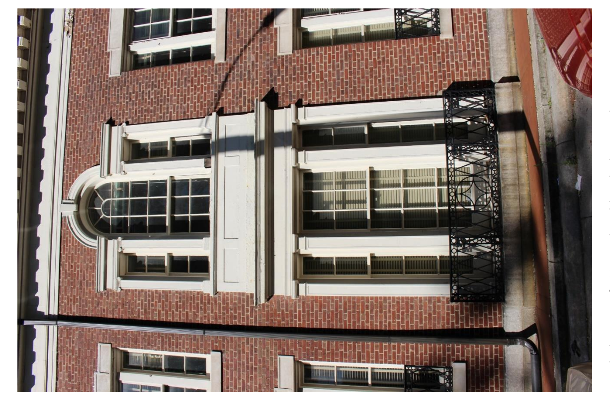
20. North Elevation of 1924 Bank Building, looking southwest.