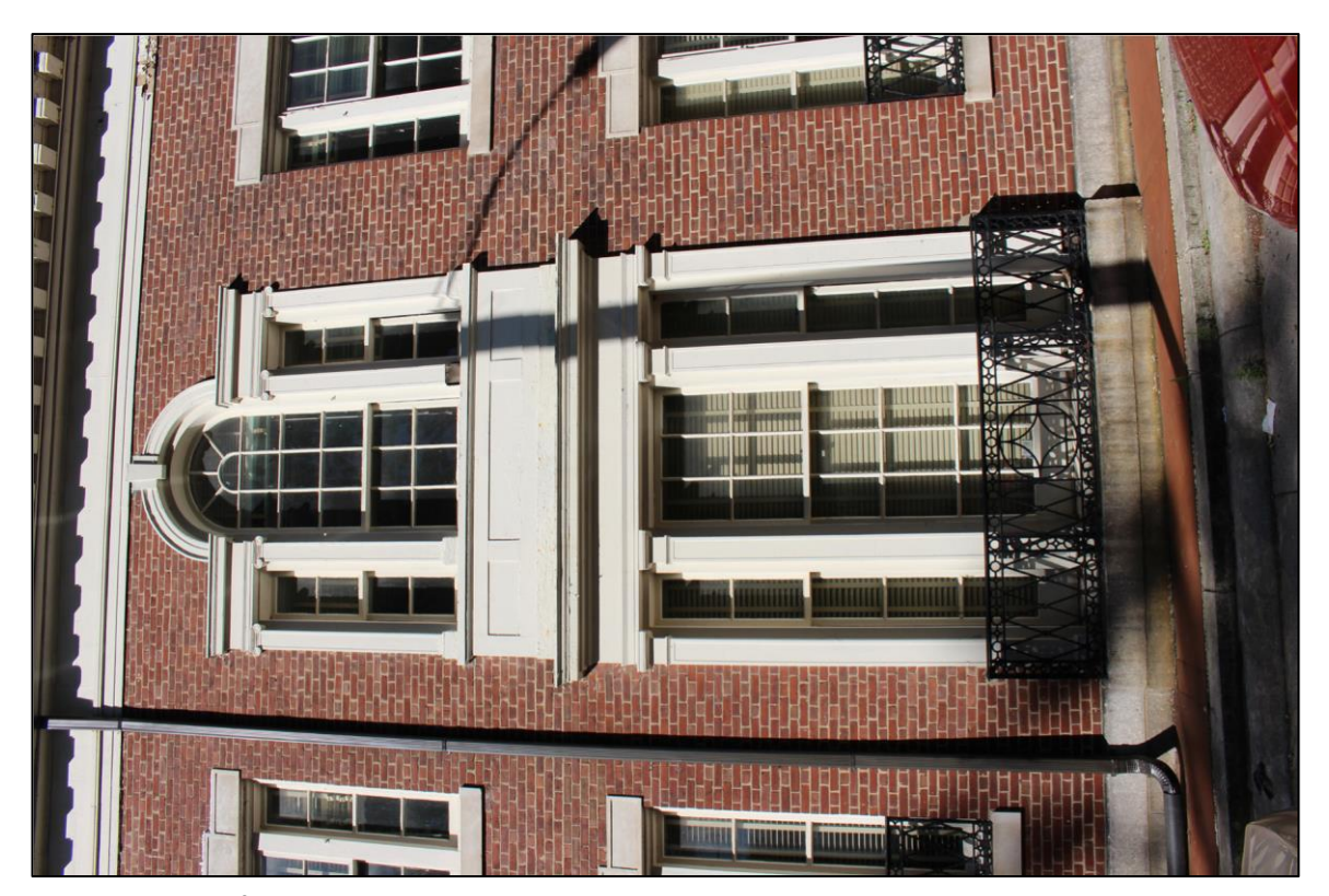
North Elevation of 1924 Bank Building, looking