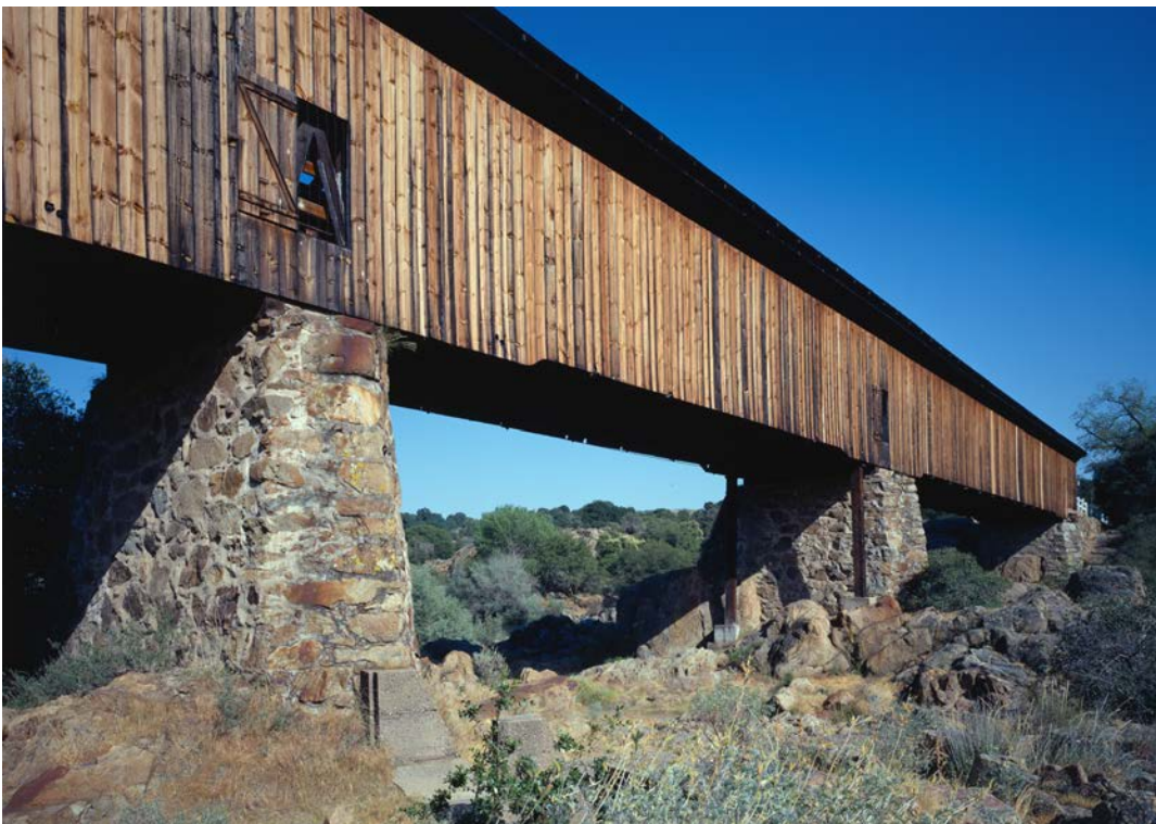
The Knight's Ferry Bridge, spanning the Stanislaus River in California, is the longest covered bridge west of the Mississippi River. HAER documented for the Federal Highway Administration.

The four programs adapt new technology, such as laser scanning, often using it in conjunction with traditional methods to create accurate, systematic, and comprehensive documentation of the important details of historic buildings, structures, and landscapes. Beginning with HABS in the 1950s, the programs have had a strong educational focus, training future historians, architects, landscape architects, engineers, photographers,