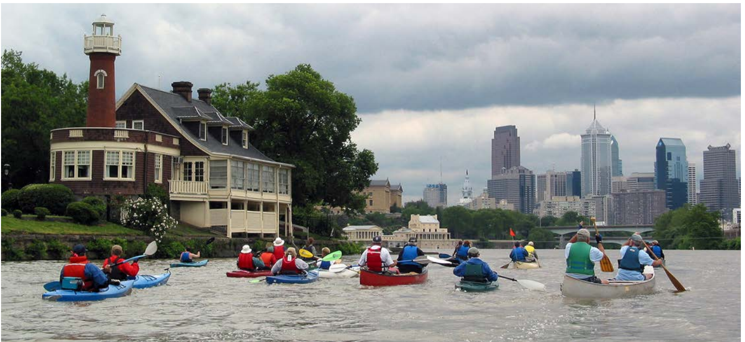
The Schuylkill River Valley NHA Sojourn connects people to the Pre-Revolutionary mills, George Washington's Valley Forge encampment, 19th century factories, rural villages, and the City of Philadelphia that form the rich heritage of Southeastern Pennsylvania.

The NPS does not manage the NHAs; instead, the NPS is a partner and advisor. NPS staff prepare NHA suitability/feasibility studies prior to congressional designation, and review management plans that are submitted by NHA planning entities for approval by the Secretary of the Interior. After Congress designates an NHA, the NPS provides training, and technical, planning assistance, and limited financial assistance through congressional appropriations for the program, which must be matched by the NHA.