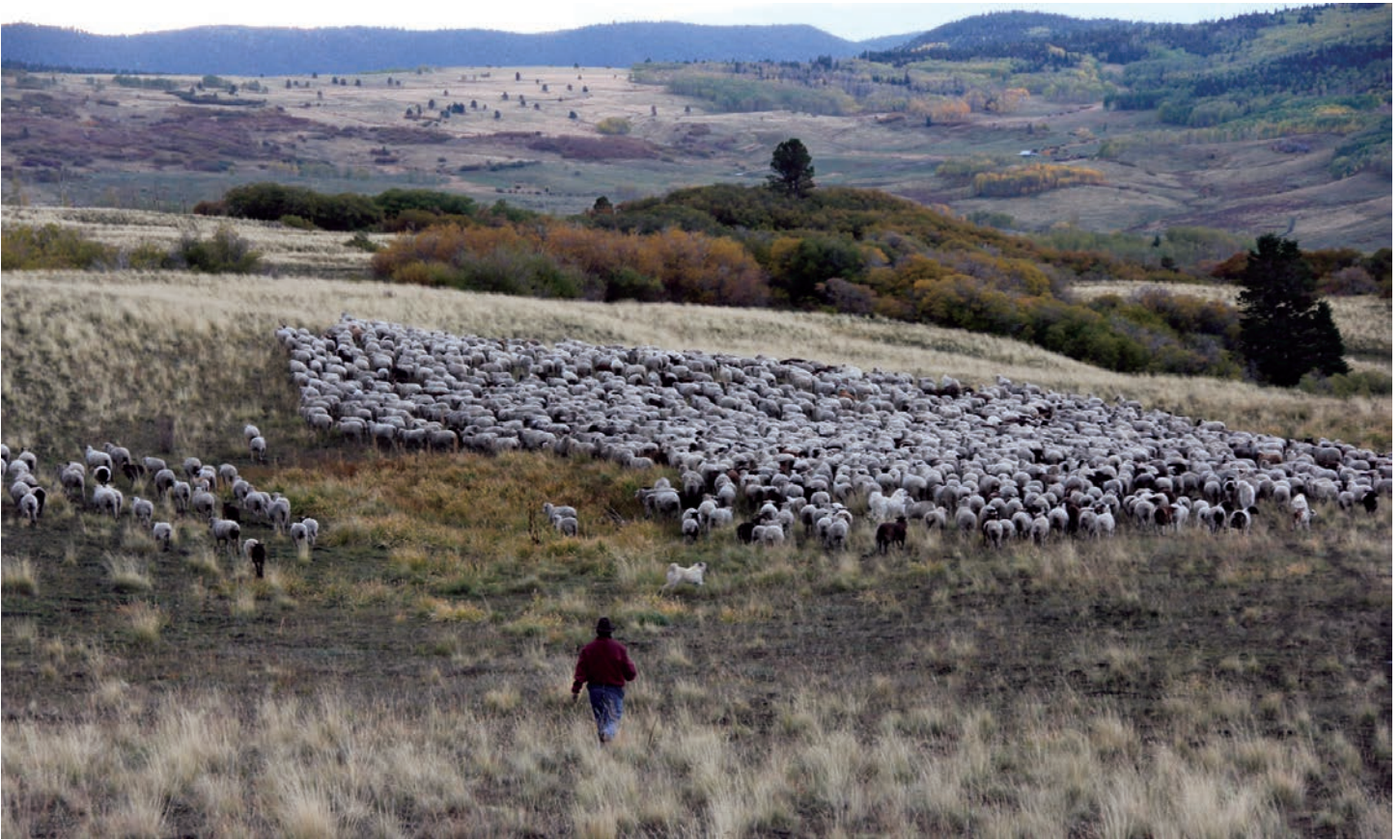
A mosaic of cultures and history, including eight Pueblos and the descendants of Spanish settlers who arrived in the region as early as 1598, thrive in the Northern Rio Grande National Heritage Area, which stretches from Taos to Santa Fe, New Mexico.