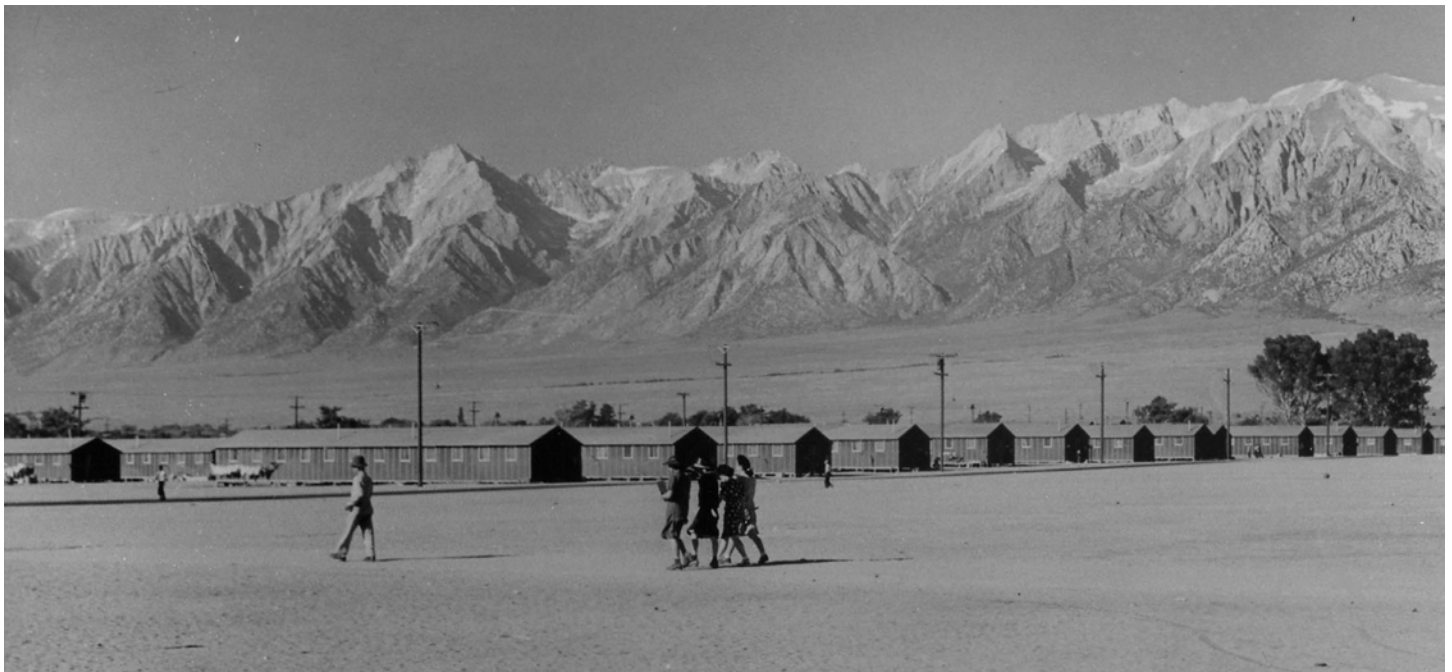
The Manzanar War Relocation Authority Center for internees of Japanese Ancestry.