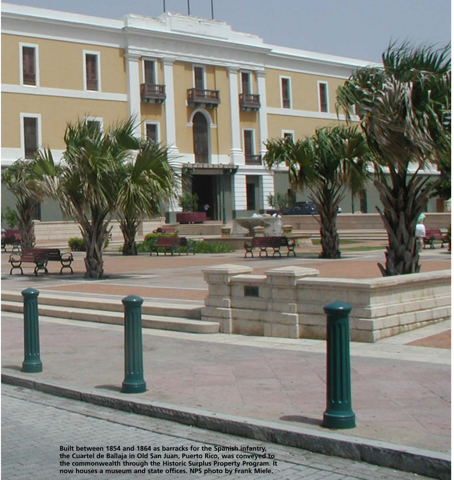
Built between 1854 and 1864 as barracks for the Spanish infantry, the Cuartel de Ballaja in Old San Juan, Puerto Rico, was conveyed to the commonwealth through the Historic Surplus Property Program. It now houses a museum and state offices.

The National Park Service provides grants, technical assistance, and training that support the preservation and enjoyment of our cultural heritage on public lands and private properties throughout the nation.