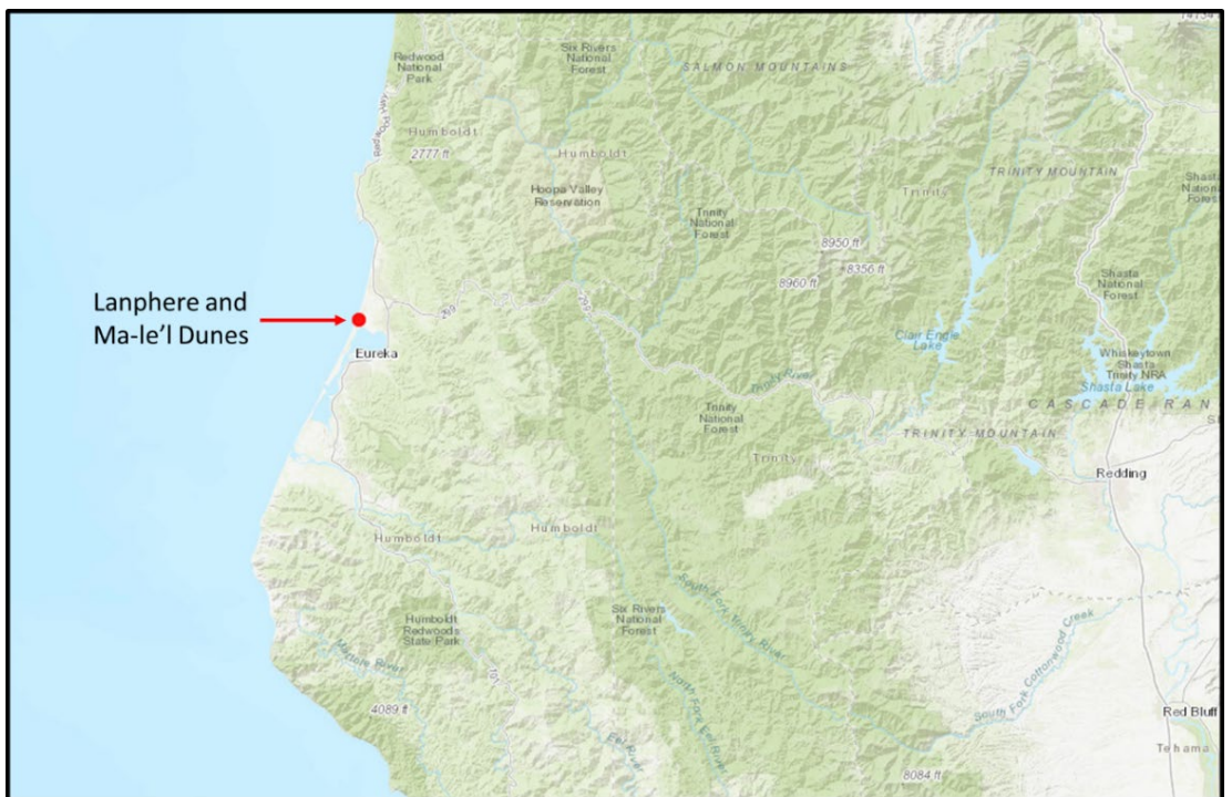
Figure 2. General location of the proposed Lanphere and Ma-le'l Dunes NNL in northwestern California.