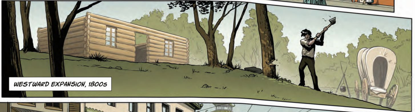
WESTWARD EXPANSION, 1800S