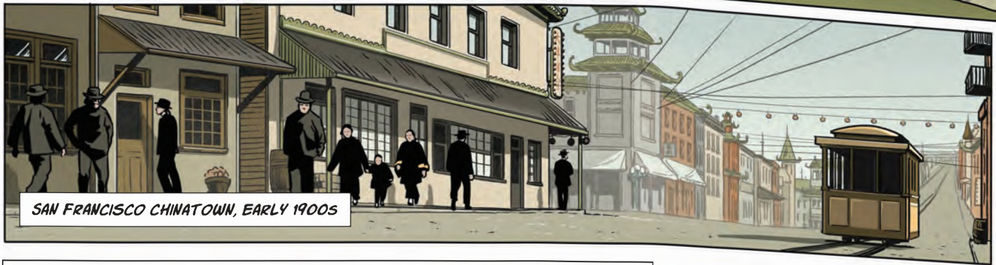
SAN FRANCISCO CHINATOWN, EARLY 1900S

FROM BROOKLYN TO BOURBON STREET, WOOD, UBIQUITOUS AND READILY AVAILABLE, WAS THE STANDARD FOR WINDOW FRAMES NO MATTER THE ARCHITECTURAL STYLE.