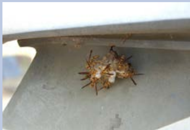
Figure D. Yellow jackets that are nesting below the projecting molding of this grave marker pose a hazard to visitors and staff because, if disturbed, they will vigorously defend their nest. Yellow jacket, paper wasp and hornet nests should be removed from grave markers by trained staff or specialists.

Snakes, wasps, and burrowing animals inhabit historic cemeteries (Fig. D). Snakes sun on warm stones and hide in holes and ledges, so it is important to be able to identify local venomous snakes. An appropriate venomous snake management plan should be in place, and