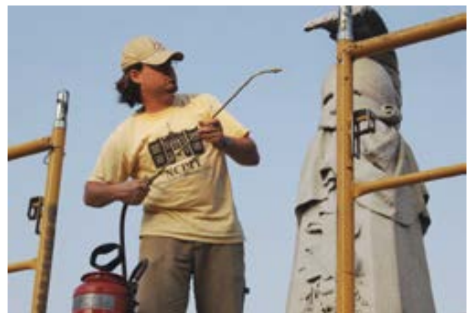
Figure 24. A severely deteriorating monument or grave marker can be treated with a stone consolidant. The treatment is usually applied using a spray system. The consolidant soaks into the stone and replaces mineral binders that hold the stone together. On-site and laboratory testing and evaluation are performed prior to using this non-reversible type of treatment.

When erosion is severe, consolidation treatments (e.g., ethyl silicate) have been used to replace mineral binders lost to weathering (Fig. 24). Because these treatments are not reversible, laboratory and on-site testing are essential. Application by a conservator or other experienced preservation professional is advised.