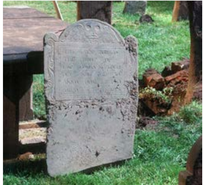
Figure 20a. This slate grave marker in the Ancient Burying Ground in Hartford, CT, is a ground-support stone. Resetting requires digging a hole that will hold the base of the stone and then compacting the soil at the bottom of the hole by hand.

Inexperienced staff or volunteers should not attempt resetting without training from a conservator, engineer, or other preservation professional. When dealing with fragile or significant grave markers, or those with large