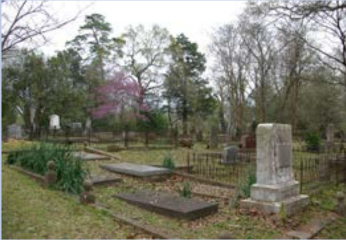
Figure A. Cemeteries are cultural landscapes made up of a variety of features. Grave markers are but one component of cemeteries that also include walkways, drives, fences, coping, trees, shrubs, and other vegetation. Each component adds to the understanding of the cemetery landscape.