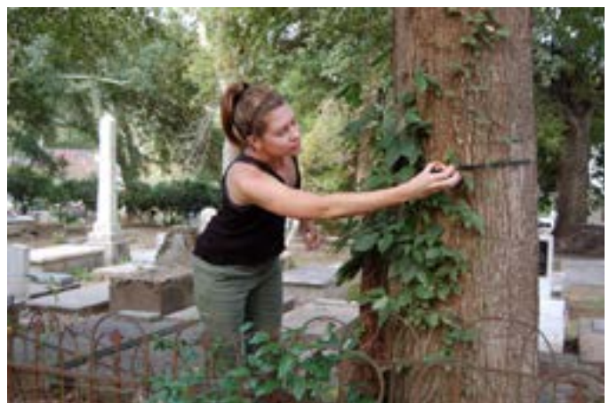
Figure 12. A cemetery professional undertakes a tree inventory in American Cemetery, Natchitoches, LA, to determine the health of trees in the cemetery. Management decisions for trimming or removal are based on the inventory.

Inappropriate maintenance activities can be devastating. One of the most common threats stems from improper lawn care, particularly the misuse of mowing equipment and string trimmers (weed whackers). The use of large mowers or mishandling them can lead to displacement of markers. Scrapes, gouges and even breakage also can occur. Improper use of string trimmers in areas immediately adjacent to grave markers can result in