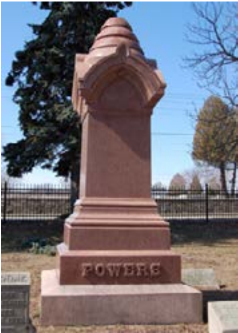
Figure 5. A variety of colors of natural stone are found in historic cemeteries, such as this pink granite marker in the Cedar Grove Cemetery, New London, CT.

physical structure of the stone influence weathering and the selection of materials and procedures for its cleaning and protection.