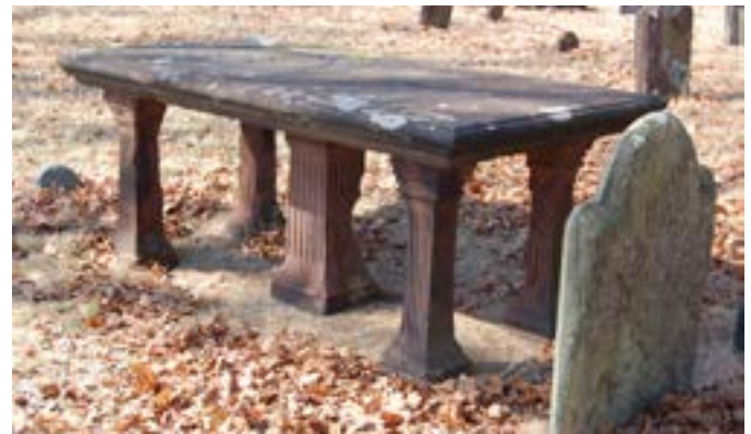
Figure 4. This sandstone table tomb, located in Cedar Grove Cemetery, New London, CT, is an engineered grave marker structure consisting of a horizontal stone tablet supported by four vertical table “legs” with and a central column,.

Grave markers can also be engineered structures. Examples of grave marker structures include masonry arches, box tombs, table tombs, grave shelters, and mausoleums (Fig. 4). The box tomb is a rectangular structure built over the gravesite. The human remains are not located in the box itself as some believe, but