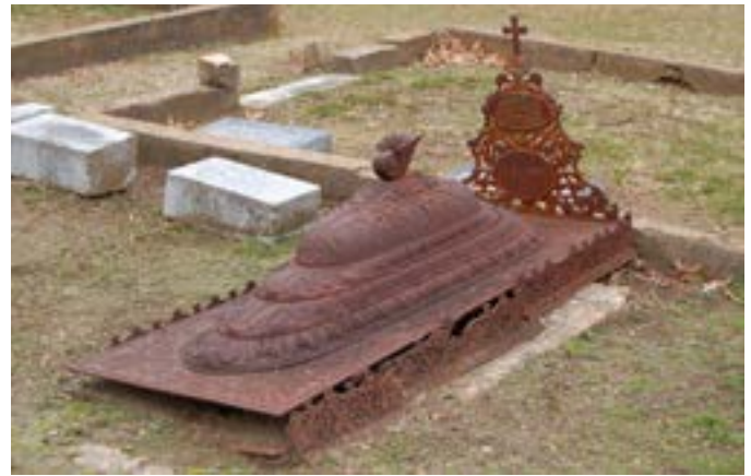
Figure 6. Decorative cast-iron grave markers like this late-19th century one in Oakland Cemetery in Shreveport, LA, are produced by heating the iron alloy and casting the liquid metal into a mold.

Metals are solid materials that are typically hard, malleable, fusible, ductile, and often shiny when new (Fig. 6). A metal alloy is a mixture or solid solution of two or more metals. Metals are easily worked and can be melted or fused, hammered into thin sheets, or