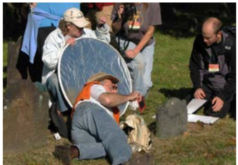
Figure 15b. Photographs are used to document the condition of the grave marker as part of a condition assessment.

A tool kit for the condition assessment may include binoculars, digital camera, magnifying glass, measuring tape, clipboard, carpenter's rule, level, magnet, and flashlight. For large monuments, a ladder or aerial lift may be required. Photographs of each marker, including overall shots and close-up details, are an essential part of the documentation process. Photo logs are helpful for