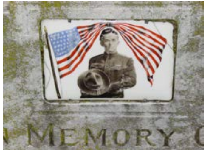
Figure 8. A fired ceramic, this cameo is set in a marble grave marker, located in Elmwood Cemetery, Memphis, TN. Different materials may require different conservation approaches.

Old cemeteries often include a wide variety of other materials not normally associated with contemporary grave markers, such as ceramics, stained glass, shells, and plastics (Fig. 8). As with masonry, metals, and wood, each has its own chemical and physical properties