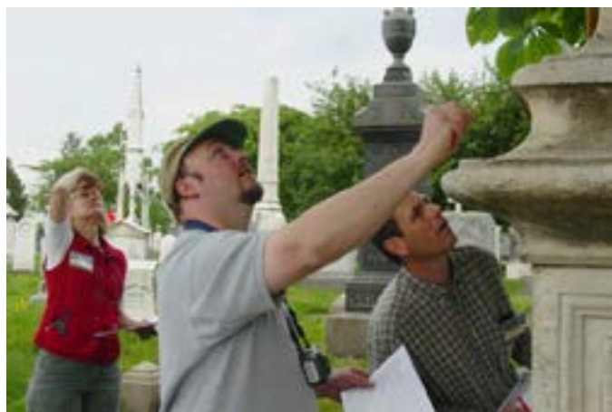
Figure 15a. Condition surveys are undertaken to document current conditions, determine safety issues, and plan both emergency stabilization and future treatment plans. There are a variety of survey forms available that can be tailored to the specific cemetery.

Condition assessments help identify potential safety hazards, required preservation work, and any additional conservation that is needed for stabilization and protection of grave markers. Assessments also provide important baseline information about deterioration affecting grave markers. The collected information is helpful in determining and prioritizing maintenance tasks, identifying unstable conditions that pose an immediate threat, and for developing a plan for any needed repair or conservation work. Assessments should be recurring, preferably every spring. Condition assessments also help determine the extent and severity of damage following a disaster.