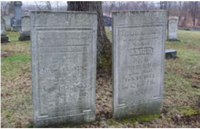
Figure 2. These mid-19th century, single-element stone grave markers in the Grove Cemetery in Bath, NY, are set in a vertical position.

slot” grave marker, the tabbed upper stone was set in a slotted base (Fig. 3). More common today, the upper headstone is secured with a technique that uses small spacers set on the base and a setting compound. This technique or one that uses an epoxy adhesive may be found on older markers where the stones have been reset.