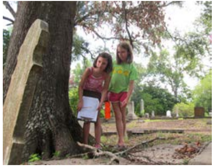
Figure 25. Involving the community in activities helps to develop an appreciation for the cemetery and serves to deter vandalism. Events may include children through school or scouting organizations and can help teach across the curriculum.

Maintenance is the key to extending the life of historic cemetery grave markers. From ensuring that markers are not damaged by mowing equipment and excessive lawn watering, to proper cleaning and resetting, good cemetery maintenance is the key to extending the life of grave markers. Whether rescuing a long-neglected small cemetery using volunteers or operating a large active cemetery with paid staff, the cemetery's documentation, maintenance and treatment plans should include periodic inspections. Only appropriate repair materials and techniques that do not damage historic markers should be used and records should be kept on specific repair materials used on individual grave markers. A well-maintained cemetery provides an attractive setting that can be appreciated by visitors, serves as a deterrent to vandalism, and provides a respectful place for the dead. A community history recorded in stone, wood and metal markers, cemeteries are an important part of our heritage, and are deserving of preservation efforts (Fig. 25).