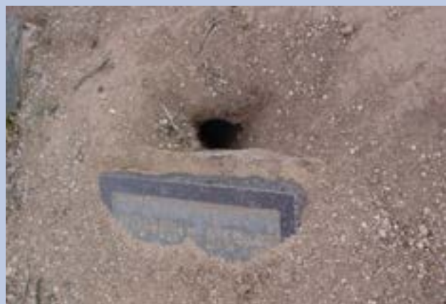
Figure C. Gophers and other burrowing animals produce uneven ground and holes that are trip and falling hazards to visitors and staff of historic cemeteries.

Trip and falling hazards include uneven ground, holes, open graves, toppled grave markers, fallen tree limbs, and other debris (Fig. C). Sitting, climbing, or standing on a grave marker should be avoided since the additional weight may cause