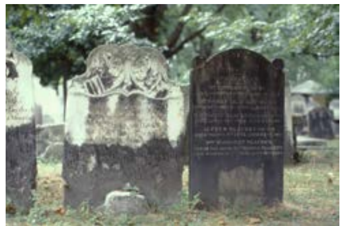
Figure 9. The limestone and sandstone grave markers in this historic cemetery have different weathering processes. On the left, the limestone shows surface loss in areas exposed to rainwater and gypsum crust formation below. The sandstone marker on the right displays uniform soiling, but surface hardening may be occurring.

All grave marker materials deteriorate when they are exposed to weathering such as sunlight, wind, rain, high and low temperatures, and atmospheric pollutants (Fig. 9). If a marker is composed of several materials, each may have a different weathering rate. Some weathering processes occur very quickly, and others gradually affect the condition of materials. Weathering results in deterioration in a variety of ways. For example, when exposed to rainwater some stones lose surface material while others form harder outer crusts that may detach from the surface.