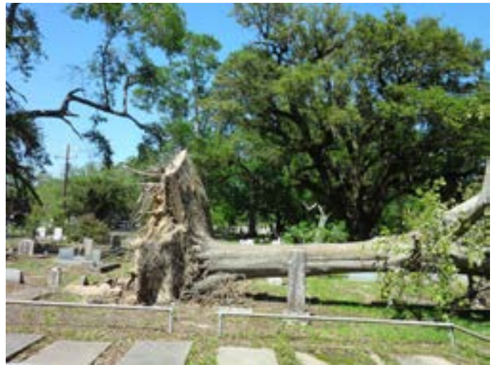
Figure 11. Woody vegetation can damage grave markers and pose a risk to visitors unless well managed and maintained.

Aside from vandalism and purposeful neglect, most risk factors attributable to human activity are unintentional. Sometimes damage to grave markers is the result of cleaning or repair done with the best of intentions. These unfortunate mistakes can be the result of insufficient training and funding, misuse of tools and equipment, and poor planning. With proper training and supervision, human risk factors can be lessened.