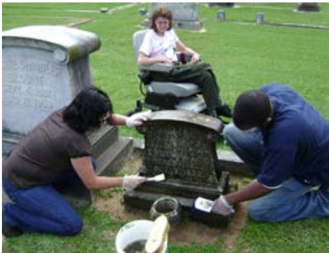
Figure 17. Volunteers can undertake cleaning of grave markers once they have received initial training. Cleaning methods may include wetting the stone, using a mild chemical cleaner, gently agitating the surface with a soft bristle brush, and thoroughly rinsing the marker with clean water.

General maintenance may involve low-pressure water washing. In most cases, surface soiling can be removed with a garden hose using municipal water or domestic