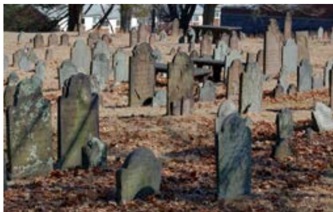
Figure 1. Sandstone and slate grave markers in the Ancient Burying Ground in New London, CT, display a variety of weathering conditions. Markers in the cemetery date from the mid-17th to the early 19th centuries.

This Preservation Brief focuses on a single aspect of historic cemetery preservation—providing guidance for owners, property managers, administrators, in-house maintenance staff, volunteers, and others who