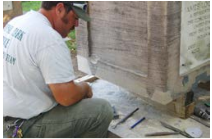
Figure 16. A professional mason works to insert a new piece of stone. Often referred to as a “dutchman”, this repair technique requires replacing the deteriorated stone section with a new finished piece of the same size and material.

The cemetery manager can use the information from the condition assessment report to develop a maintenance plan with a list of cyclical maintenance work. Many tasks can be carried out by in-house staff. For example, maintenance cleaning of metal and stonework can often be accomplished by rinsing with a garden hose. Applications of wax coatings can be used to protect bronze elements. Trained staff can undertake these tasks. Teaching graffiti removal techniques to cemetery staff may also be necessary if vandalism is an on-going problem. Staff should have access to written procedures