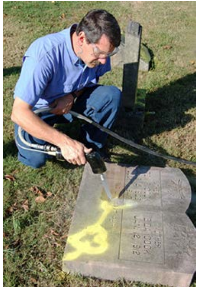
Figure 18. Graffiti is carefully removed using a low-pressure dry-ice misting instrument.

If the graffiti is water soluble, it can be removed using water and a soft cloth or towel. Rinsing the cloth frequently helps to avoid smearing graffiti on unaffected areas. If the graffiti is not water soluble, organic solvents or commercial graffiti removal products suitable for the grave marker material are recommended. Products should be tested prior to use. General cleaning of the entire marker is a good follow-up for a more even appearance. For deep-seated graffiti, poultice cleaning (previously described) may be required to extract staining materials.