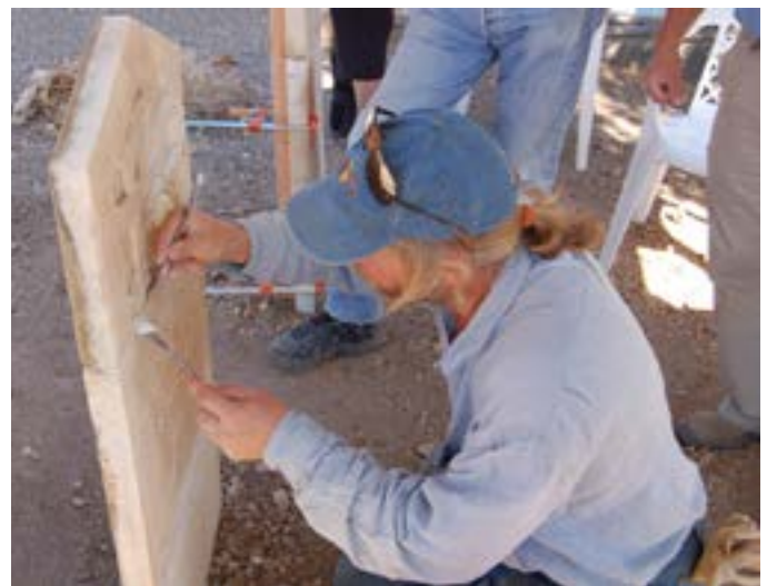
Figure 21. Cracks in a stone marker should be filled to keep water and debris out and prevent the crack from becoming larger. A patching mortar is designed to be used, in this case, with historic marble.

Hairline masonry cracks may be the result of natural weathering and require no immediate treatment except to be photographed and recorded. However, larger cracks often merit further attention. Repairing masonry cracks involves several steps and typically a skilled hand (Fig. 21). The repair begins with the removal of loose material and cleaning. Materials that are used for crack repair include grouts for small cracks and epoxy for large cracks affecting the structural integrity of the monument. Gravity or pressure injection is used to apply grout or epoxy. Crack repair can be messy, so careful planning and experience are helpful. If the crack is active, a change in size of the crack will be noted over time. Active cracks require further investigation to ascertain the cause of the changes, such as differential settlement, and to correct, if possible, the cause prior to repairing the crack.