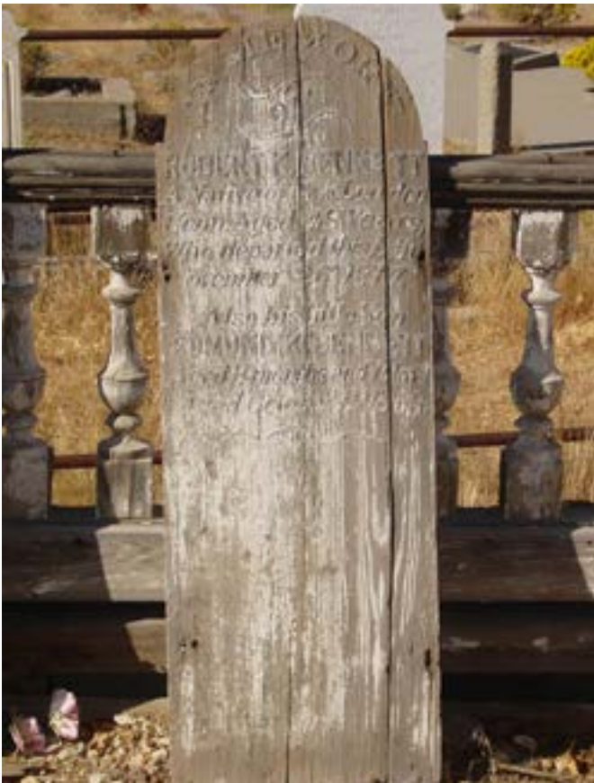
Figure 7. As shown by this 1877 marker in Silver Terrace Cemetery, Virginia City, NV, exposure to sunlight can damage wood grave markers, making the wood more susceptible to water damage and cracking.

and characteristics of these cells determine the wood's appearance and influence wood properties. Wood-cell walls and cavities contain moisture. Oven drying reduces the moisture content of wood. After the drying process, the wood continues to expand and contract with changes in moisture content. The loss of water from cell walls causes wood to shrink, sometimes distorting its original shape (Fig. 7).