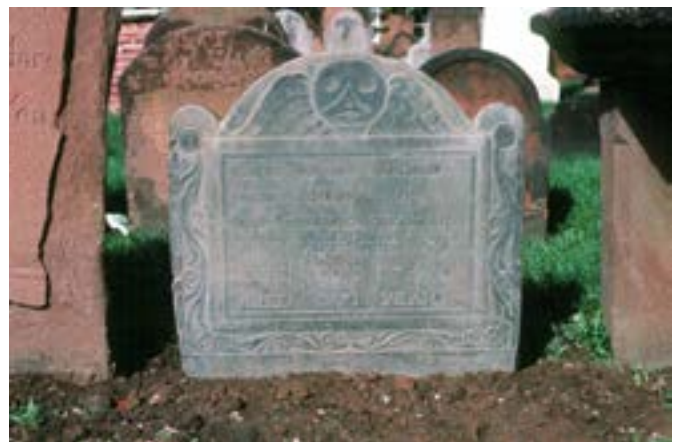
Figure 20c. The reset ground-supported grave marker should be level and plumb.