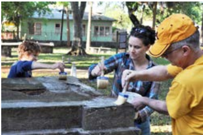
Figure 23. Limewash is a breathable coating sometimes used to protect the surface of the grave marker and provide a decorative finish. Limewash is applied by brush in five to eight thin coats (with each coat about the consistency of skim milk). The surface is allowed to slowly dry between coats. Sometimes the surface is covered by damp burlap to slow the drying process.

Limewash is a traditional coating that brightens stucco-covered grave markers (Fig. 23). Like paint coatings, it needs to be periodically applied. Limewash is prepared with lime putty or hydrated lime and water. Curing begins following application. The lime putty or hydrated lime reacts with carbon dioxide in the air in a process called carbonation. This reaction eventually forms calcium carbonate, a stable hard coating. Limewash is a “green” coating with no volatile organic compound content and is “breathable,” i.e., it allows for water vapor transmission. Although commonly white, limewash can be colored or tinted with alkali-stable pigments such as iron oxide.