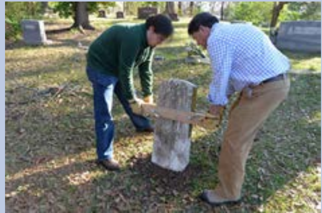
Figure E1. The simple wooden clamp system allows two people to safely lift a marble grave marker.

Proper work practices and lifting techniques need to be used whenever lifting or resetting grave markers. Many markers are surprisingly heavy. For example, a common upright marble headstone measuring 42" long, 13" wide, and 4" deep weighs over 200 pounds. Volunteers and workers should work in pairs, be able bodied, and have training in safe