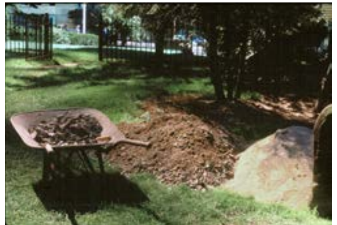
Figure 20b. To facilitate drainage, crushed stone, gravel, and sharp sand line the hole and are hand-tamped around the stone after placement.