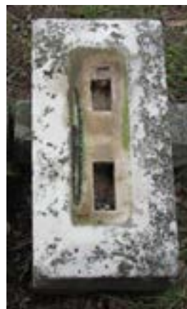
Figure 3. A multi-element grave marker from the early 19th century in the St. Michael’s Cemetery, Pensacola, FL, consists of a vertical element with tabs (left image) into a slotted base (right image).

Stacked-base grave markers use multiple bases to increase the height of the monument and provide a stable foundation for upper elements. Tall, four-sided tapered monuments, known as obelisks, are typically placed on stacked bases. Columns or upright pillars have three main parts – a base, shaft, and capital. Multiple-element grave markers may also include figurative or sculptural components. Traditionally, stacked base grave markers were set on lead shims with mortar joints or with lead ribbon along the outer edges.