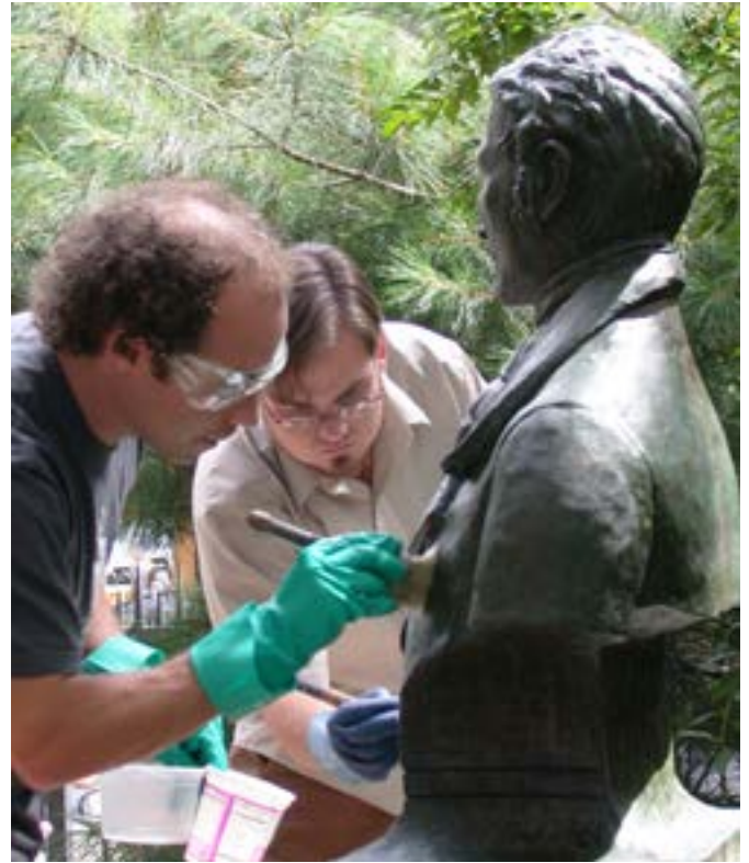
Figure 22. A protective coating must be maintained on metal elements. Wax or lacquer coatings help preserve the bronze patina and slow corrosion. Conservators apply a microcrystalline wax to this bust at St. Mark's Church in-the-Bowery, New York, NY.

Wax coatings are often used for bronze markers (Fig. 22). Wax provides a protective barrier against moisture, soiling, and graffiti. There are several steps in the wax application process. Where there is little corrosion, gentle cleaning of the marker is undertaken prior to applying the wax coating. Apply a thin layer of wax to the marker using a stencil brush or chip brush.