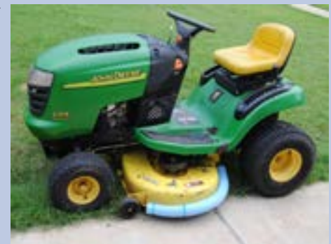
Figure B. A pool ‘noodle’ can be fitted to the deck of a lawnmower to prevent damage to grave markers.

Ongoing maintenance of cemetery vegetation is essential to conserve grave markers and fencing. Periodic inspections may warrant removing trees; trimming tree limbs, shrubs, and vines; and removing volunteer vegetation. All trees should be inspected at least every five years. Annual inspections are necessary to assess the condition of shrubs and vines, and to identify volunteer growth for removal. Mowing and trimming around the hundreds of stone, brick, iron, and wood features found in many cemeteries is a weekly or bi-weekly chore. Lawn care is the most time-consuming, and, if not done carefully, potentially destructive maintenance activity in historic cemeteries.