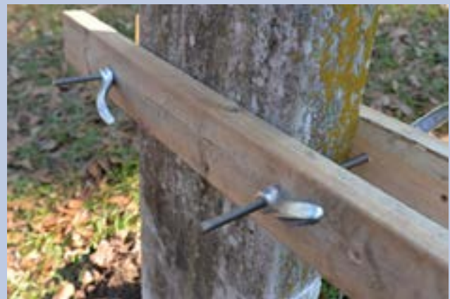
Figure E2. The clamp system is constructed from off-the-shelf wooden boards.

lifting techniques. Lift equipment and ergonomically correct tools should be routinely used to lift heavy markers (for most people this includes markers that weight more than 50 pounds). For smaller grave markers, a simple wooden clamp system can be constructed for a two-person lift (Figs. E1 and E2).