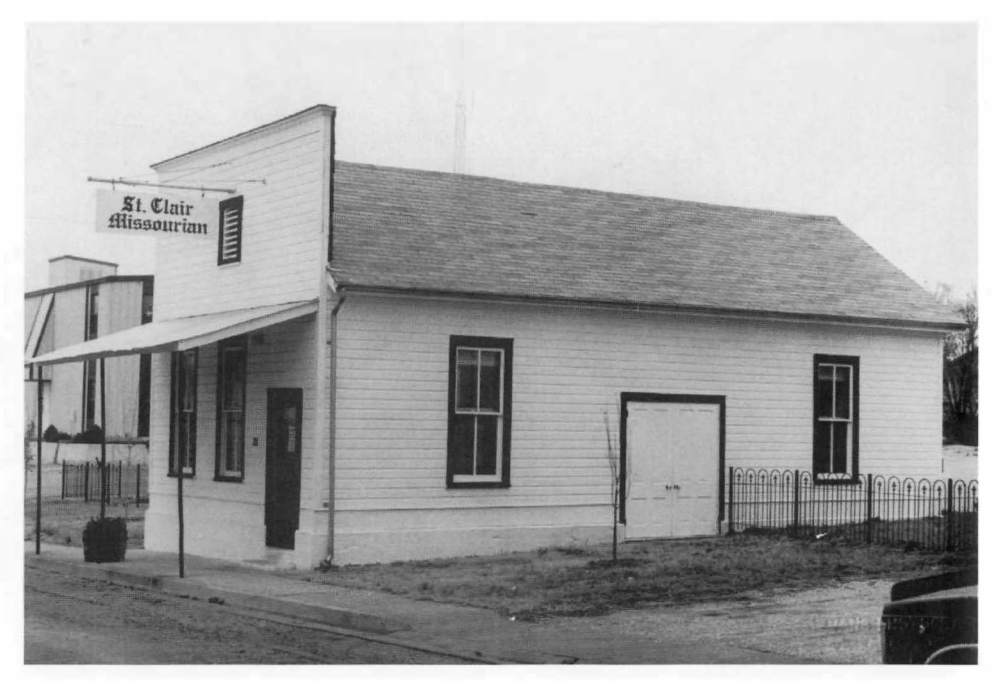
Panhorst Feed Store

The National Register nomination form records the property at the time