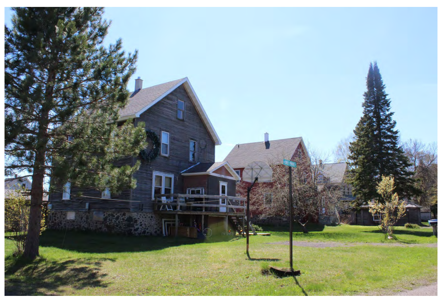
Lower Pewabic Housing Location Landscape Character Area 3. Residences along West Lower Pewabic Street (left to right: MAP ID#s 141, 140, 139 and 138).

United States Department of the Interior, National Park Service