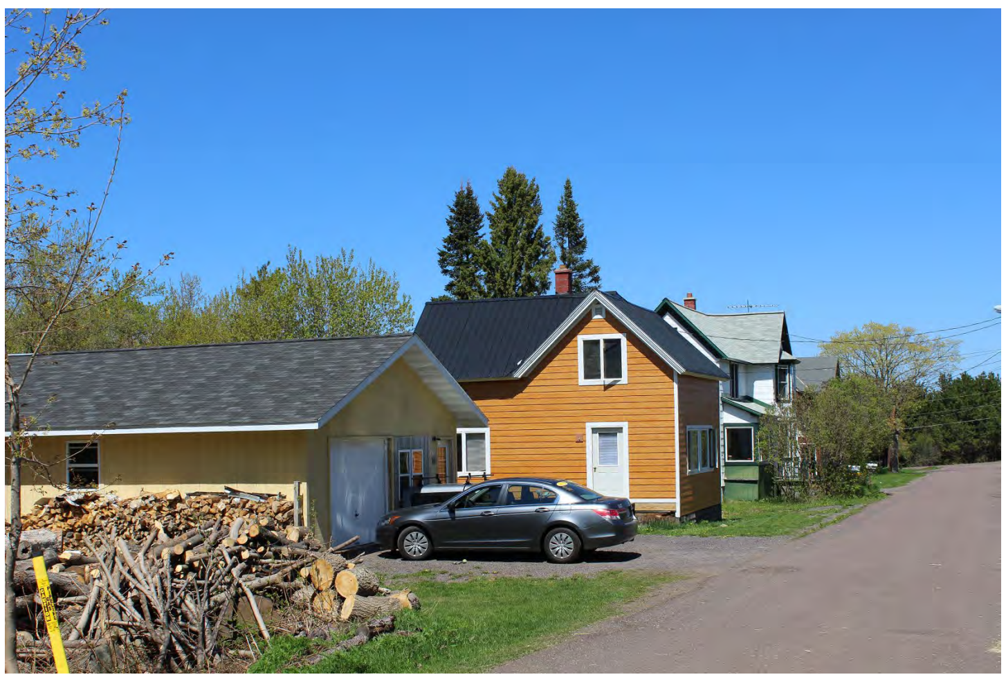
Quincy Hill Housing and Mine Management Landscape Character Area 2. Limerick Housing Location, residences along E. 2<sup>nd</sup> Street (left to right: MAP ID#s 126 outbuilding, 126, and 127).

United States Department of the Interior, National Park Service