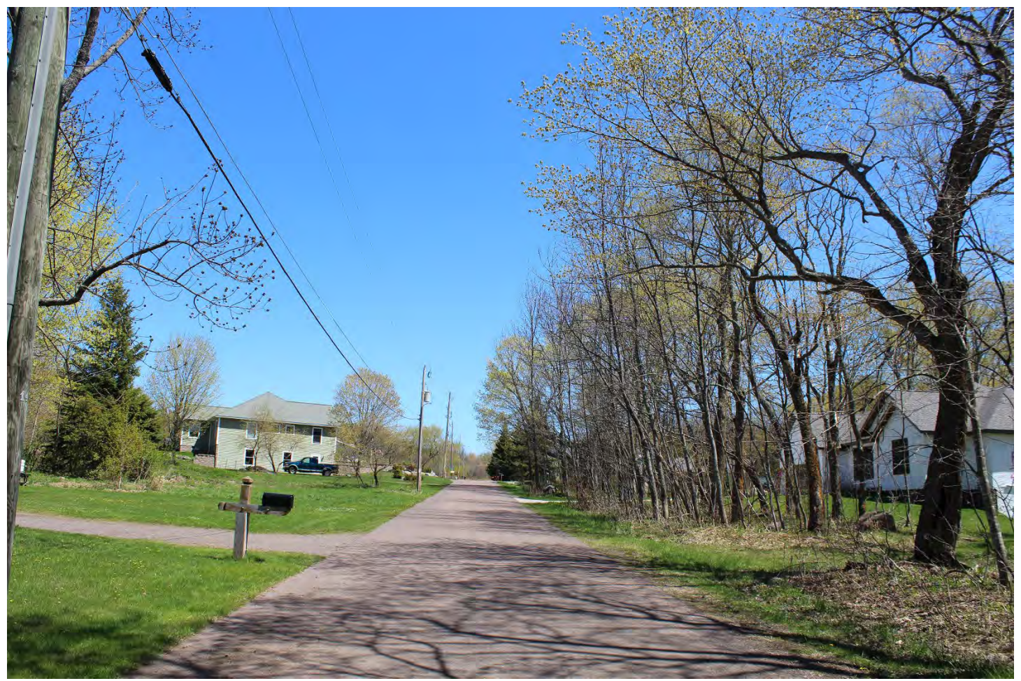
Quincy Hill Housing and Mine Management Landscape Character Area 2. Non-contributing resources along Raasio Road (left to right: MAP ID#s 058 and 059).

United States Department of the Interior, National Park Service