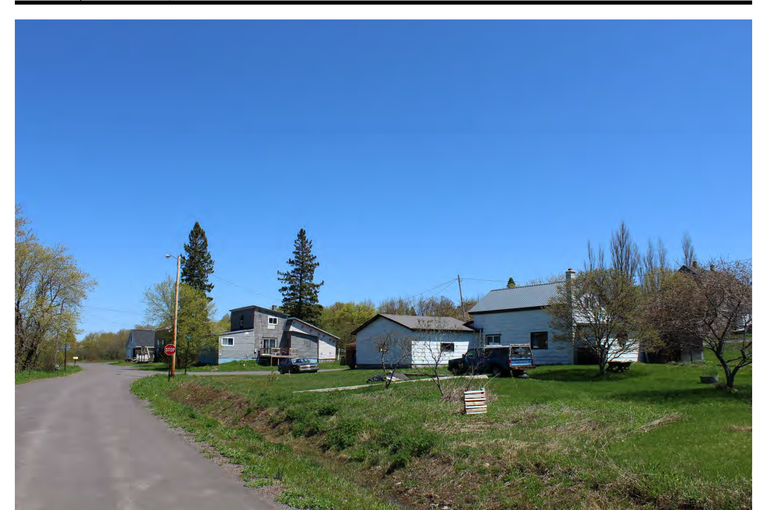
Quincy Hill Housing and Mine Management Landscape Character Area 2. Limerick Housing Location, residences along Mine Rock Road (left to right: MAP ID#s 103 (non-contributing outbuilding), and 102).

United States Department of the Interior, National Park Service