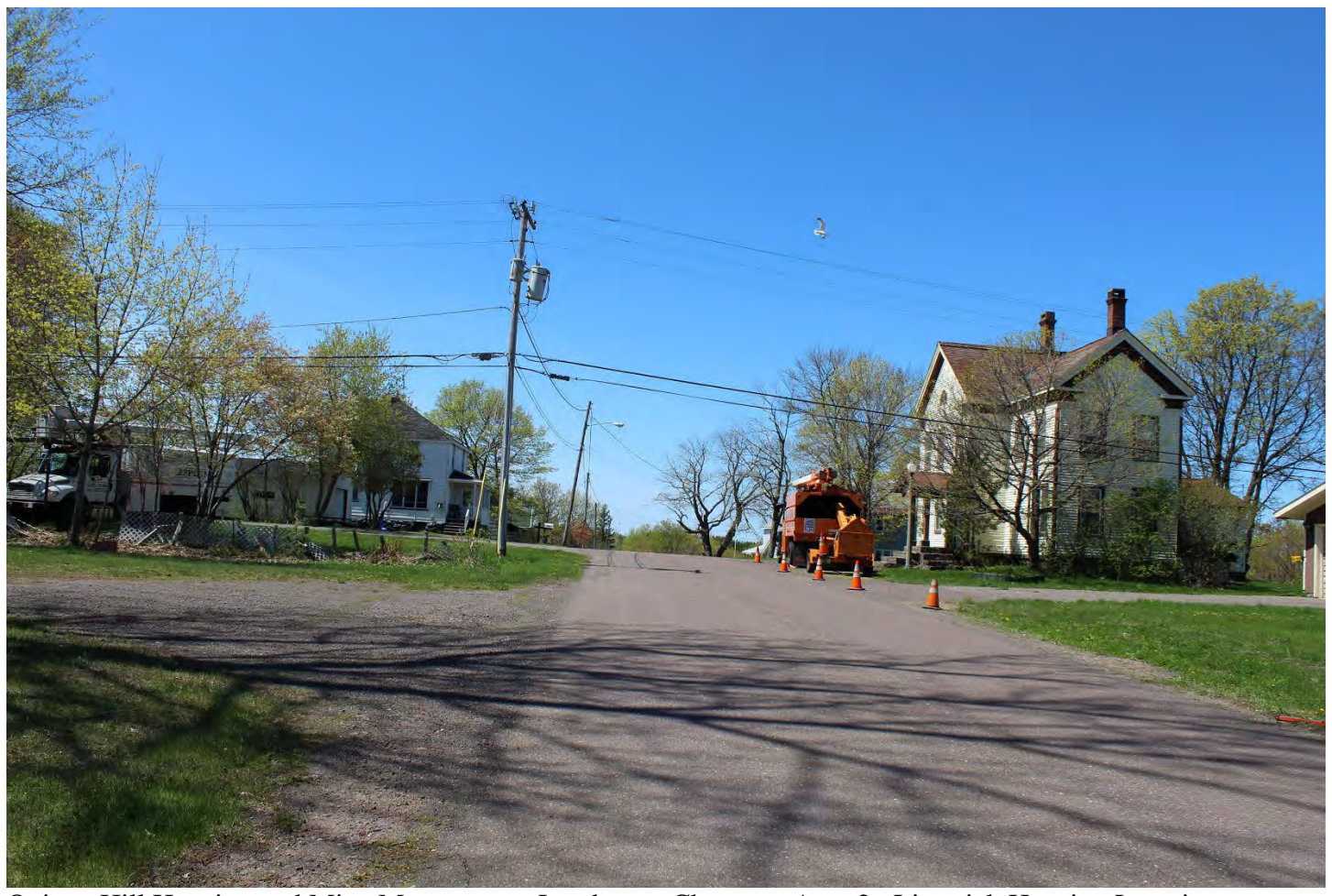
Quincy Hill Housing and Mine Management Landscape Character Area 2. Limerick Housing Location, residences along 5<sup>th</sup> Street (left to right: MAP ID#s 114 and 115).

United States Department of the Interior, National Park Service