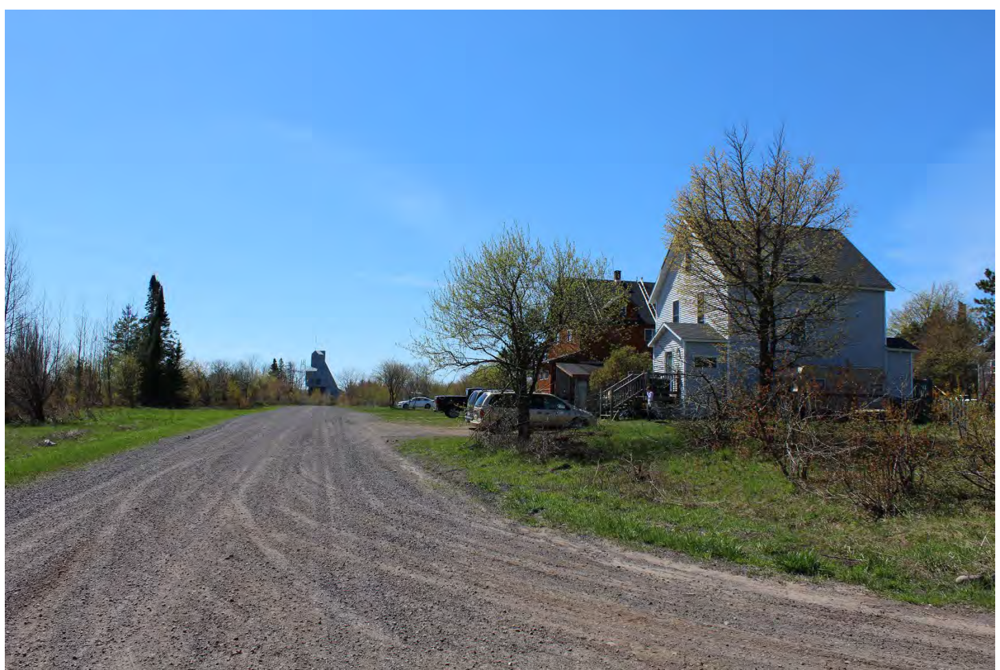
Lower Pewabic Housing Location Landscape Character Area 3. Residences along South Street (right to left: MAP ID#s 145 and 144). The No. 2 Shaft-Rockhouse (Map ID# 006) is in the distance.

Quincy Mining Company Historic District Hancock Vicinity Houghton County, MI View to the west. Photo by Quinn Evans Architects, May 2016 TIFF images on file with NPS in Washington, DC