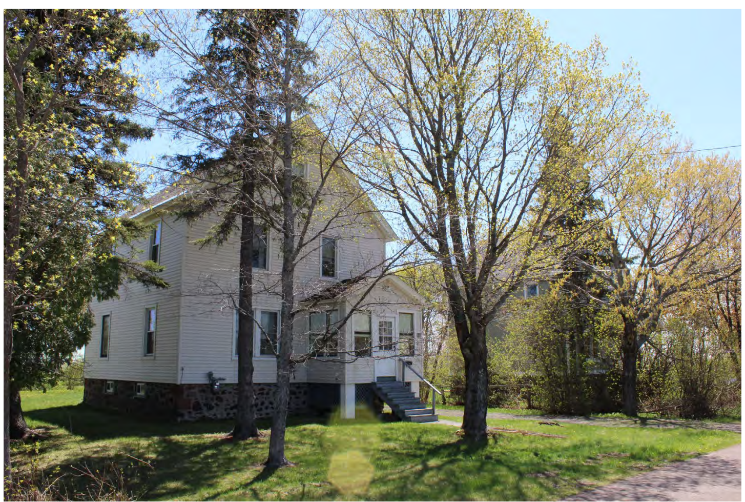
Quincy Hill Housing and Mine Management Landscape Character Area 2. Limerick Housing Location, Limerick Street residence (MAP ID# 088).

United States Department of the Interior, National Park Service