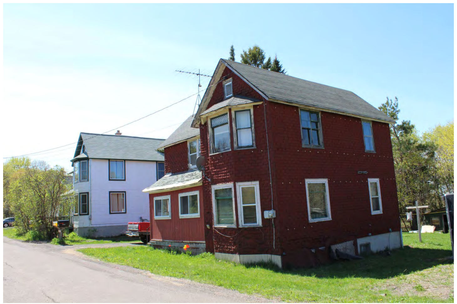
Quincy Hill Housing and Mine Management Landscape Character Area 2. Limerick Housing Location, residences along E. 2<sup>nd</sup> Street (right to left: MAP ID#s 128 and 127).

United States Department of the Interior, National Park Service