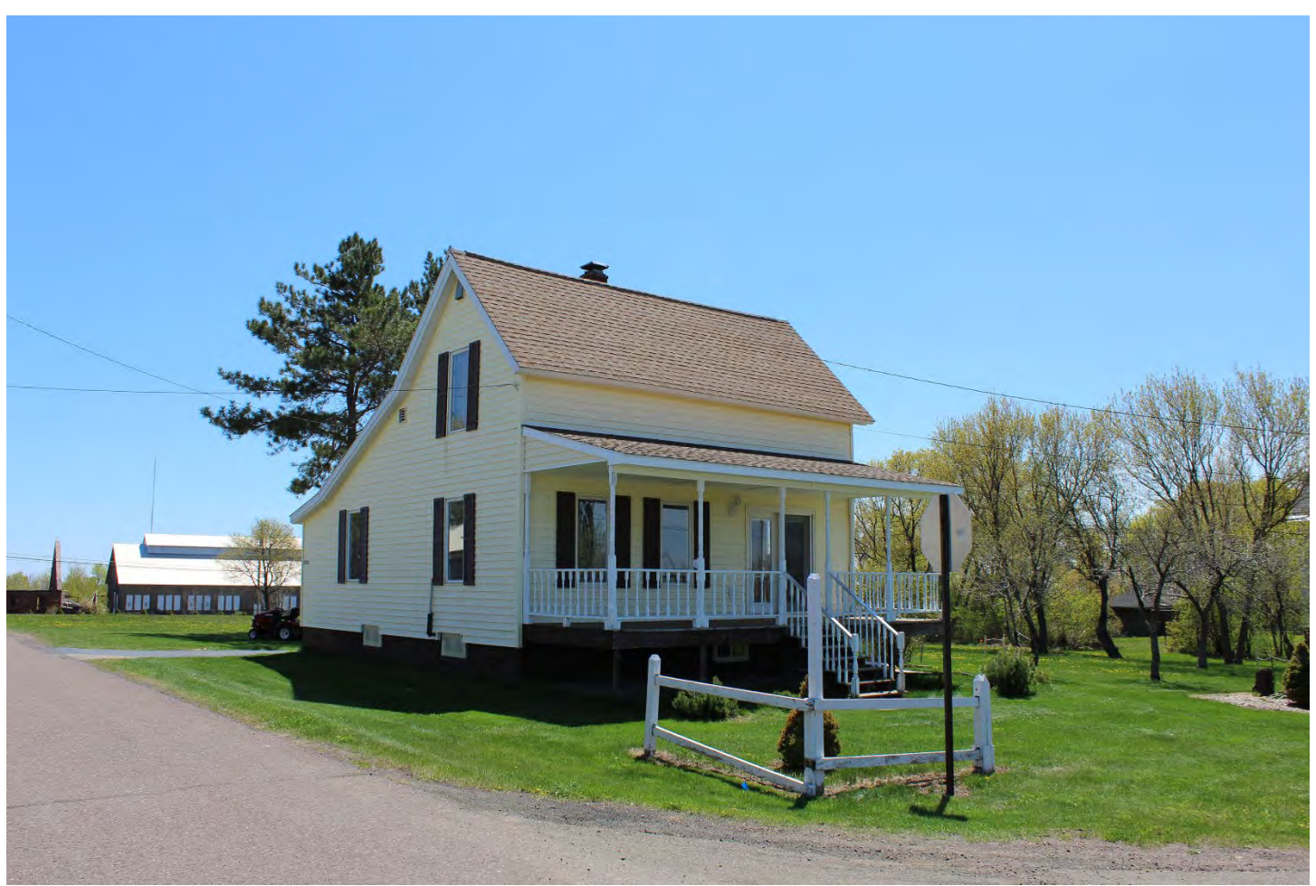
Quincy Hill Housing and Mine Management Landscape Character Area 2. Limerick Housing Location, Limerick Street residence (MAP ID# 090). The Quincy Machine Shop (MAP ID# 023) in the background.

<u>United States Department of the Interior, National Park Service</u>