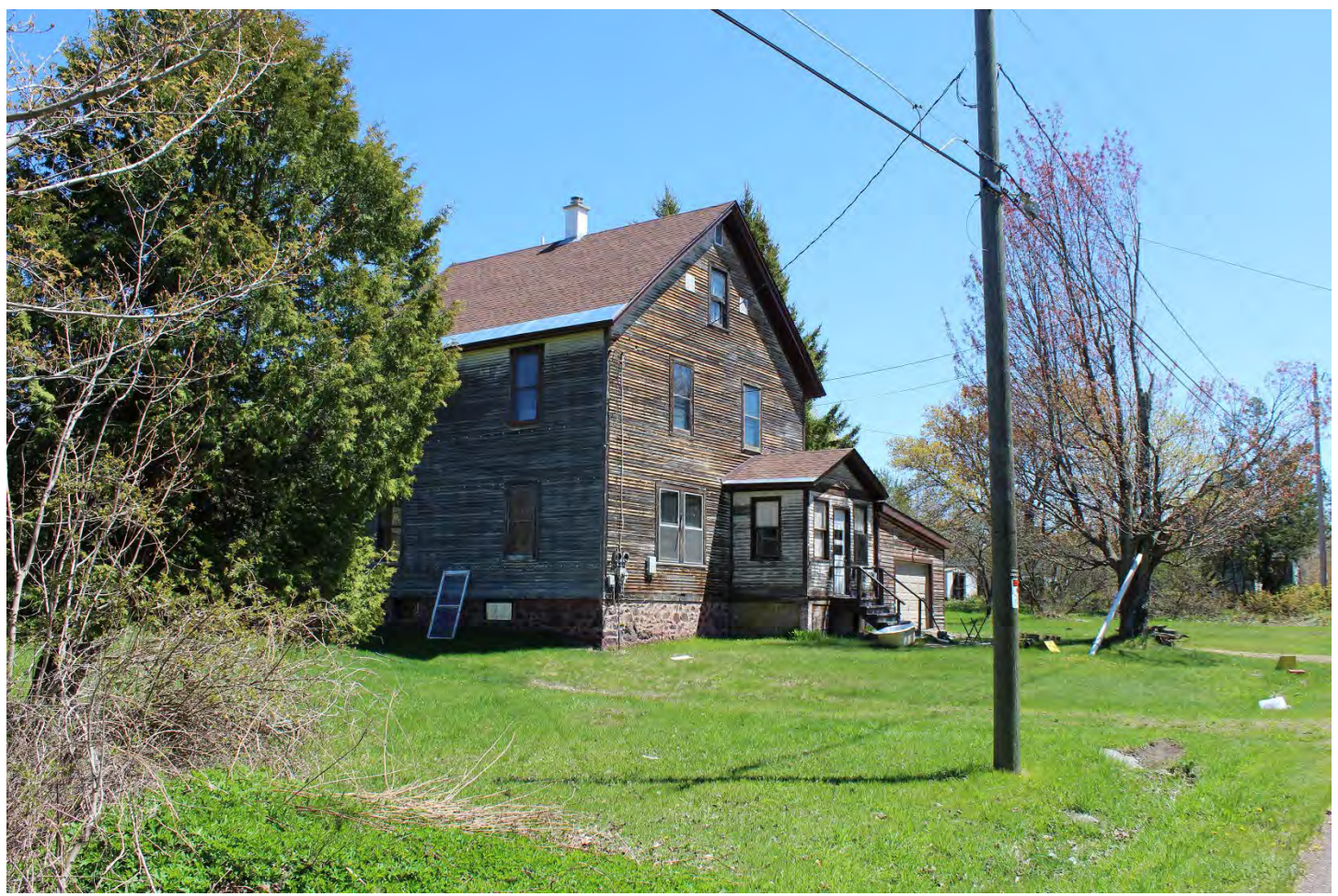
Quincy Hill Housing and Mine Management Landscape Character Area 2. Sing-Sing Housing Location, Sing-Sing Road residence (MAP ID#s 068).

United States Department of the Interior, National Park Service