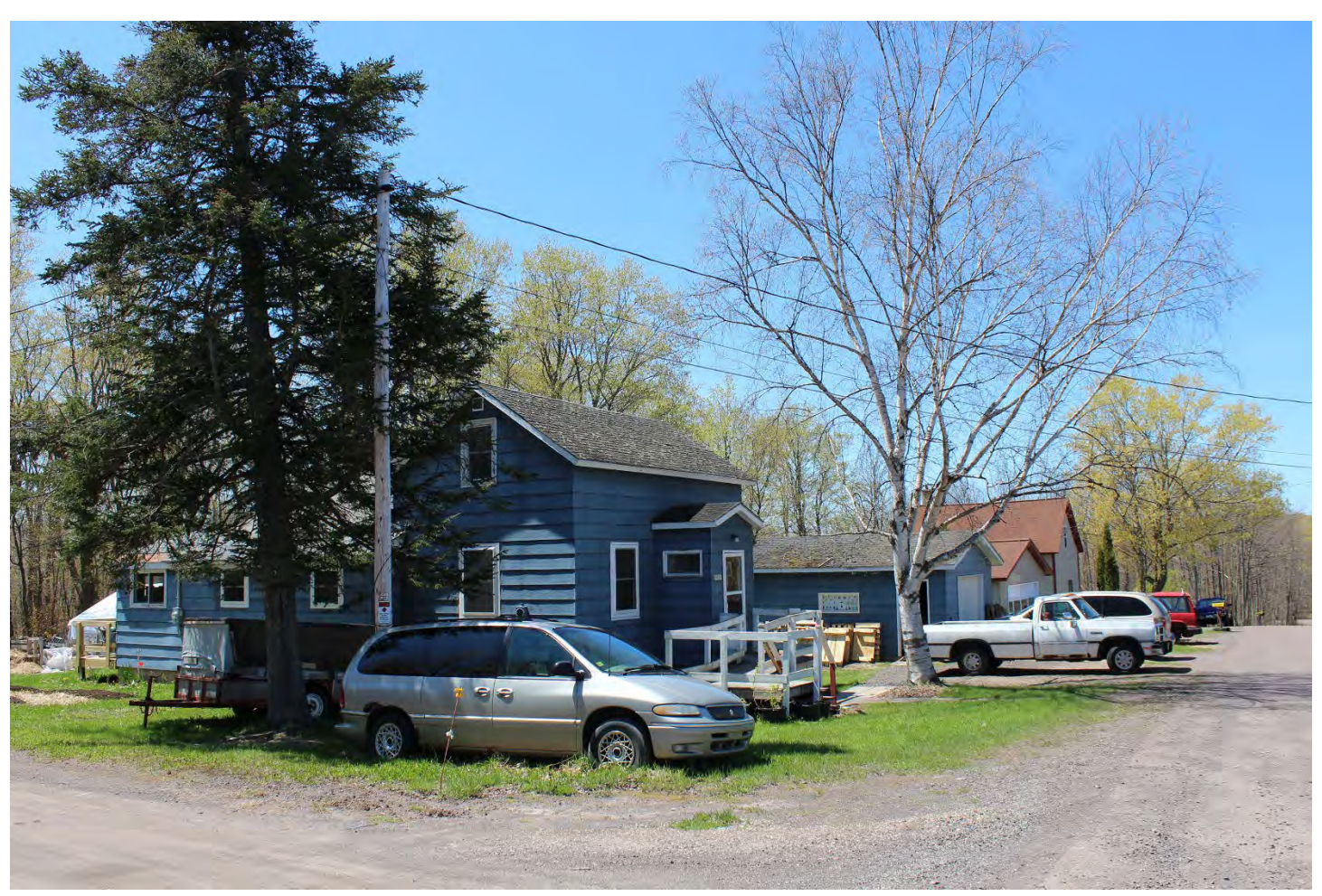
Quincy Hill Housing and Mine Management Landscape Character Area 2. Sing-Sing Housing Location, Road No. 2 Residences (left to right: MAP ID#s 074 and 073).

United States Department of the Interior, National Park Service