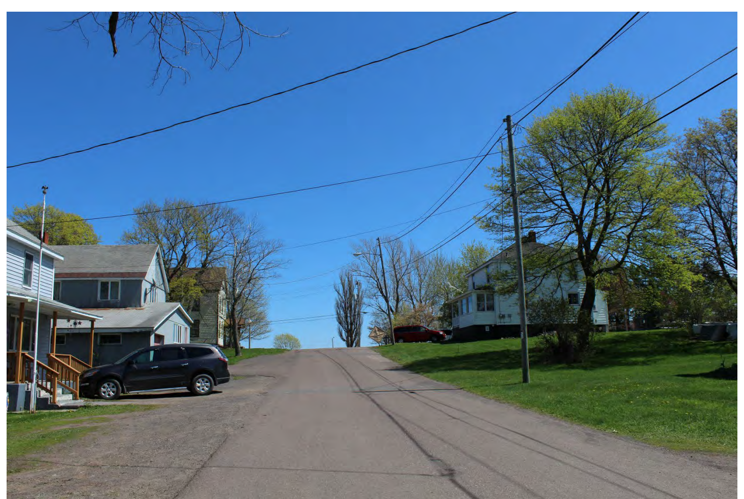
Quincy Hill Housing and Mine Management Landscape Character Area 2. Limerick Housing Location, residences along 5<sup>th</sup> Street (left to right: MAP ID#s 117 porch, 116, 115, 114).

United States Department of the Interior, National Park Service