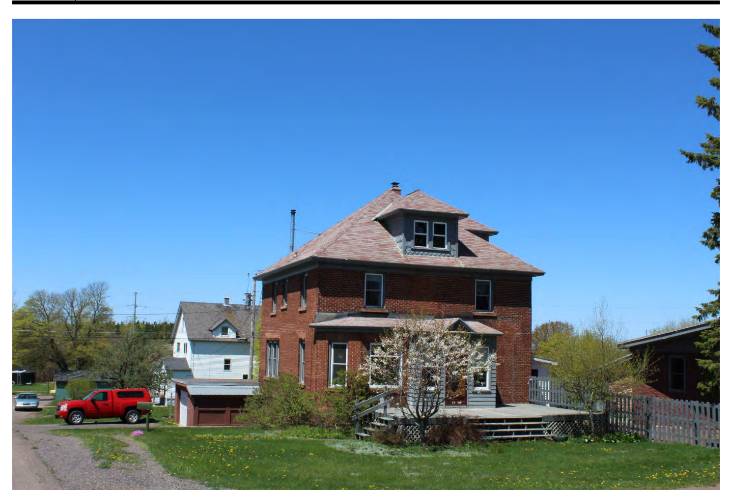
Quincy Hill Housing and Mine Management Landscape Character Area 2. Limerick Housing Location, Catholic Church Rectory (MAP ID# 096).

United States Department of the Interior, National Park Service