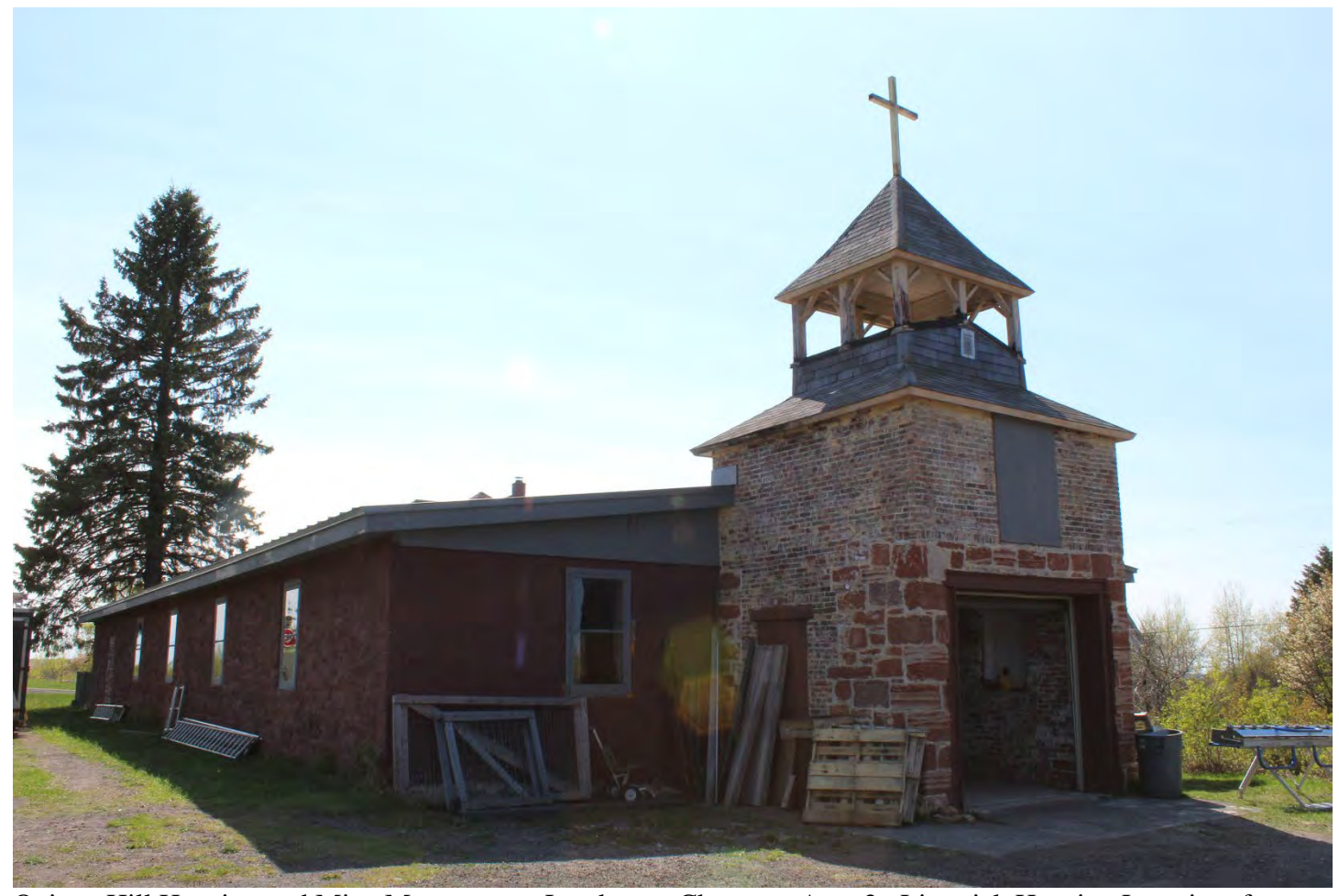
Quincy Hill Housing and Mine Management Landscape Character Area 2. Limerick Housing Location, former Catholic Church on E. 2<sup>nd</sup> Street (MAP ID# 095).

Quincy Mining Company Historic District Hancock Vicinity Houghton County, MI View to the southwest. TIFF images on file with NPS in Washington, DC