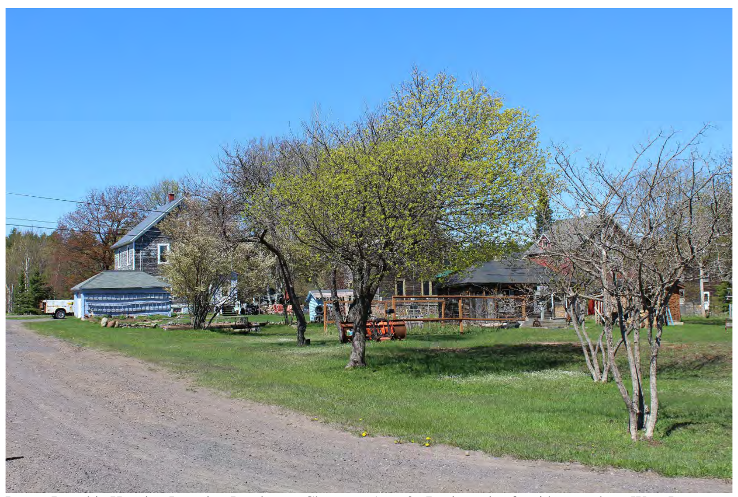
Lower Pewabic Housing Location Landscape Character Area 3. Back yards of residences along West Lower Pewabic Street (left to right: MAP ID#s 138 and 139).

United States Department of the Interior, National Park Service