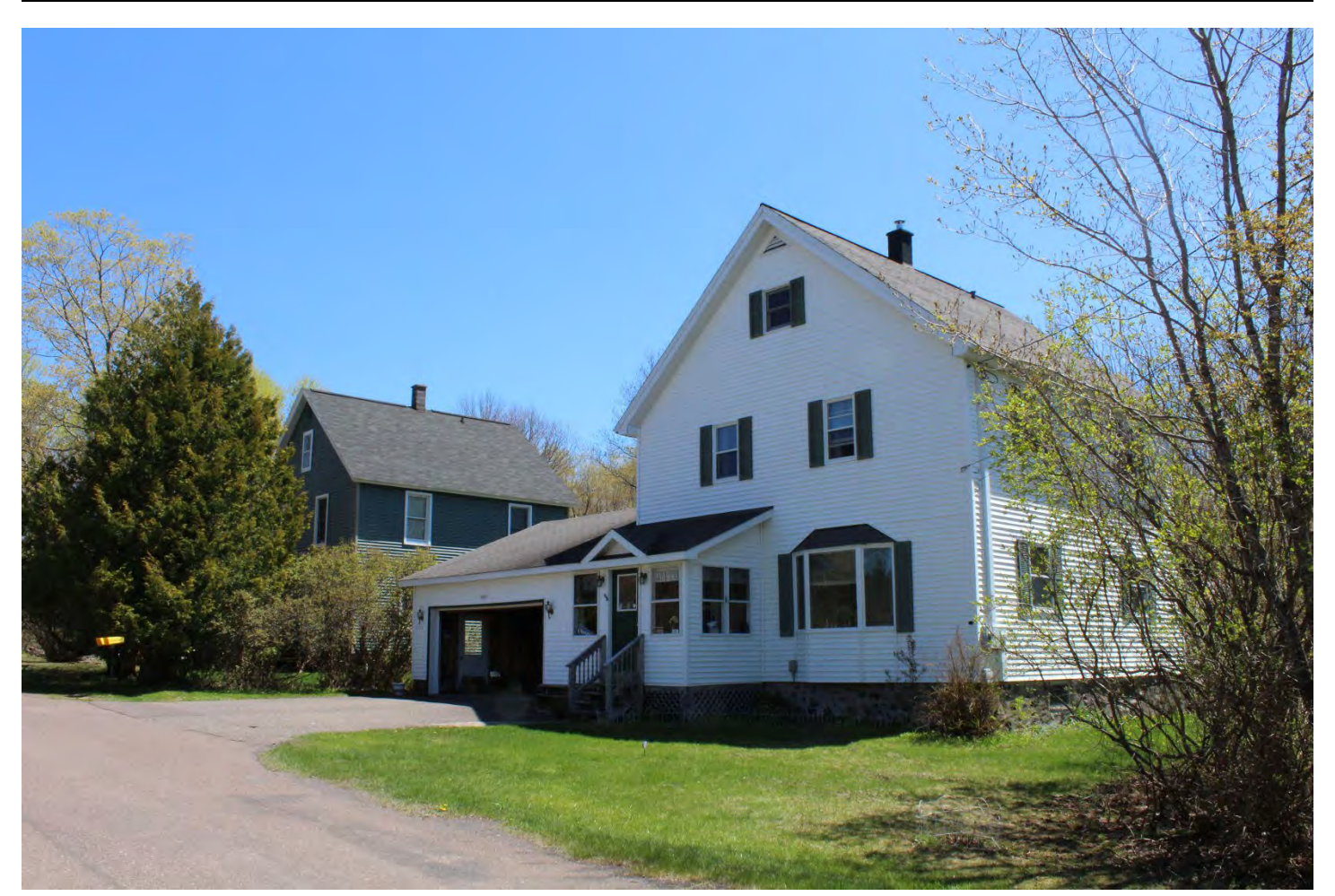
Quincy Hill Housing and Mine Management Landscape Character Area 2. Sing-Sing Housing Location, French Town Road residences (right to left: MAP ID#s 065 and 066).

United States Department of the Interior, National Park Service