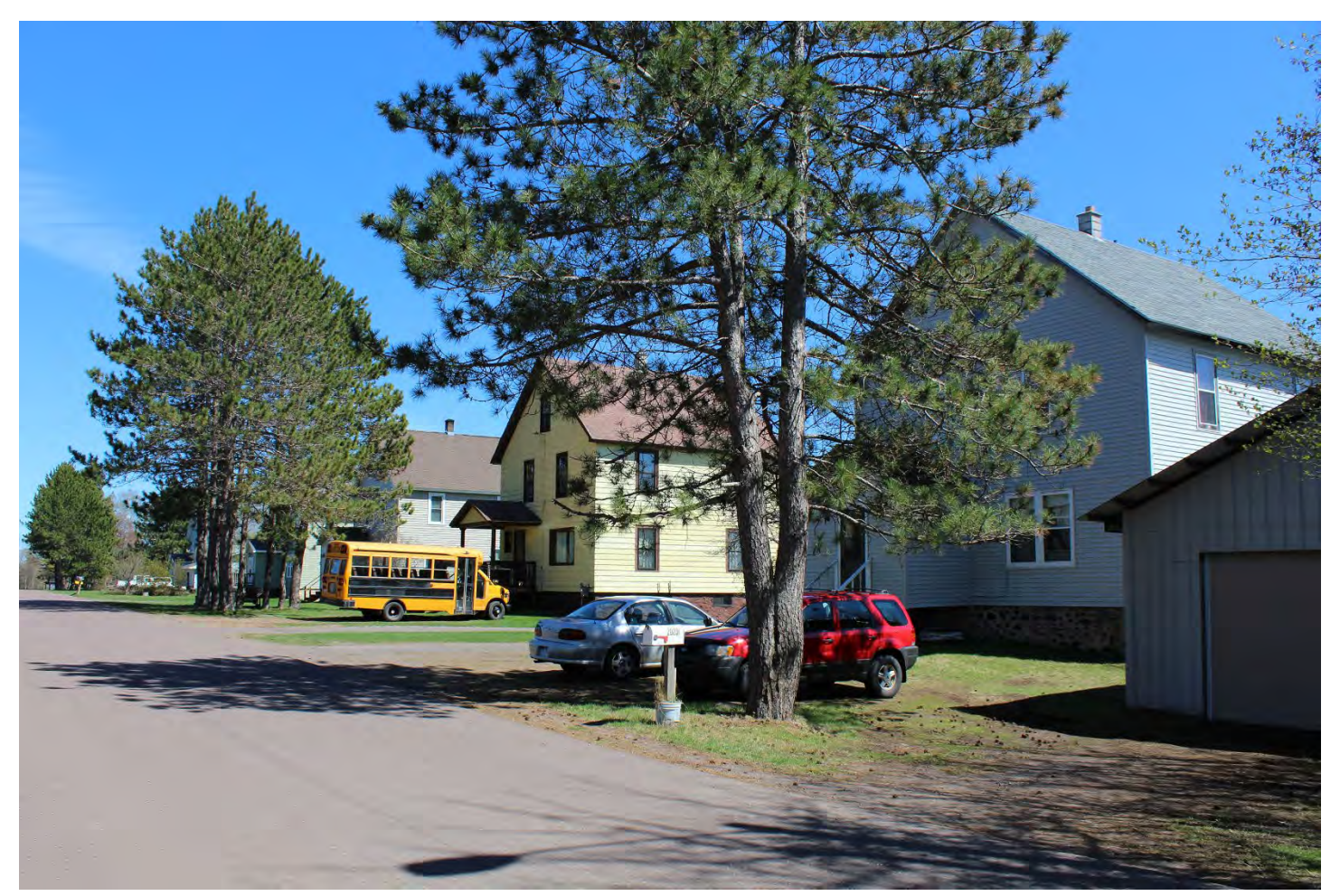
Lower Pewabic Housing Location Landscape Character Area 3. Residences along West Lower Pewabic Street (right to left: MAP ID#s 132 and garage, 133 and 134).

United States Department of the Interior, National Park Service