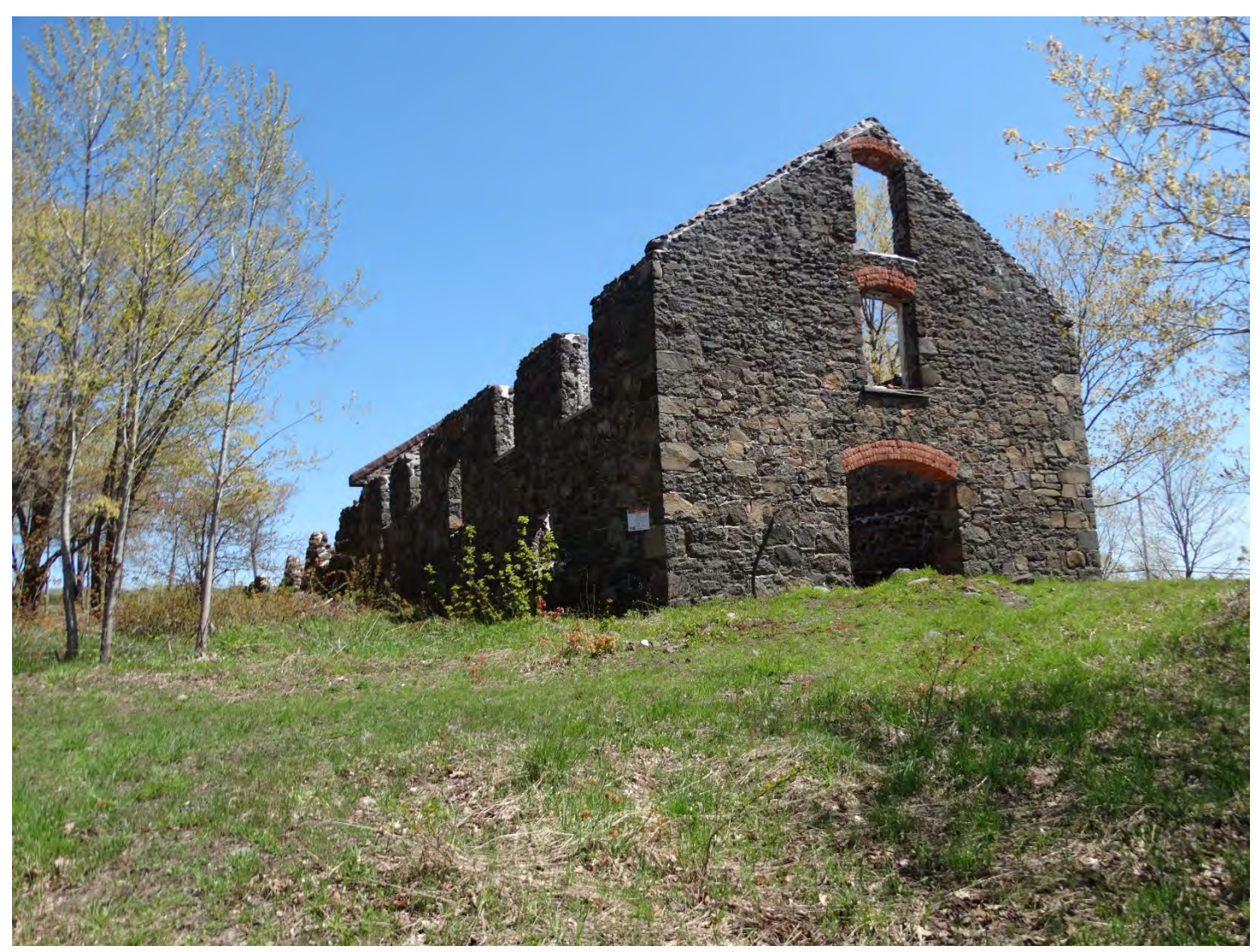
Quincy Hill Housing and Mine Management Landscape Character Area 2. Quincy Dryhouse Ruin (MAP ID# 076).

Quincy Mining Company Historic District Hancock Vicinity Houghton County, MI View to the north. TIFF images on file with NPS in Washington, DC