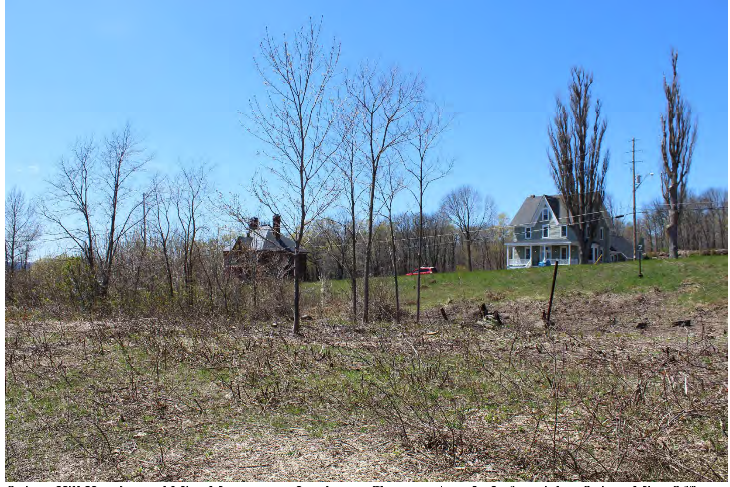
Quincy Hill Housing and Mine Management Landscape Character Area 2. Left to right: Quincy Mine Office (MAP ID# 045) and Mine Captain's Residence (MAP ID# 046).

Quincy Mining Company Historic District Hancock Vicinity Houghton County, MI View to the north across US-41. Photo by Quinn Evans Architects, May 2016 TIFF images on file with NPS in Washington, DC