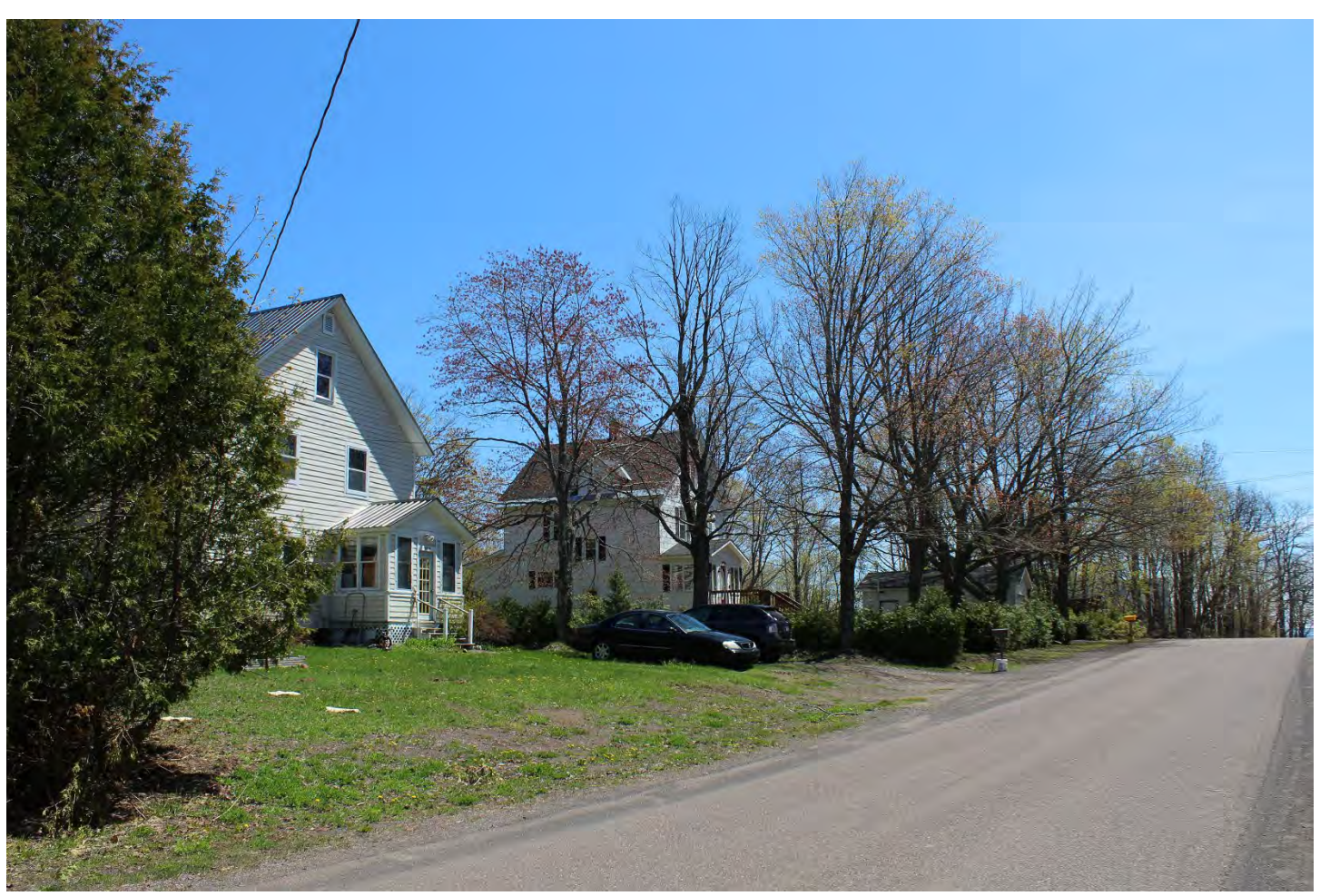
Quincy Hill Housing and Mine Management Landscape Character Area 2. Frenchtown Housing Location, French Town Road Residences (left to right: MAP ID#s 050 and 049).

United States Department of the Interior, National Park Service