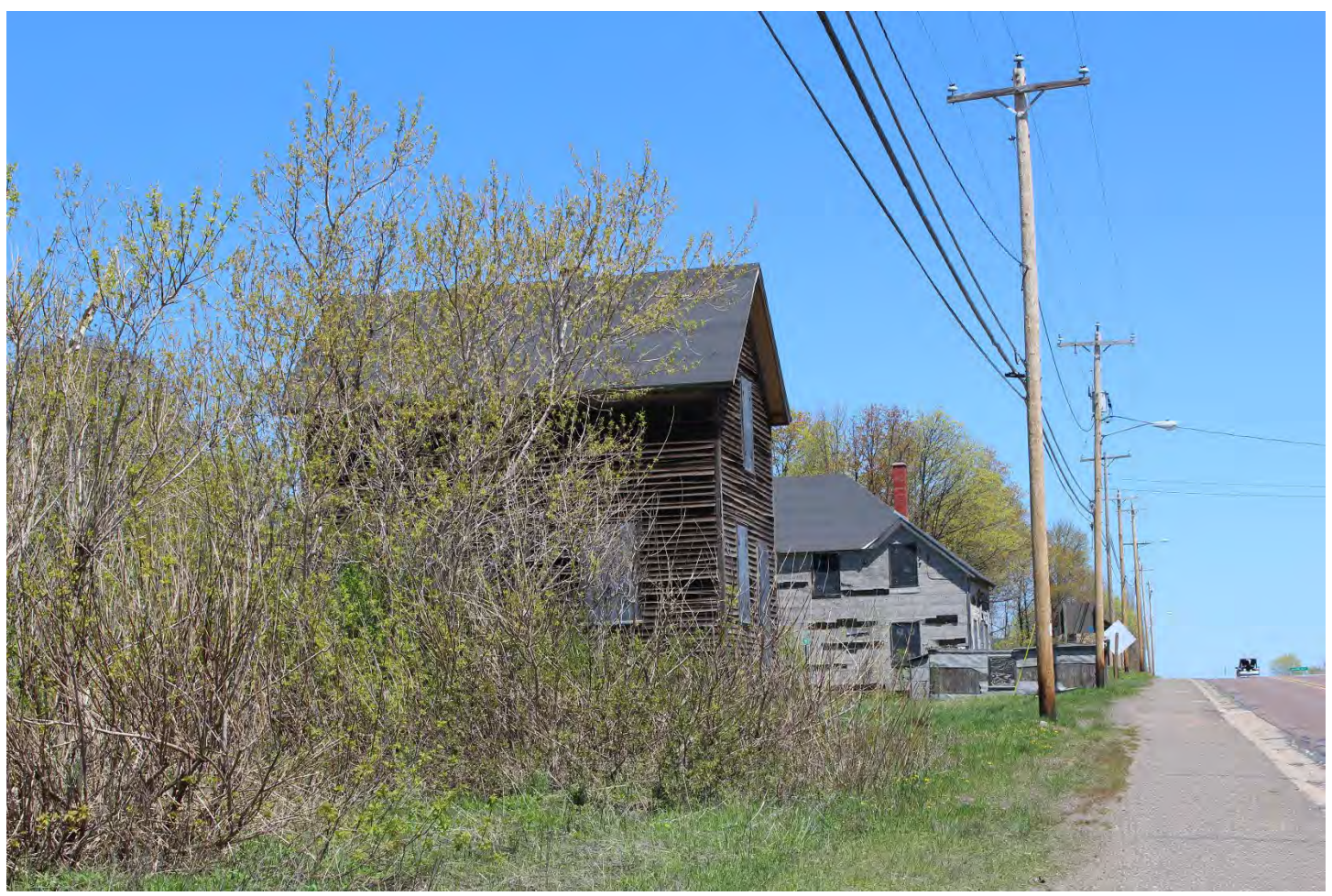
Quincy Hill Housing and Mine Management Landscape Character Area 2. Limerick Housing Location, Residences along US-41 (left to right: MAP ID#s 085 and 086).

United States Department of the Interior, National Park Service