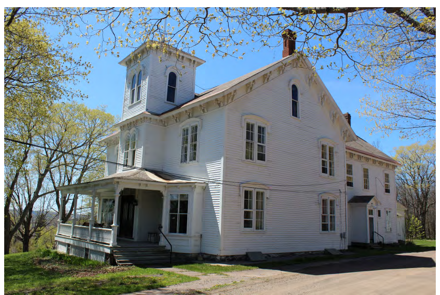
Quincy Hill Housing and Mine Management Landscape Character Area 2. Quincy Mine Superintendent's Residence (MAP ID# 044).

United States Department of the Interior, National Park Service