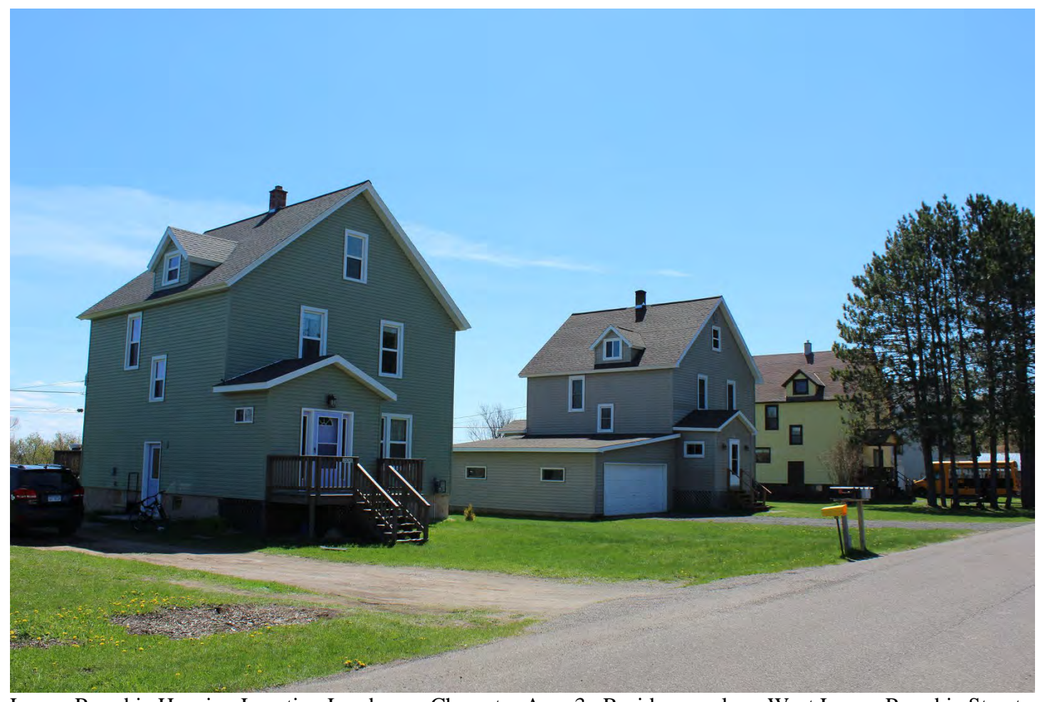
Lower Pewabic Housing Location Landscape Character Area 3. Residences along West Lower Pewabic Street (left to right: MAP ID#s 135, 134 and 133).

National Historic Landmarks Nomination Form