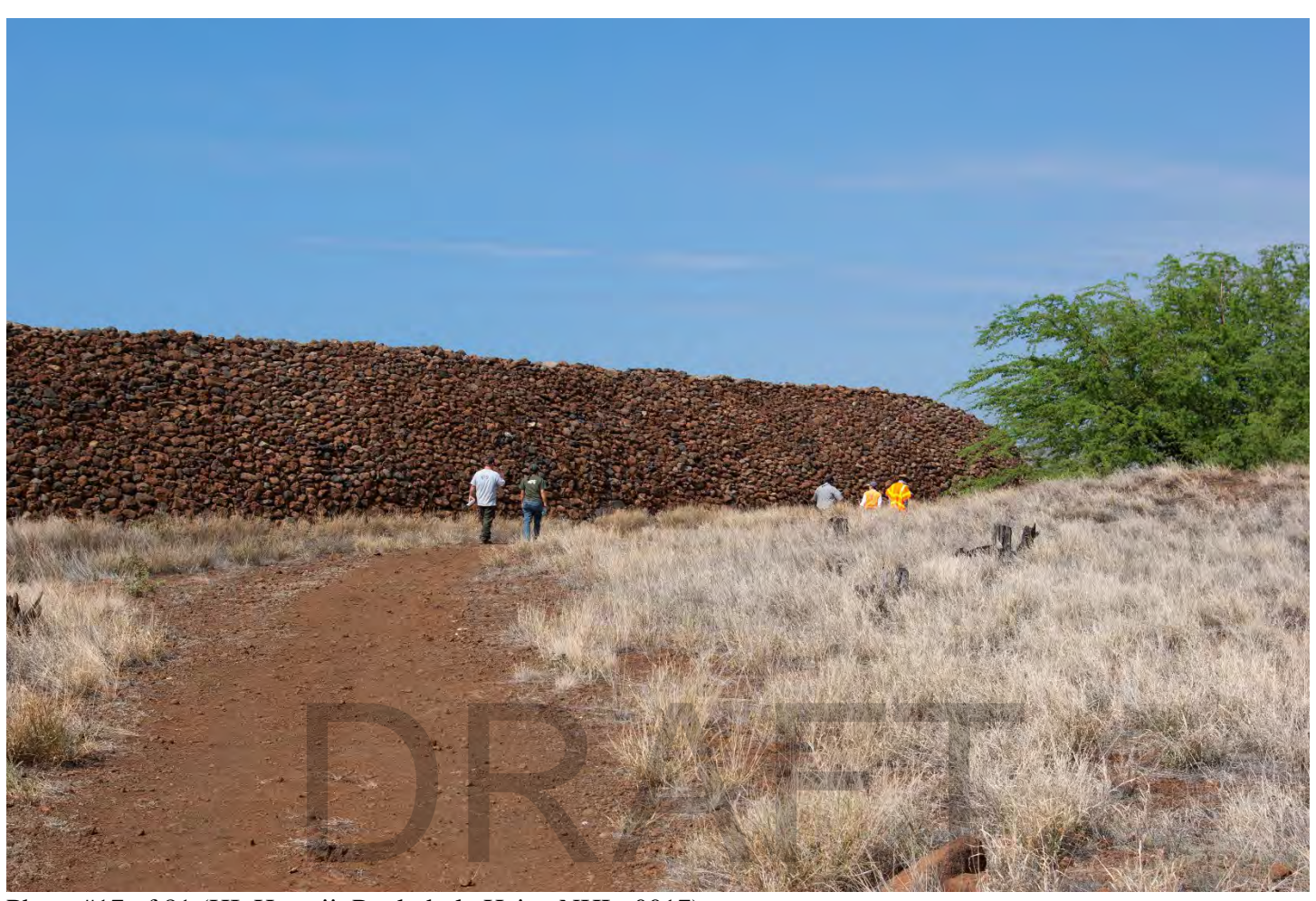
Photo #17 of 81 (HI_Hawaii_Puukohola Heiau NHL_0017) Pu'ukoholā Heiau, northeast wall. Camera facing northwest.