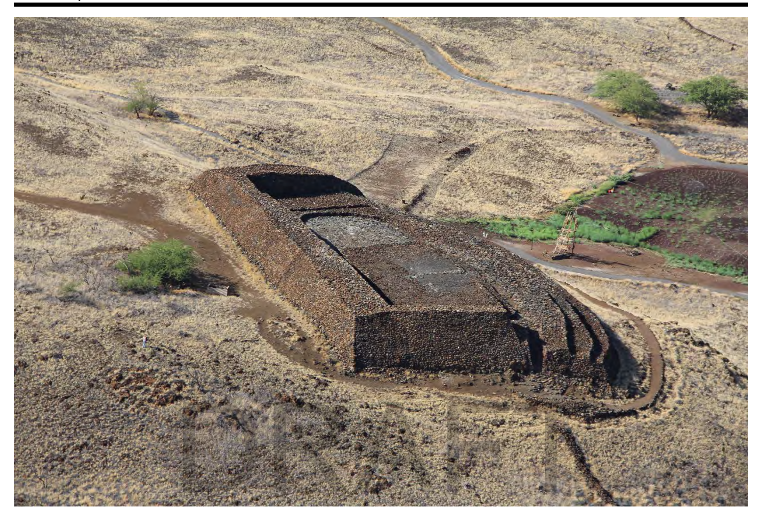
Photo #16 of 81 (HI_Hawaii_Puukohola Heiau NHL_0016) Pu'ukoholā Heiau, aerial photo, dated September 19, 2011, Camera facing southwest.