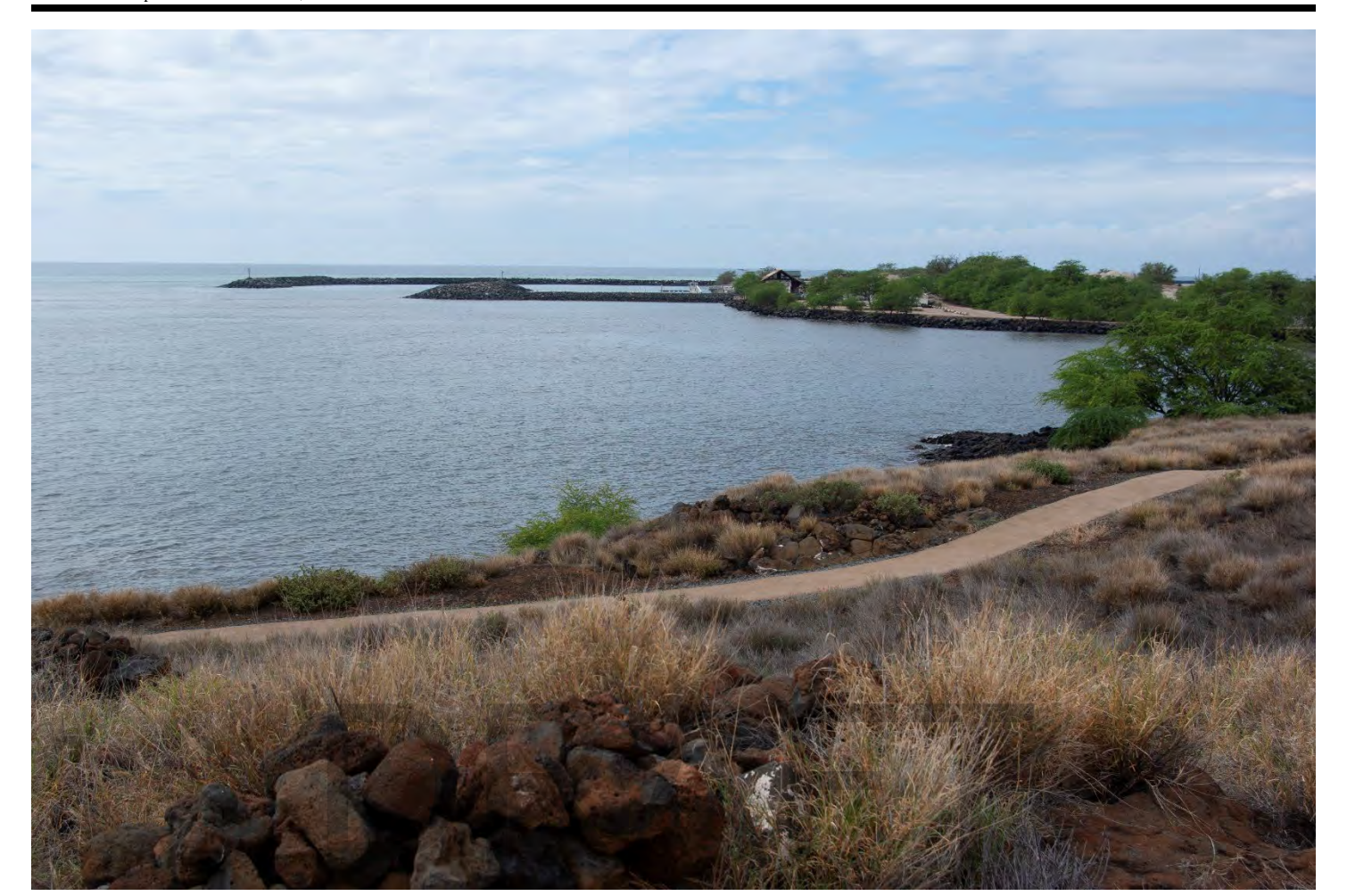
Photo #48 of 81 (HI_Hawaii_Puukohola Heiau NHL_0048) The Hele of Kenyni chennel outlet. A portion of the payed park

United States Department of the Interior, National Park Service