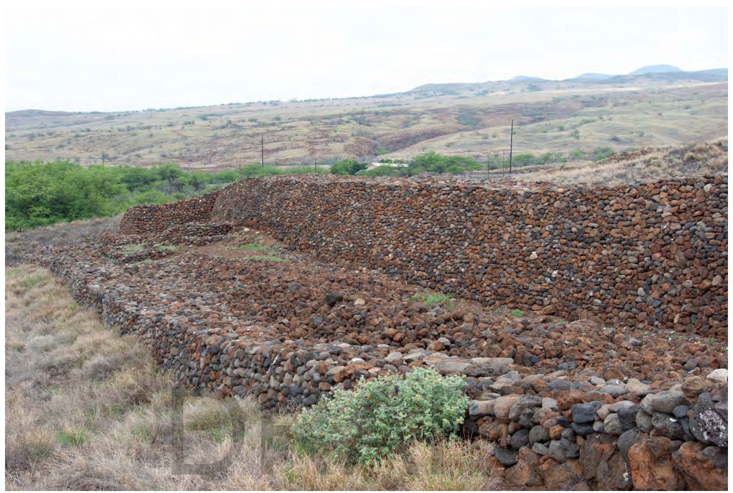
Photo #34 of 81 (HI_Hawaii_Puukohola Heiau NHL_0034) Mailekini Heiau. Camera facing northeast.