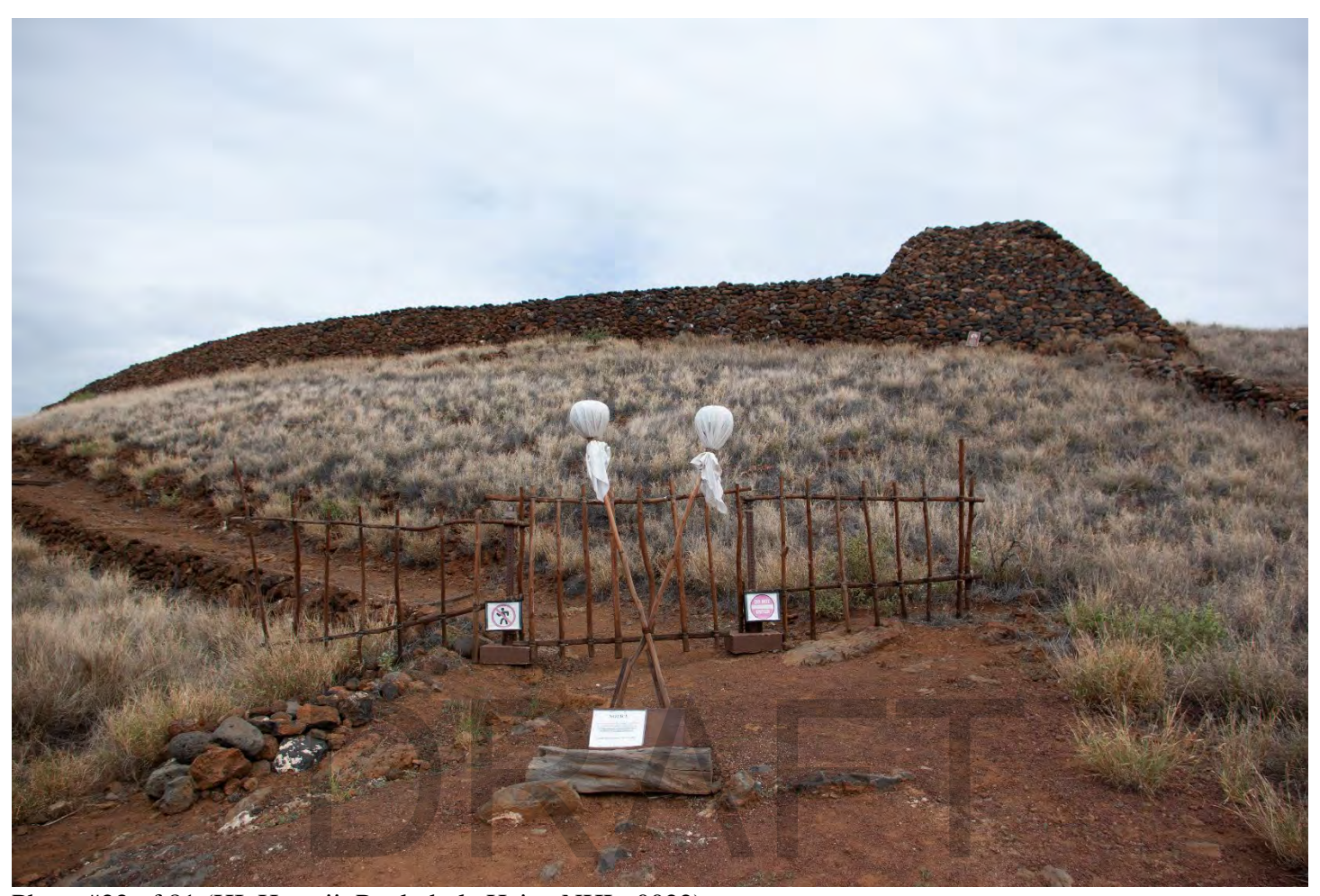
Photo #22 of 81 (HI_Hawaii_Puukohola Heiau NHL_0022) Pu'ukoholā Heiau. Pahu Kapu (two crossed staffs) and a post-and-rail fence bar access to the heiau trail. Camera facing east.