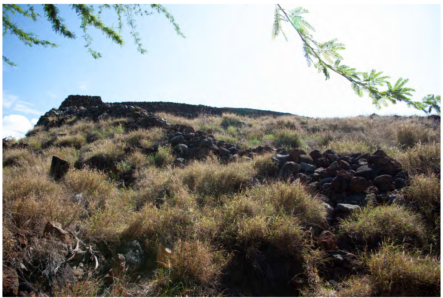
Photo #36 of 81 (HI_Hawaii_Puukohola Heiau NHL_0036) A low stone wall remnant extending from the northwest corner of Mailekini Heiau (partially visible at the top center of the photo) towards Pelekane to the west (not pictured). Camera facing east.