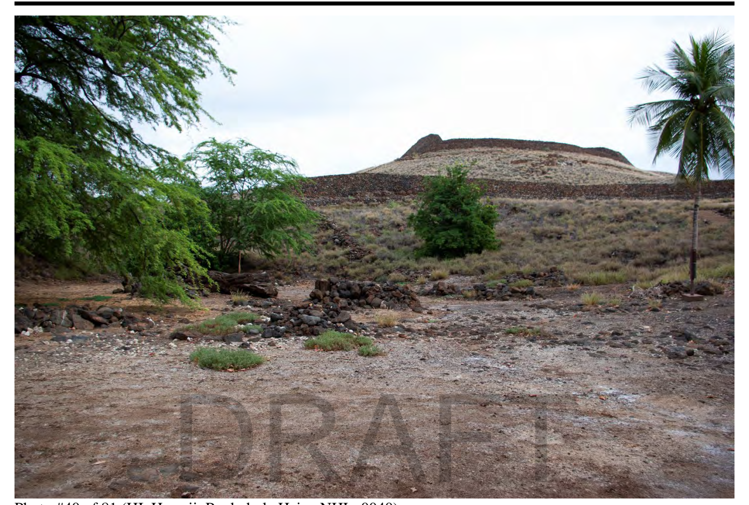
Photo #40 of 81 (HI_Hawaii_Puukohola Heiau NHL_0040) Pelekane. Pu'ukoholā and Mailekini Heiau are visible at the top right of the photo. Camera facing southeast.