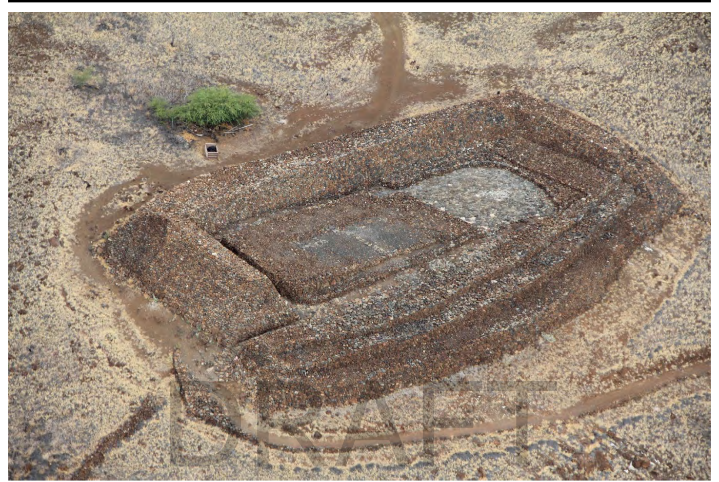
Photo #15 of 81 (HI_Hawaii_Puukohola Heiau NHL_0015) Pu'ukoholā Heiau, aerial photo, dated September 19, 2011, Camera facing southeast.