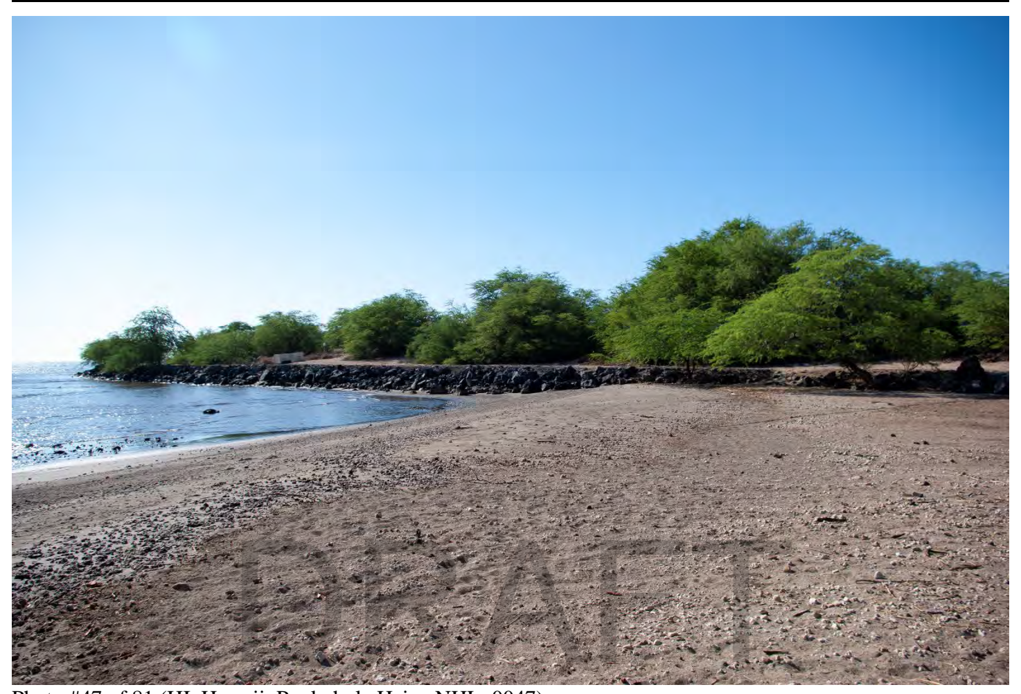
Photo #47 of 81 (HI_Hawaii_Puukohola Heiau NHL_0047) Pelekane beach (at the bottom right of the photo) and Hale-o-Kapuni channel. A modern stone retaining wall, visible at the center of the photo, runs alongside an access road to a small boat harbor northwest of the park. Camera facing west.