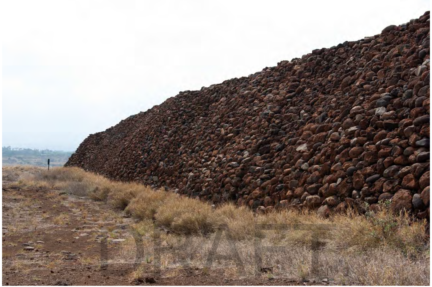
Photo #19 of 81 (HI_Hawaii_Puukohola Heiau NHL_0019) Pu'ukoholā Heiau, southeast wall. The bulges visible in the wall were created by seismic waves during the 2006 Hawai'i Island earthquakes. Camera facing southwest.