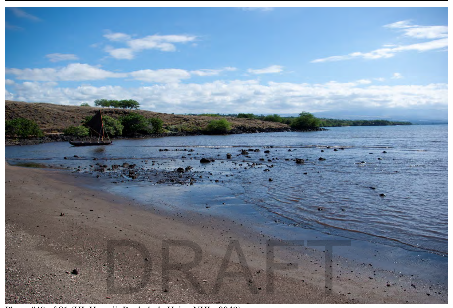
Photo #49 of 81 (HI_Hawaii_Puukohola Heiau NHL_0049) Hale-o-Kapuni channel, as seen from Pelekane beach (partially visible at the bottom left of the photo). The basalt cobbles visible just offshore may be from Hale-o-Kapuni Heiau Site. Camera facing south.