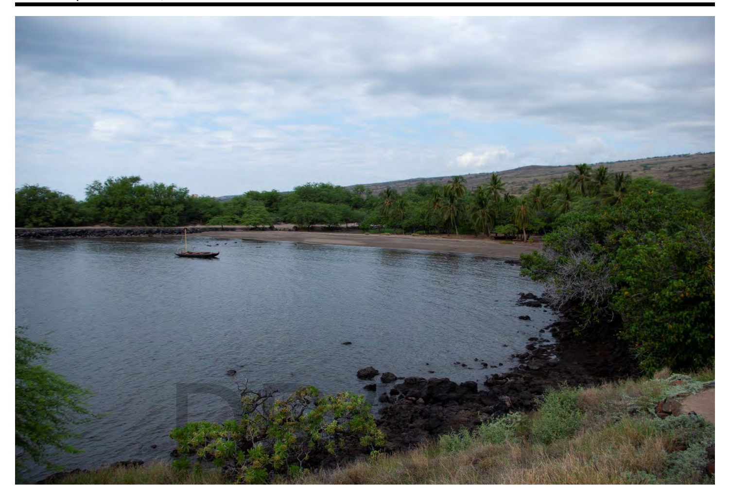
Photo #41 of 81 (HI_Hawaii_Puukohola Heiau NHL_0041) Pelekane beach (at the top center of the photo) and Hale-o-Kapuni channel. Camera facing north.