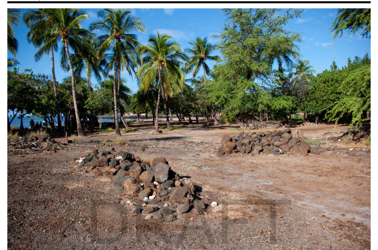
Photo #42 of 81 (HI_Hawaii_Puukohola Heiau NHL_0042) Pelekane. Hale-o-Kapuni channel is visible behind the trees at the left center of the photo. Camera facing west.