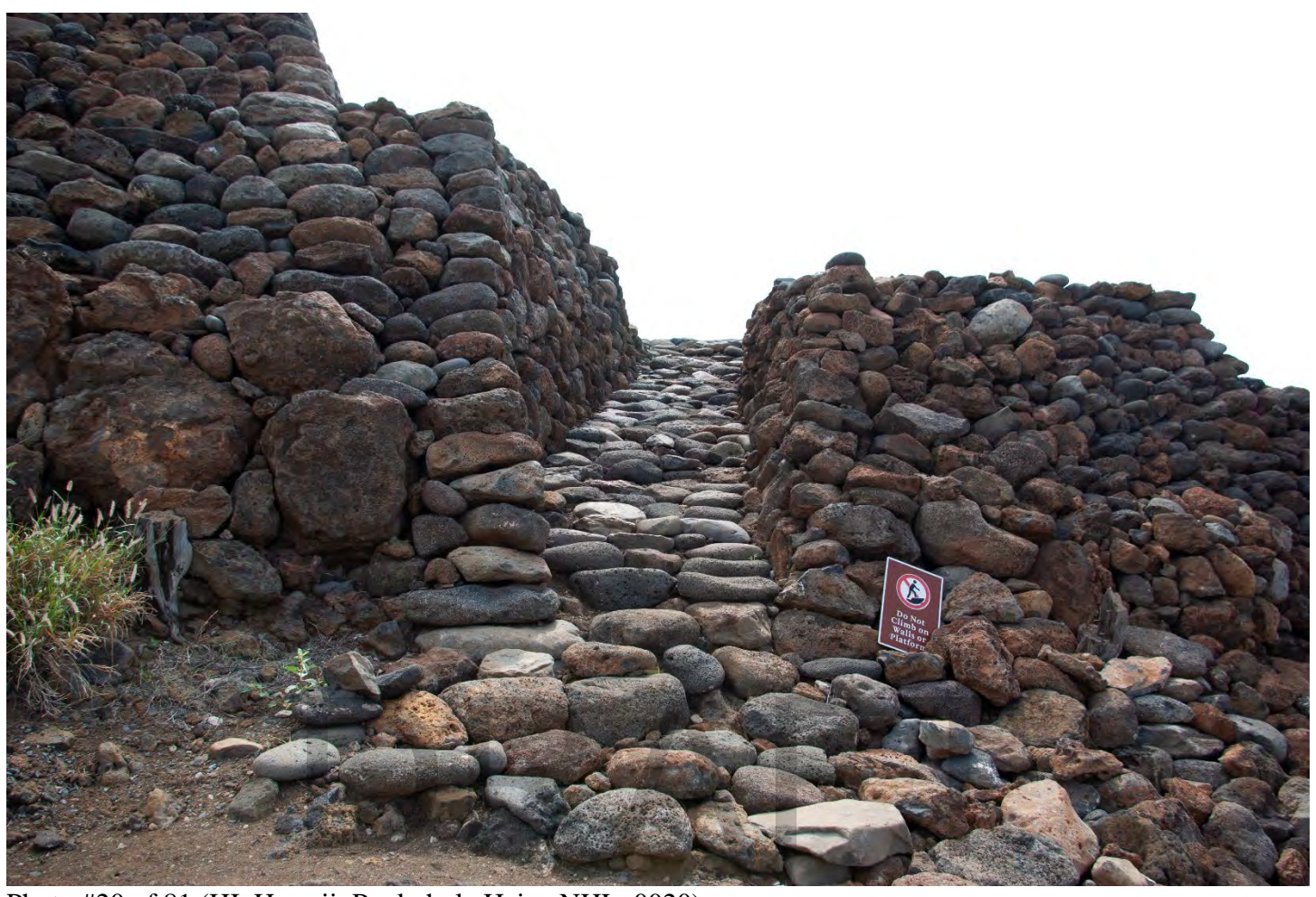
Photo #20 of 81 (HI_Hawaii_Puukohola Heiau NHL_0020) Pu'ukoholā Heiau, heiau entrance. Camera facing south.