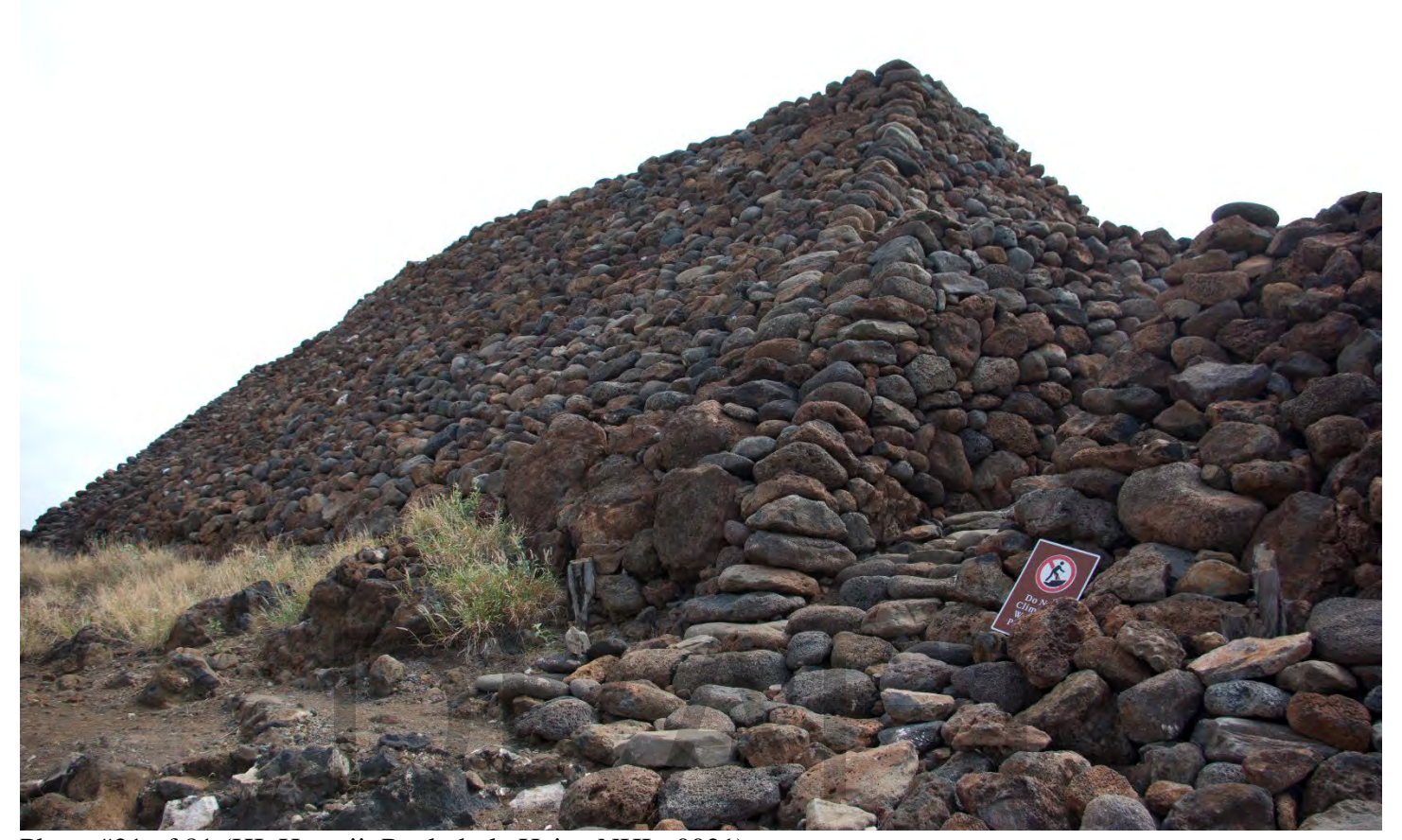
Photo #21 of 81 (HI_Hawaii_Puukohola Heiau NHL_0021) Pu'ukoholā Heiau, north wall and heiau entrance. Camera facing southeast.