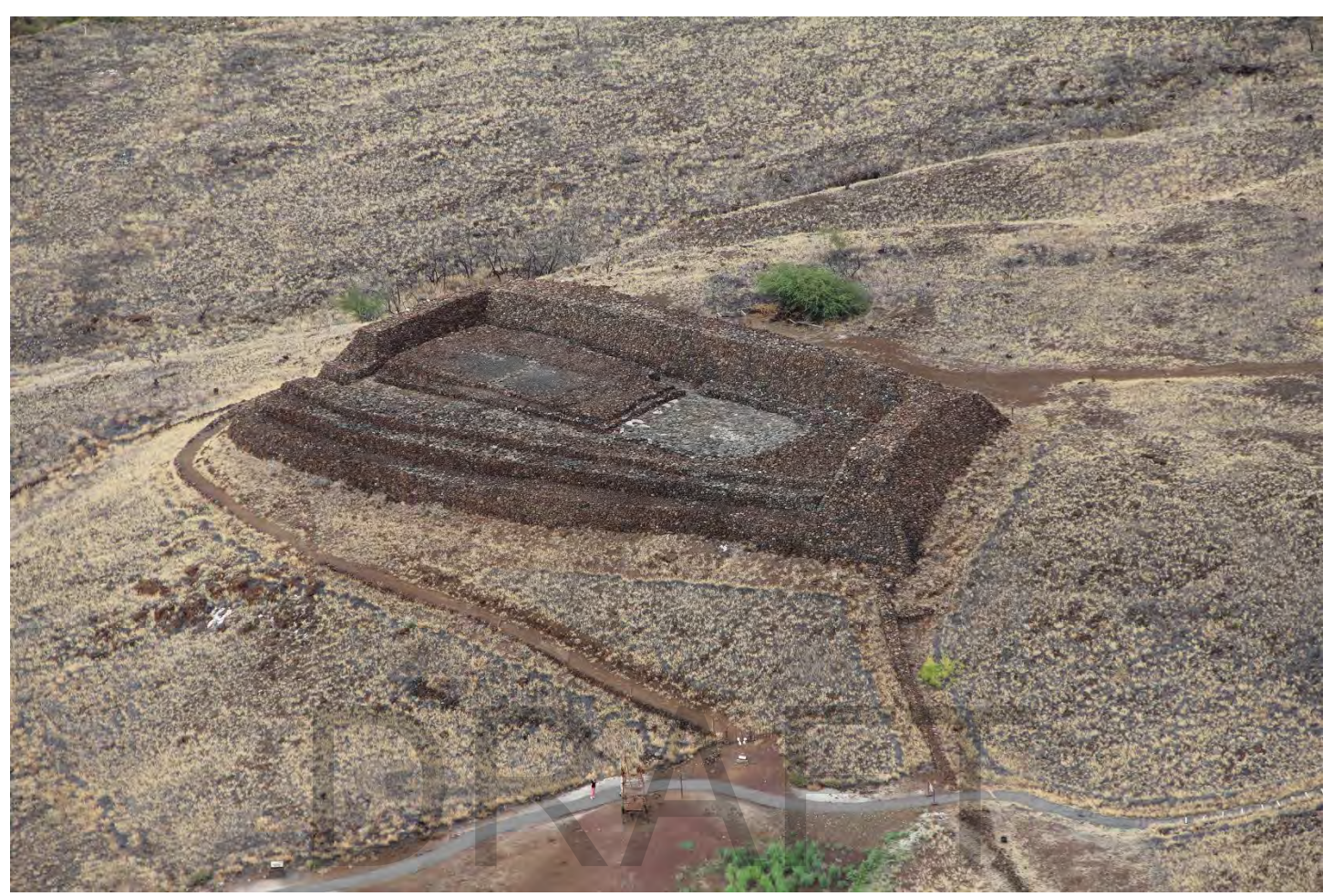
Photo #14 of 81 (HI_Hawaii_Puukohola Heiau NHL_0014) Pu'ukoholā Heiau, aerial photo, dated September 19, 2011, Camera facing northeast.