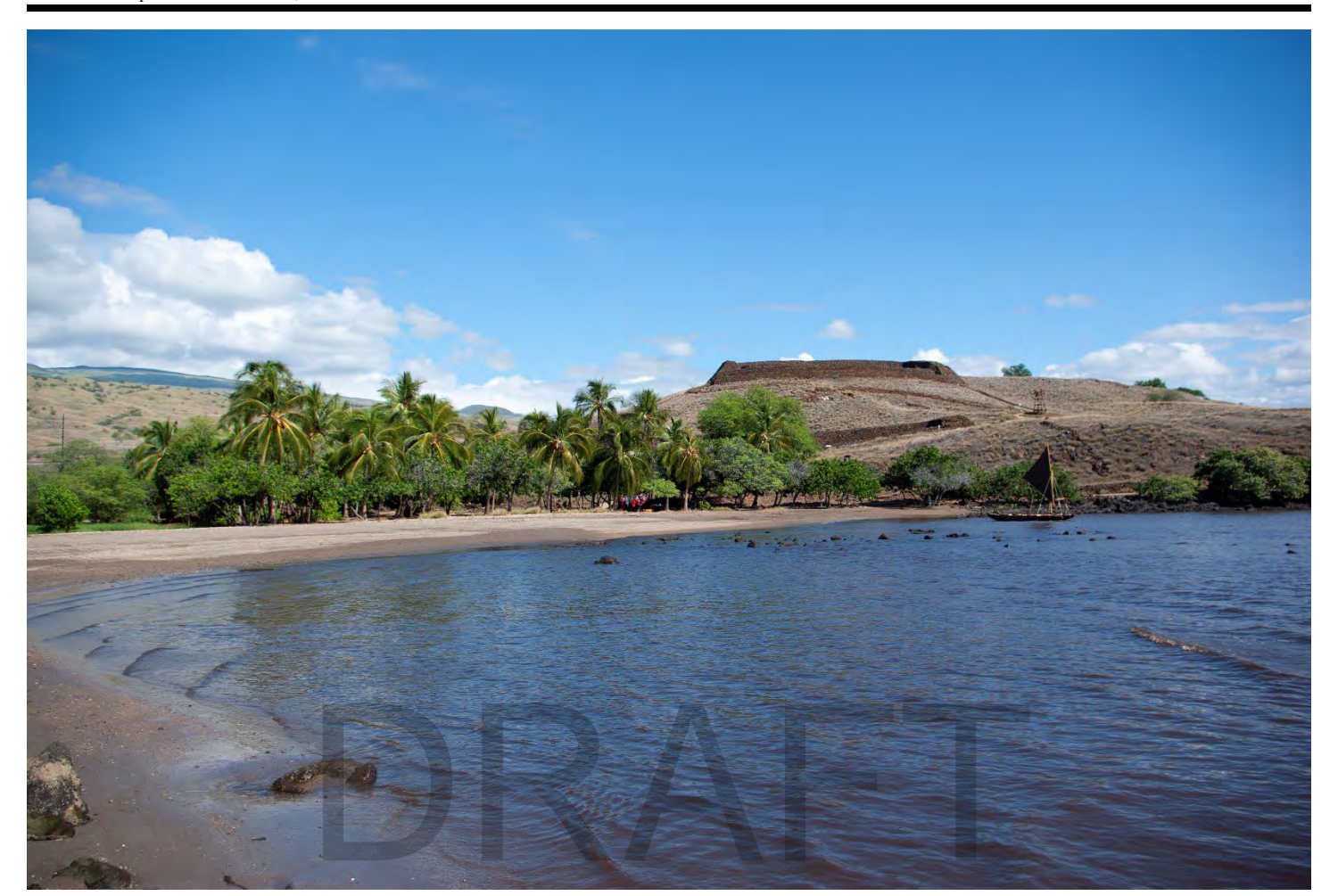
Photo #46 of 81 (HI_Hawaii_Puukohola Heiau NHL_0046) Pelekane beach (at the left center of the photo) and Hale-o-Kapuni channel. Pu'ukoholā Heiau and Mailekini Heiau are visible at the right center of the photo. Camera facing east.