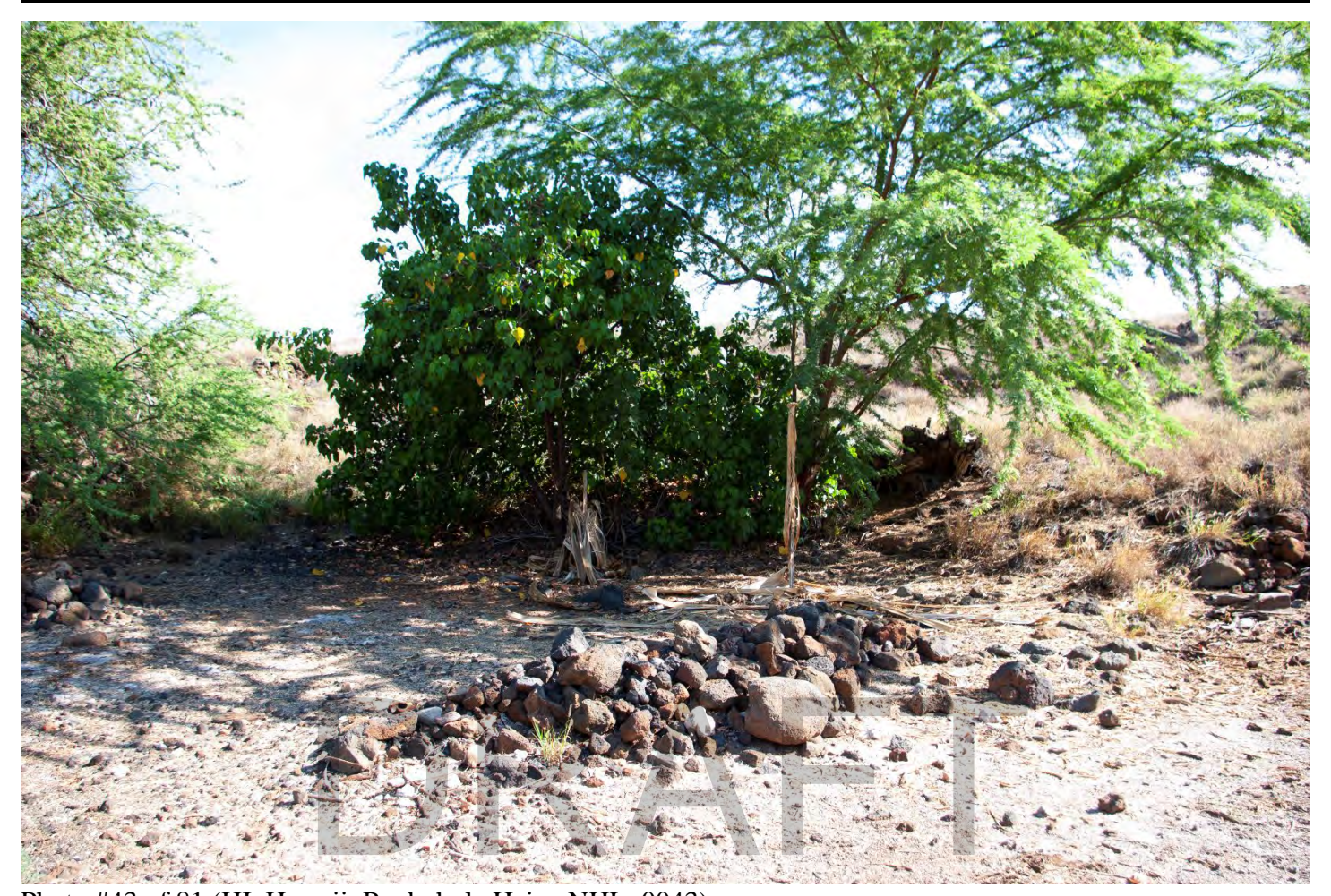
Photo #43 of 81 (HI_Hawaii_Puukohola Heiau NHL_0043) Pelekane. The two banana plant pseudostems at the center of the photo were used as spear-throwing targets during a recent (ca. 2014) cultural festival. Camera facing east.