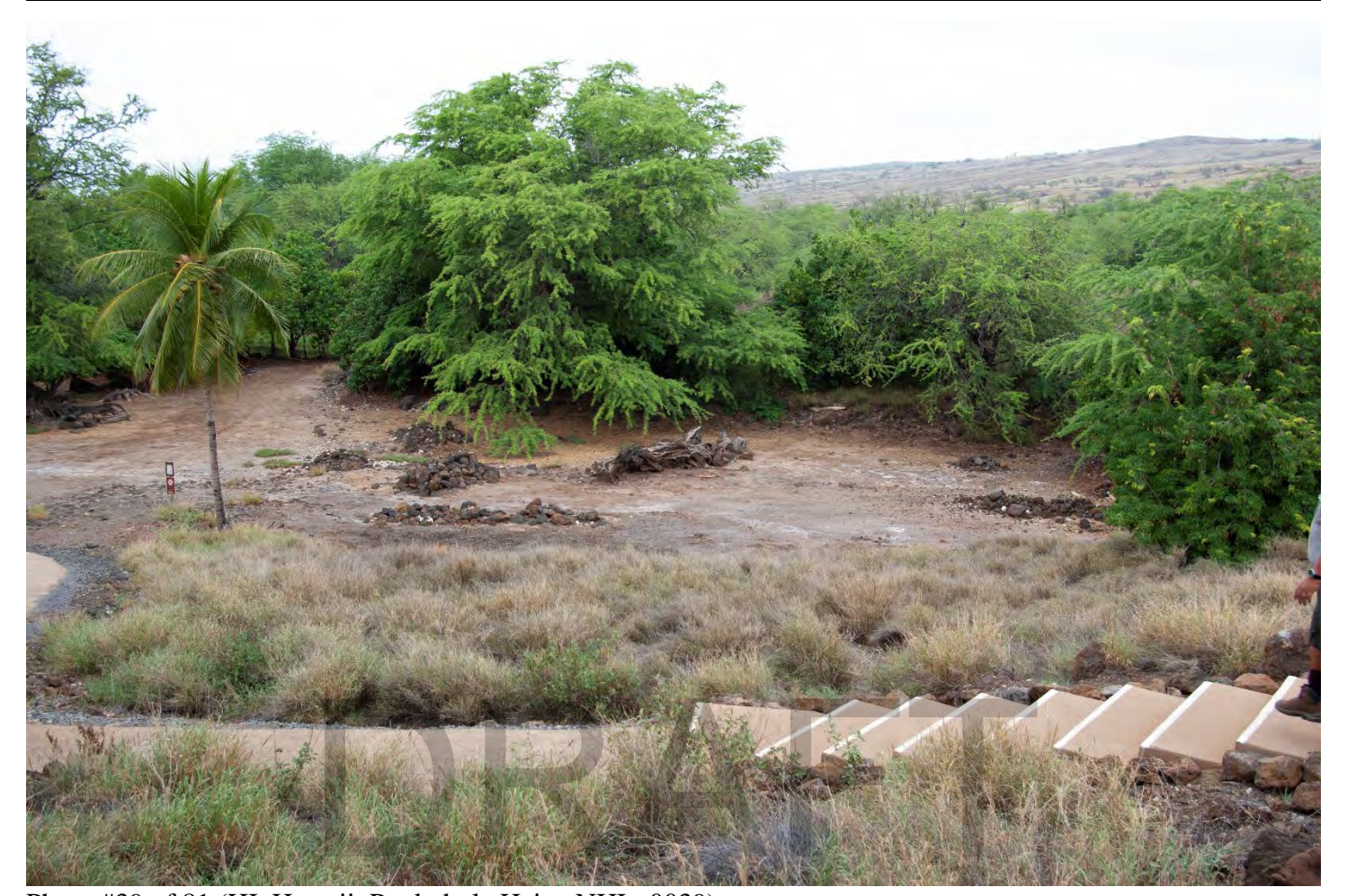
Photo #39 of 81 (HI_Hawaii_Puukohola Heiau NHL_0039) Pelekane. A portion of the paved park trail is visible at the bottom of the photo. Camera facing north.