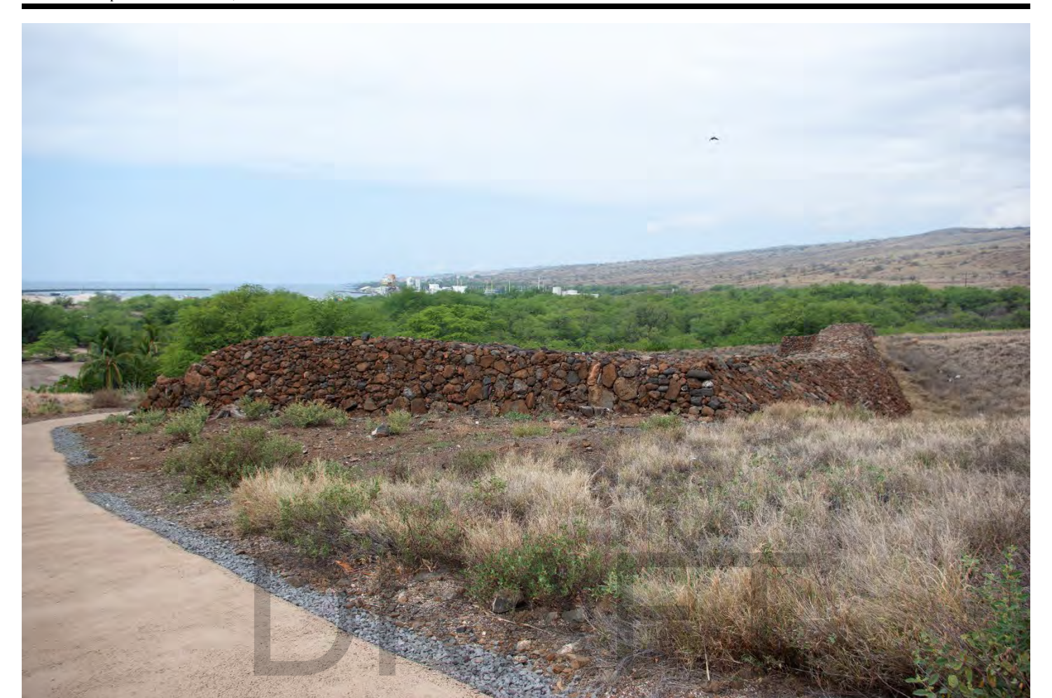
Photo #32 of 81 (HI_Hawaii_Puukohola Heiau NHL_0032) Mailekini Heiau, south wall. The paved park trail is visible at the bottom left of the photo. Camera facing north.