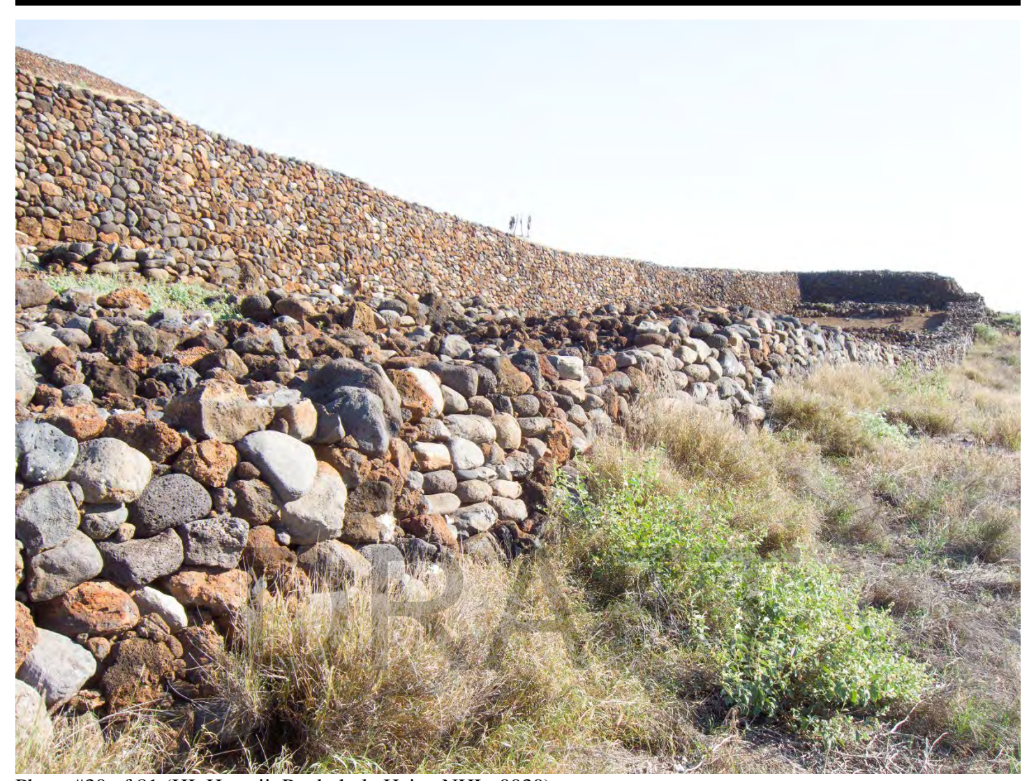
Photo #30 of 81 (HI_Hawaii_Puukohola Heiau NHL_0030) Mailekini Heiau. Pu'ukoholā Heiau is barely visible at the top left of the photo. Camera facing south.