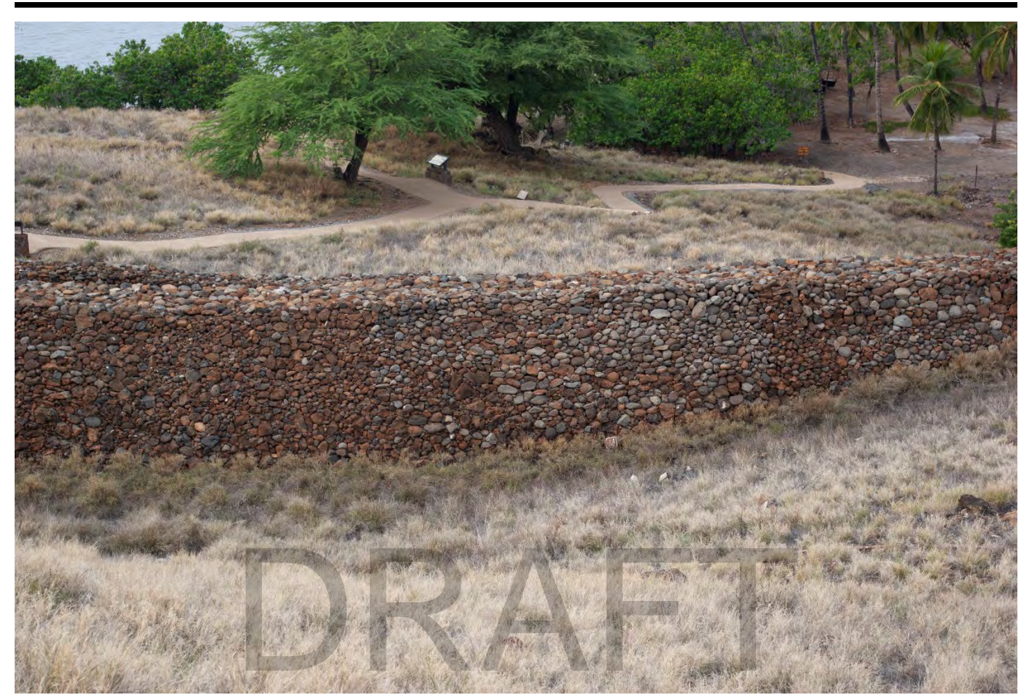
Photo #31 of 81 (HI_Hawaii_Puukohola Heiau NHL_0031) Mailekini Heiau, east wall, as viewed from Pu'ukoholā Heiau. Camera facing west.