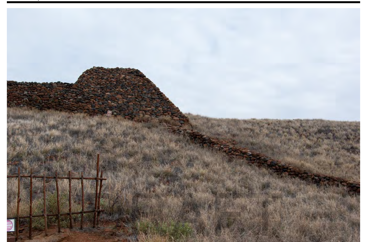
Photo #23 of 81 (HI_Hawaii_Puukohola Heiau NHL_0023) Pu'ukoholā Heiau, southwest corner. A low stone wall extends from the corner of the heiau towards the southwest. A post-and-rail fence at the heiau trail entrance is partially visible at the bottom left of the photo. Camera facing east.