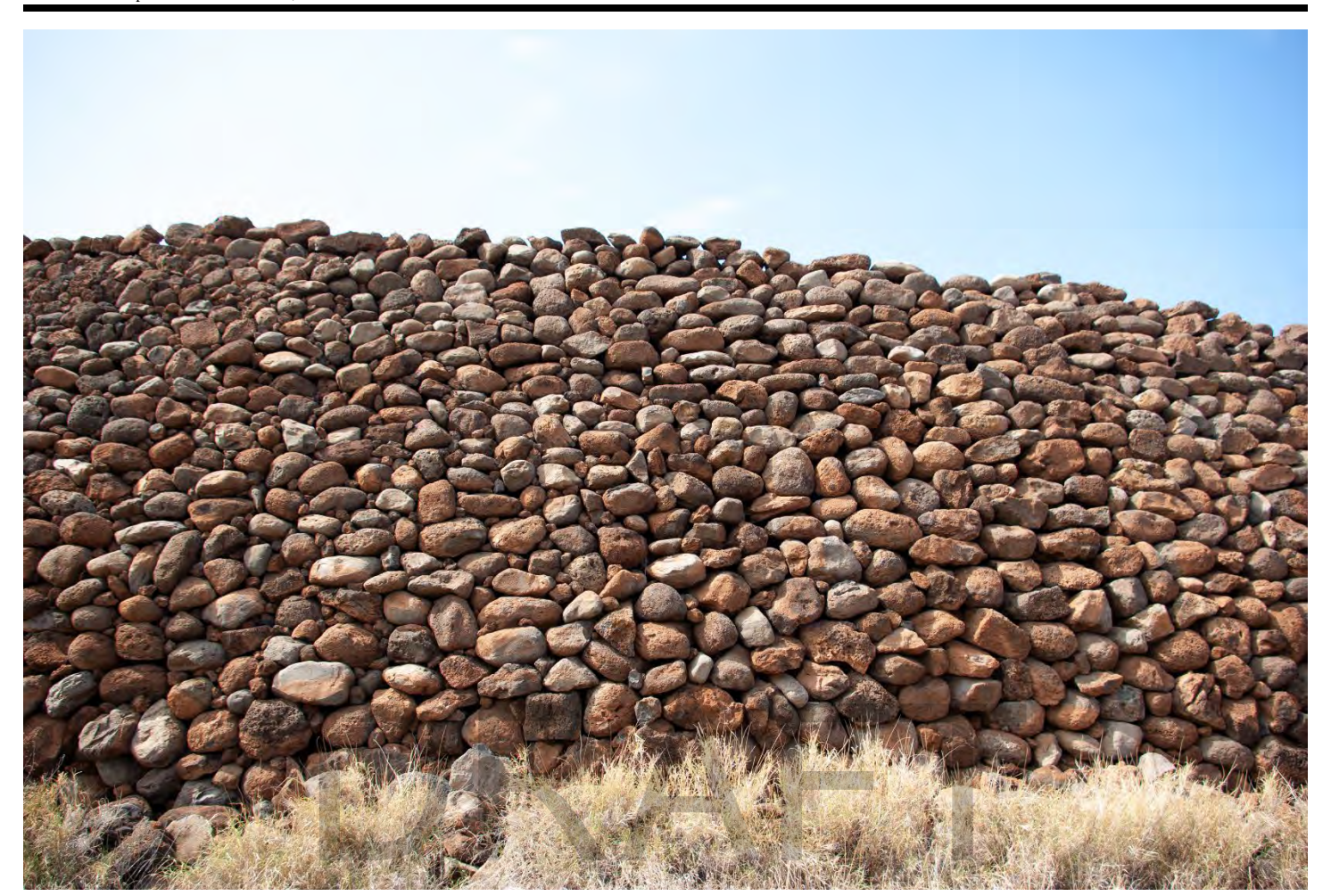
Photo #18 of 81 (HI_Hawaii_Puukohola Heiau NHL_0018) Pu'ukoholā Heiau, east wall. Camera facing west.