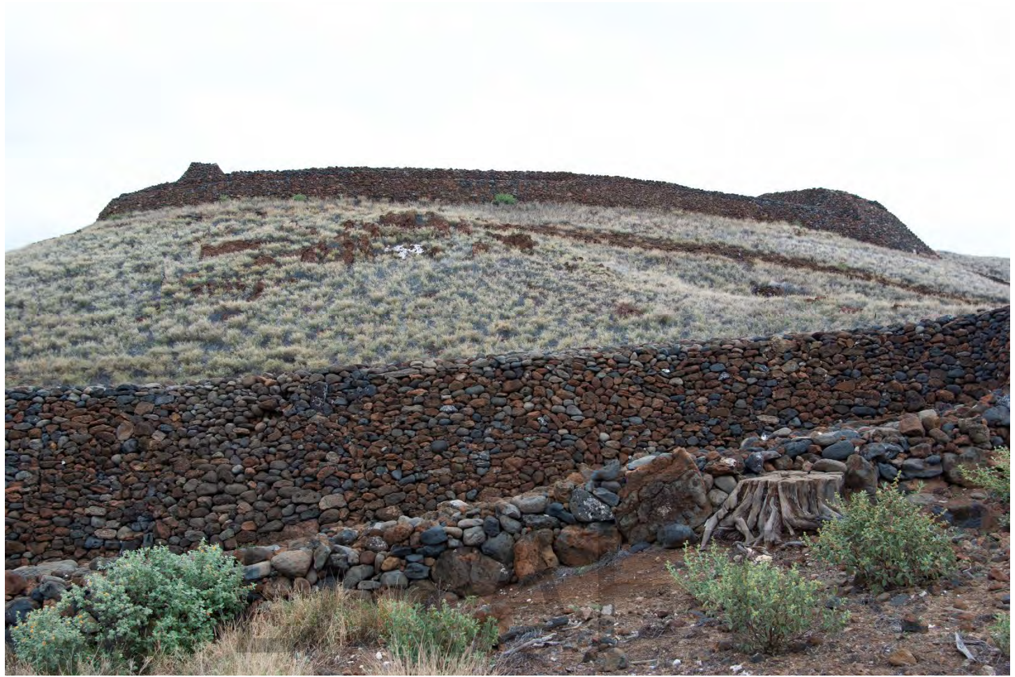
Photo #35 of 81 (HI_Hawaii_Puukohola Heiau NHL_0035) Mailekini Heiau, partially visible at the bottom of the photo, and Pu'ukoholā Heiau, visible at the top center of the photo. Camera facing east.