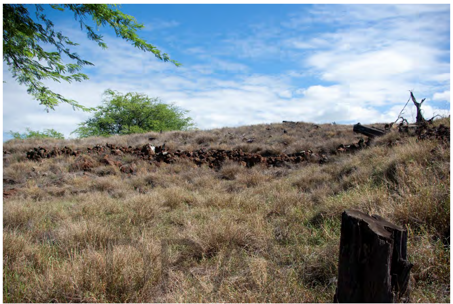
Photo #37 of 81 (HI_Hawaii_Puukohola Heiau NHL_0037) A portion of a low stone wall extending from the northwest corner of Mailekini Heiau (not pictured) towards the northwest. Camera facing northeast.