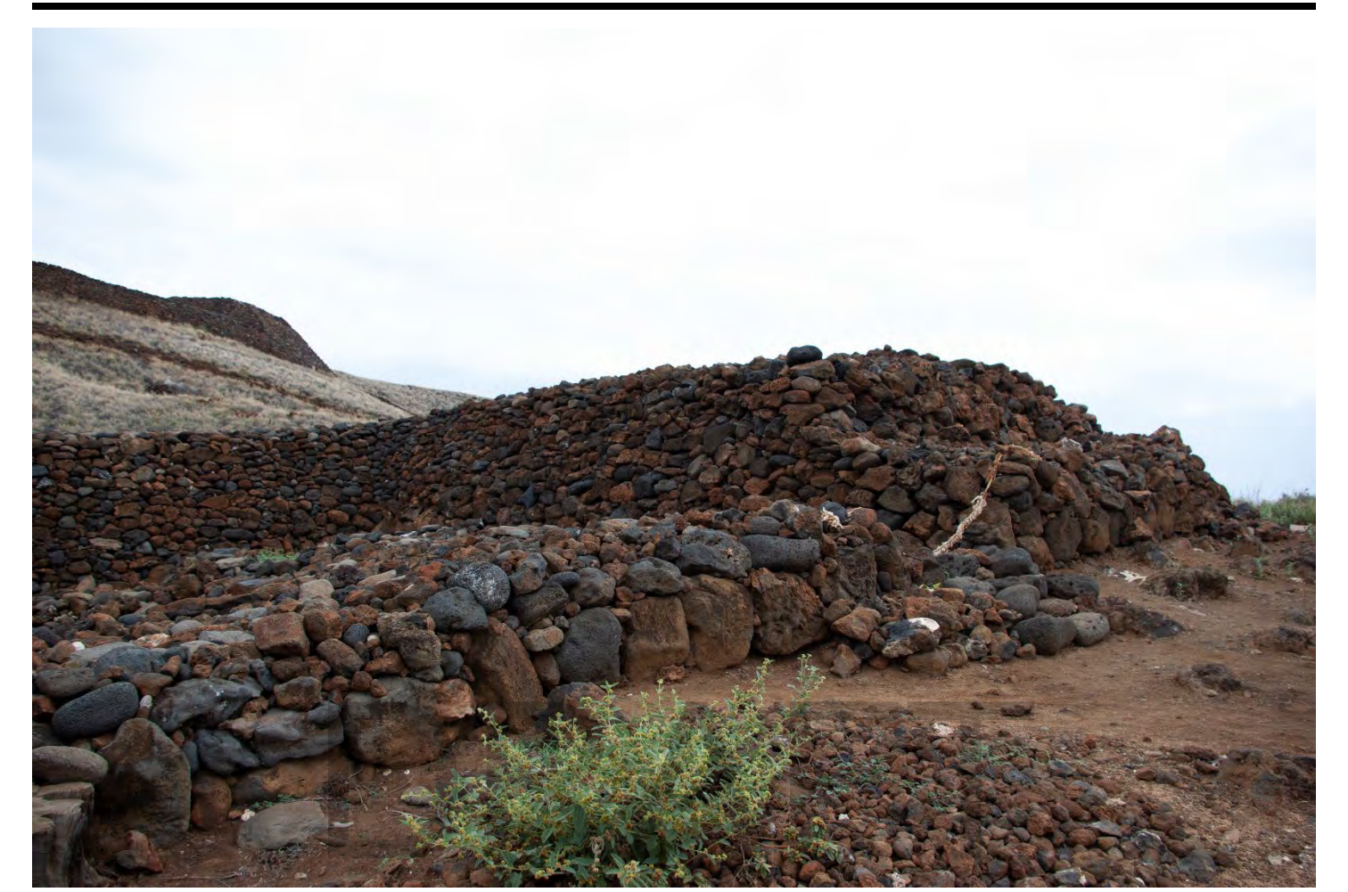
Photo #33 of 81 (HI_Hawaii_Puukohola Heiau NHL_0033) Mailekini Heiau, south end. Pu'ukoholā Heiau is partially visible at the top left of the photo. Camera facing southeast.