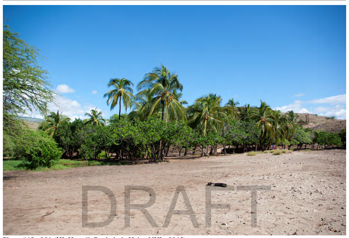
Photo #45 of 81 (HI_Hawaii_Puukohola Heiau NHL_0045) Pelekane beach. Camera facing southeast.