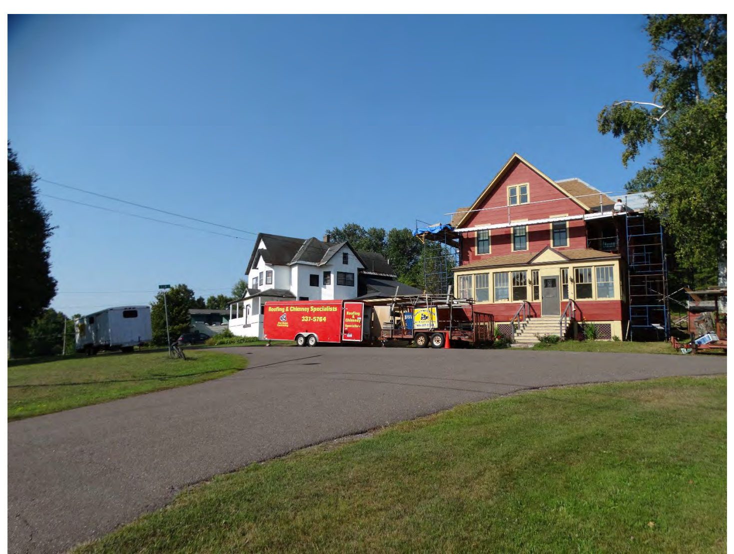
Tamarack Housing Location Landscape Character Area H. Manager housing (left to right: Map ID# 586 and 587) on right side of 2<sup>nd</sup> Street.

Calumet Historic District Village of Calumet Houghton County, MI View to the southwest along Elm Street at the 1<sup>st</sup> Street intersection. Photo by Quinn Evans Architects, August 2018 TIFF images on file with NPS in Washington, DC