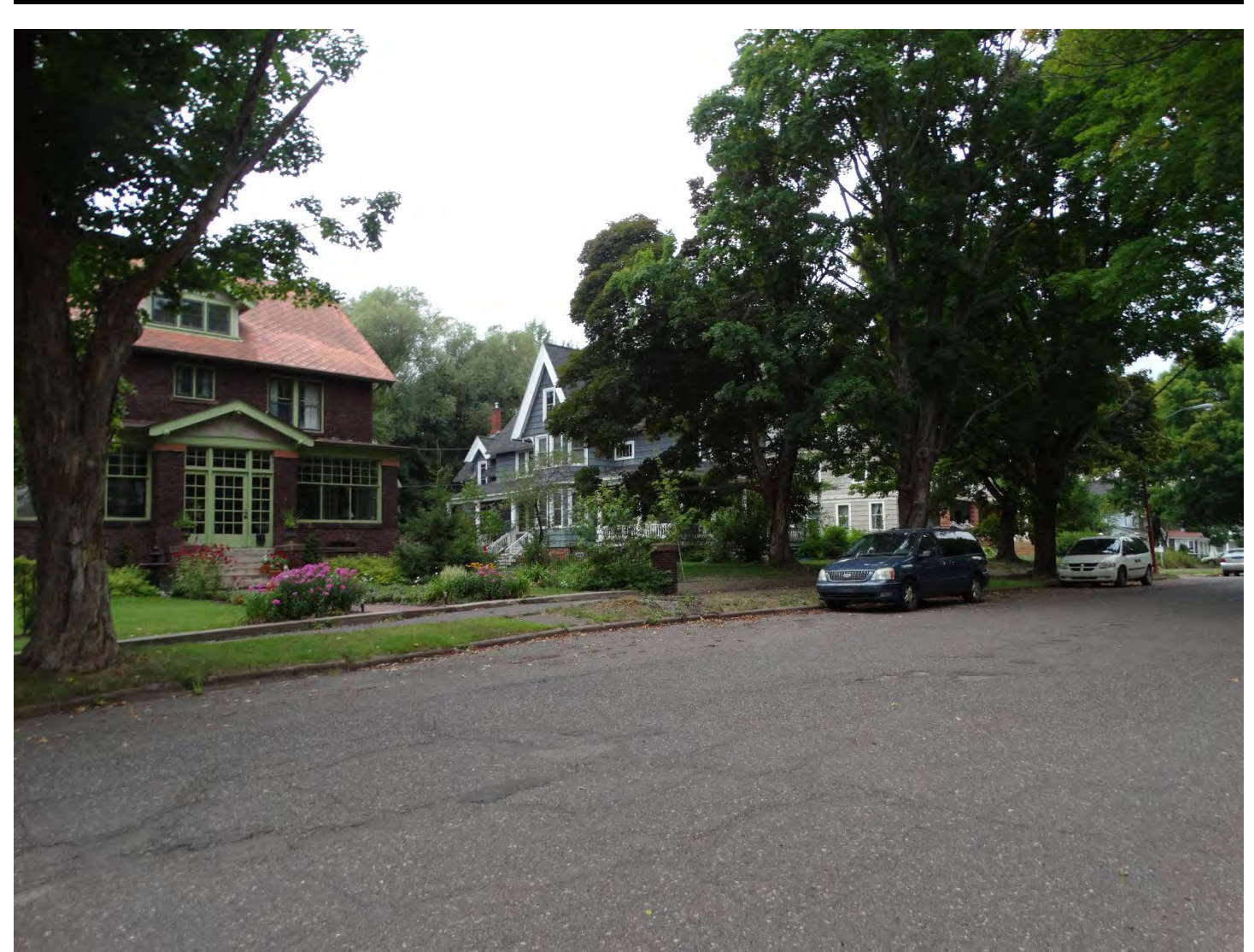
Village of Calumet Housing Location Landscape Character Area F. Upper middle-class residences (left to right: Map ID#s 312 and 314) on the left side of Eighth Street.

Calumet Historic District Village of Calumet Houghton County, MI View to the northwest along Eight Street between Elm and Pine Streets. Photo by Quinn Evans Architects, August 2018 TIFF images on file with NPS in Washington, DC