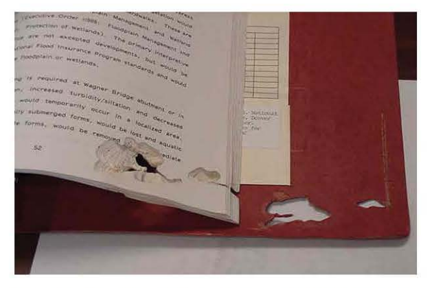
Figure 9. Possible termite or drugstore beetle damage to book.

store beetle. Look for emergence holes and fine dust around target items to detect cigarette or drugstore beetle activity. Drugstore beetles can be detected by their feeding damage and sometimes leave shot holes (Fig. 9). The adults of both may be seen flying.