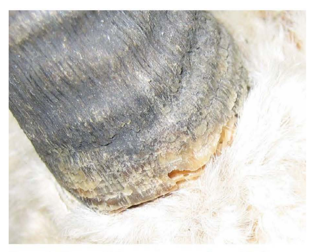
Figure 1. Dermestid larvae damage to horn.