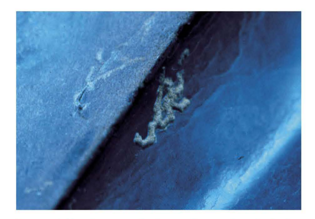
Figure 4. Leather cartridge box with tunneling by hide beetle.

The three hide beetles that cause the most damage are the larder beetle, hide or leather beetle, and black larder beetle. They feed on skins and feathers such as dead bird or mouse carcasses in attics, stuffed animals in museum collections and in birds' nests. Both the adult and larval stage damages materials. Look for feeding damage and frass created (Fig. 4) as they often burrow into or graze the surface of their food source.