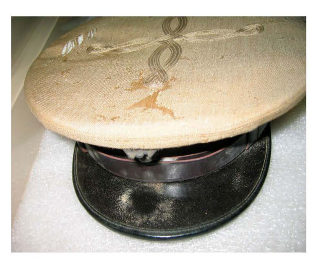
Figure 3. Grazing damage and frass from varied carpet beetle larvae.

The four most commonly encountered species of carpet beetles are the black carpet beetle, varied carpet beetle, furniture carpet beetle, and common carpet beetle. The larval stage of all carpet beetles is responsible for the damage. A carpet beetle infestation results in feeding damage (Fig. 3) and cast larval skins.