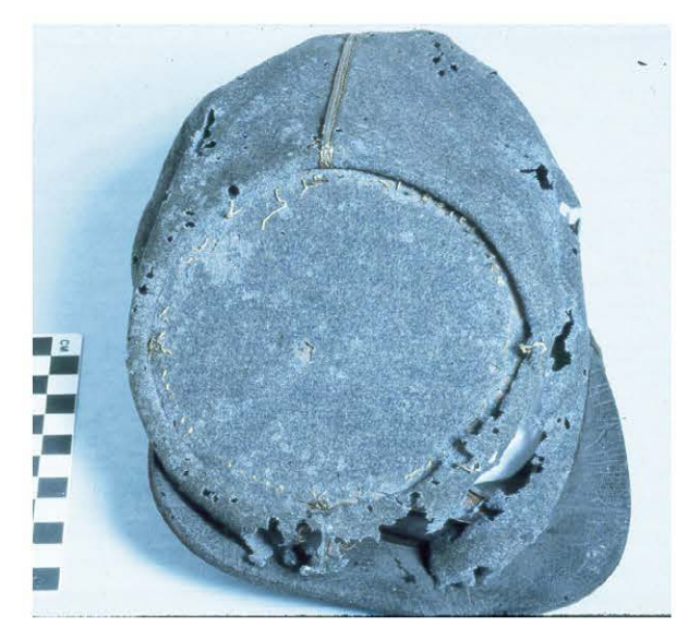
Figure 5. Civil War hat with damage from clothes moths and carpet beetles. (Barbara Cumberland, NPS)

While many other moths are attracted to lights, these moths prefer dark closets, attics or other areas. The larvae tend to live and feed in dark corners in the folds of fabrics. Typically, the larva bites off a fiber, chews on it and moves on to the next fiber, resulting in a trail of damaged fibers. The clothes moth larvae may spin a feeding tube made of the fabric they are feeding on. Some spin small scattered silken patches and graze as they go along using the tube as protection. Look for feeding damage such as holes in woolen fabrics and hair falling from hides or pelts (Fig. 6). The color of the excreta usually takes on the color of the material on which it is feeding. Use these clues to locate infested collections.