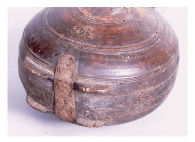
Figure 7. Canteen damaged by powderpost beetles.

Museum objects made of wood are susceptible to attack by a number of wood-infesting pests. In museums, the culprits are usually wood-boring/powderpost beetles and drywood termites. Both can severely damage valuable artifacts while remaining invisible to the untrained eye.