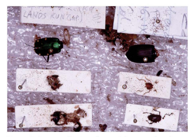
Figure 2. Insect collection damaged by carpet beetles