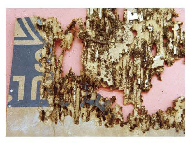
Figure 10. Silverfish damage.

Silverfish and firebrats prefer starchy foods and will eat fabrics, paper and sizing, and the glue and paste in older book bindings. They are omnivorous and will eat protein materials as well as cellulose (Fig. 10). Silverfish prefer moist situations with temperatures of 70° to 80°F and can be an indicator of moisture problems. Firebrats prefer temperatures in excess of 90°F. Signs of an infestation are seeing the insect or finding their feeding damage.