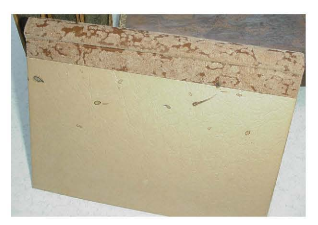
Figure 11. Cockroach damage to a book.

The oriental cockroach prefers decaying food, is cold tolerant and prefers damp areas with temperatures below 84°F. It is often found in bark mulch around the perimeter of buildings. The American cockroach requires a water source and prefers fermented foods. It can be found in sewers and basements, particularly around drains and pipes. Cockroach fecal pellets can resemble small mouse droppings without pointed ends.