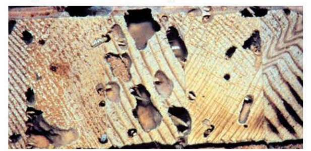
Figure 8. Drywood termite damage to a wooden door.

Unlike their cousins the subterranean termites that require a constant moisture source, drywood termites establish colonies in dry, sound wood with low levels of moisture and do not require contact with the soil. Drywood termites attack wooden items of all kinds. Most infestations are in building structures but furniture and wooden objects in museum collections may also be attacked. The excavated galleries or tunnels feel sandpaper-smooth. Dry and loose, their distinct six-sided fecal pellets are found in piles where they have been kicked out of the chambers. Other than the pellets, there is very little external evidence of drywood termite attack in wood as they tend to work just under the surface of the wood (Fig. 8). Swarming adults may also be a sign of an infestation. Winged termites have four wings of equal length whereas carpenter ants have four wings of two different lengths.