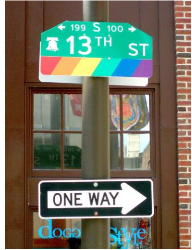
Figure 6: Street sign in Philadelphia's Gayborhood. 24

A property's period of significance refers to the span of time during which significant events and activities occurred. Most properties have a clearly definable period of significance, which can range from a single day to many years. The period of significance for the Dr. Franklin E. Kameny Residence is 1962 to 1975, when Dr. Kameny was living in the house and active in significant historical events. The period of significance for