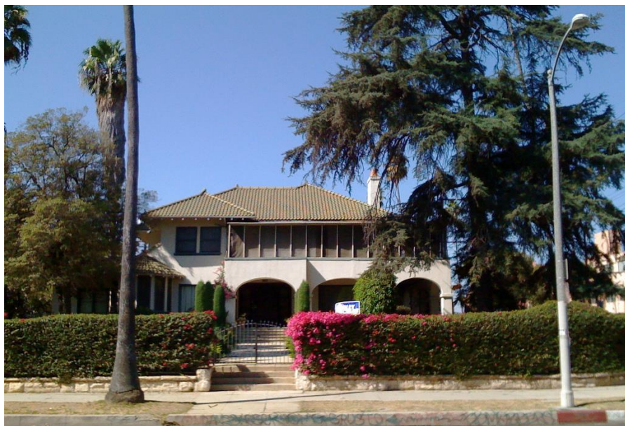
Figure 1: The Hattie McDaniel House, Los Angeles, California. Photo by Waltarrrrr, 2008. 7

broad range of themes in American history, including American Latinos, Japanese Americans in World War II, and Cold War defensive sites. 8 Consulting with other, associated theme studies may be helpful if you are looking to nominate places with intersectional histories like the Hattie McDaniel House in Los Angeles (Figure 1), 9 Fort Okanogan in Washington, 10 or the Topaz War Relocation Center in Utah. 11 Mention of