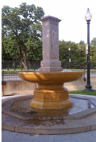
Figure 4: The Butt-Millet Memorial Fountain , President's Park, Washington, DC. Butt and Millet, who lived together and may have been romantically involved, perished when the Titanic sank in April 1912. 20

Sites are the locations of significant events, prehistoric or historic occupation or activity, or a place where the location itself possesses historic, cultural, or archeological value. For example, they include archeological sites, battlefields, and landscapes like gardens and