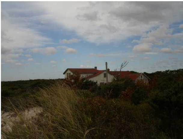
Figure 7: Carrington House, Cherry Grove, New York.

Several of the places listed on the NRHP and designated as NHLs for their association with LGBTQ history have invoked Criteria Consideration G/Criteria Exception 8 because they achieved their significance within the past fifty years. For example, Stonewall is designated an NHL under Criterion 1 and Criteria Exception 8 . The significant events at the Stonewall Inn took place less than fifty years before its designation. However, the historical significance of the events is important enough to