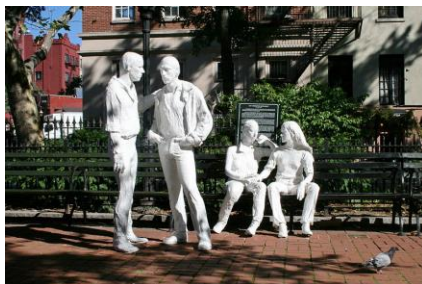
Figure 3: Gay Liberation (1980) by artist George Segal is located in Christopher Park, part of the Stonewall National Monument. It is the first piece of public art dedicated to LGBTQ rights. Photo by Raphael Isla, 2013. 18