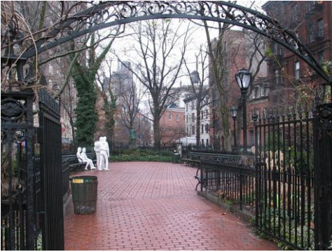
Figure 2: Christopher Park, the location of protests following the Stonewall Riots, New York City. 16

listed on the NRHP is the Dr. Franklin E. Kameny Residence in Washington, DC. 14 A building associated primarily with LGBTQ history designated an NHL is the Henry Gerber House in the Old Town Triangle neighborhood of Chicago, Illinois. 15