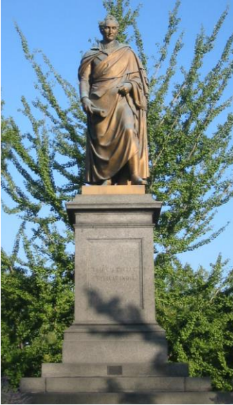
Figure 5: Statue of Thomas Hart Benton by sculptor Harriet Hosmer. Located in Lafayette Park, St. Louis, Missouri, the statue was commissioned in 1860 and completed in 1862. Photo by Whitebox, 2007. 21

eligible under Criteria Consideration F/Criteria Exception 7 if design, age, tradition, or symbolic value has imparted it with its own national significance. If the resource is part of a historic district it does not need to meet this exception. There are currently no NRHP or NHL objects designated specifically for their association with LGBTQ heritage. Examples of objects that are associated with LGBTQ history include Gay Liberation in New York City, New York; the Butt-Millet Memorial Fountain in Washington, DC; and the statue of Thomas Hart Benton in St. Louis, Missouri (Figures 3 to 5). 22