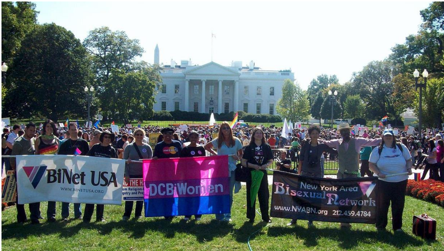
Figure 1: Some of the bisexual contingents at the 2009 National Equality March, Washington, DC. 9

says Oregon Governor Kate Brown, the country's first out bisexual governor, speaking openly about how hard it is being a public bisexual role model, in government or anywhere. 8 Hundreds of these stories wait to be uncovered or have been uncovered and then covered up again. An organized US bisexual rights and liberation movement keeps bringing stories like these to light, insisting on the importance of bisexual role models for everyone (Figure 1).