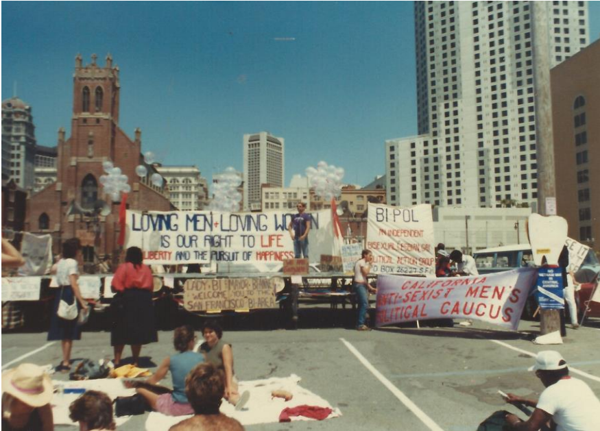
Figure 3: The first Bisexual Rights Rally in the United States at 730 Howard Street, San Francisco, California. Explicitly excluded from the lesbian and gay protests at the 1984 Democratic Party Convention held across the street at the Moscone Center, bisexual activists Alan Rockway, Lani Ka'ahumanu, and others in BiPOL arranged their own protest.

Bisexuals are resilient, surviving in a world that repeatedly erases and elides their existence. They resist erasure over and over again. Left out of the names of organizations and marches, excluded from studies and efforts purporting to represent all same-sex loving people, they persist, and continue to assert who they are.