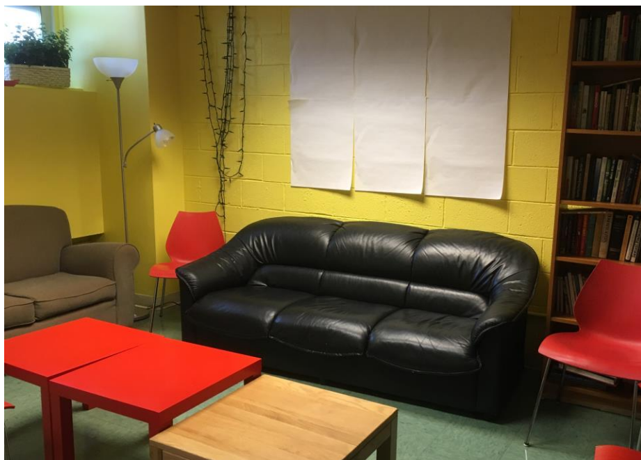
Figure 4: The Columbia Queer Alliance lounge, Furnald Hall, Columbia University, 2016. The lounge is dedicated to the memory of bisexual activist Stephen Donaldson, the Columbia University student who founded the first LGBTQ student group in the United States.

dedicated to Donaldson's memory (Figures 4 and 5). With Donaldson's support, activists on other campuses formed similar groups, laying the groundwork for what became the gay liberation movement in the late 1960s and early 1970s. 45