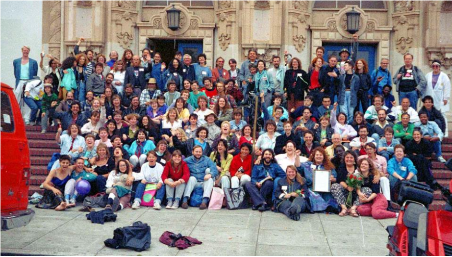
Figure 8: Participants of the first ever National Conference on Bisexuality sit on the steps of the Mission High School, San Francisco, California, June 1990.

One of the most catalyzing and foundational conferences of the US bisexual movement took place in June 1990 at San Francisco's Mission High School (Figure 8). 60 The conference was the result of outreach done during the 1987 March on Washington for Lesbian and Gay Rights mentioned earlier, and drew over 450 people from twenty US states and five countries. The school is located directly across from Dolores Park in the Mission District, and in the beautiful weather that weekend, many conference goers took their conversations out onto the grass across the street and created impromptu workshops on the balconies and in the courtyard of the old school. It was at this conference that BiNet USA, the oldest national bisexual organization in the United States, was inaugurated. 61