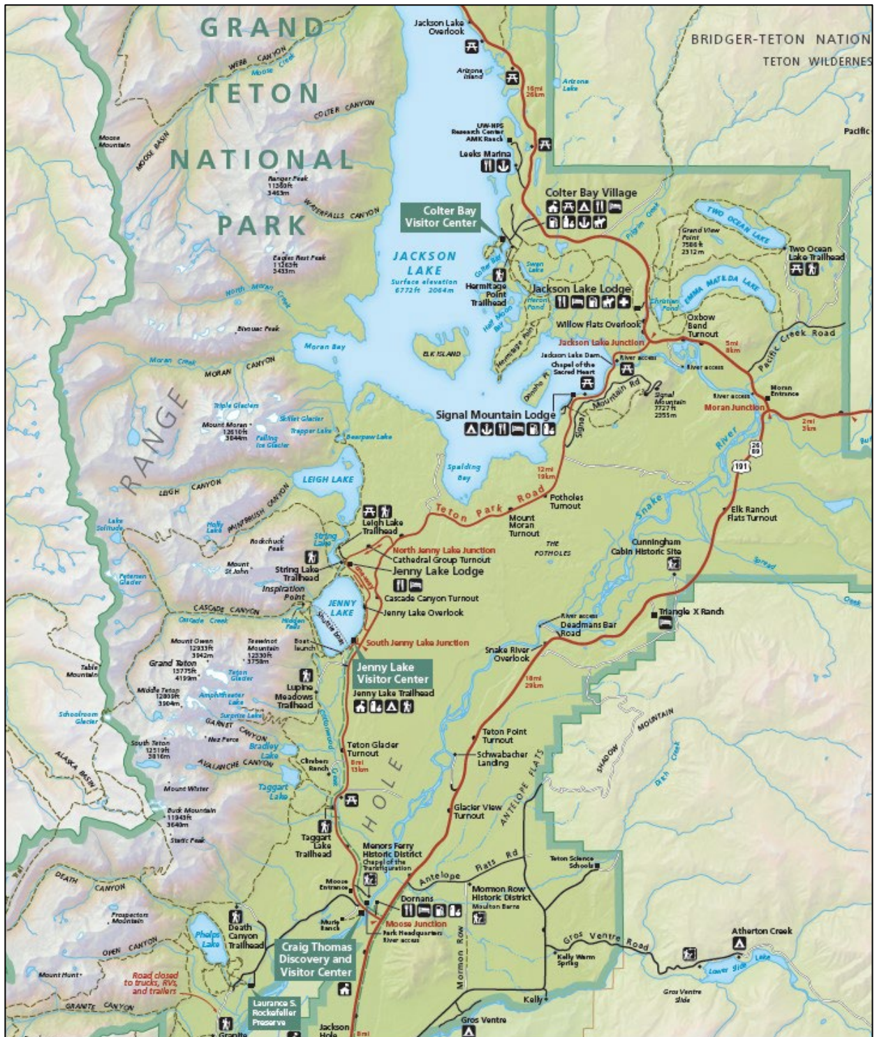
Exhibit 1. Map of Grand Teton National Park